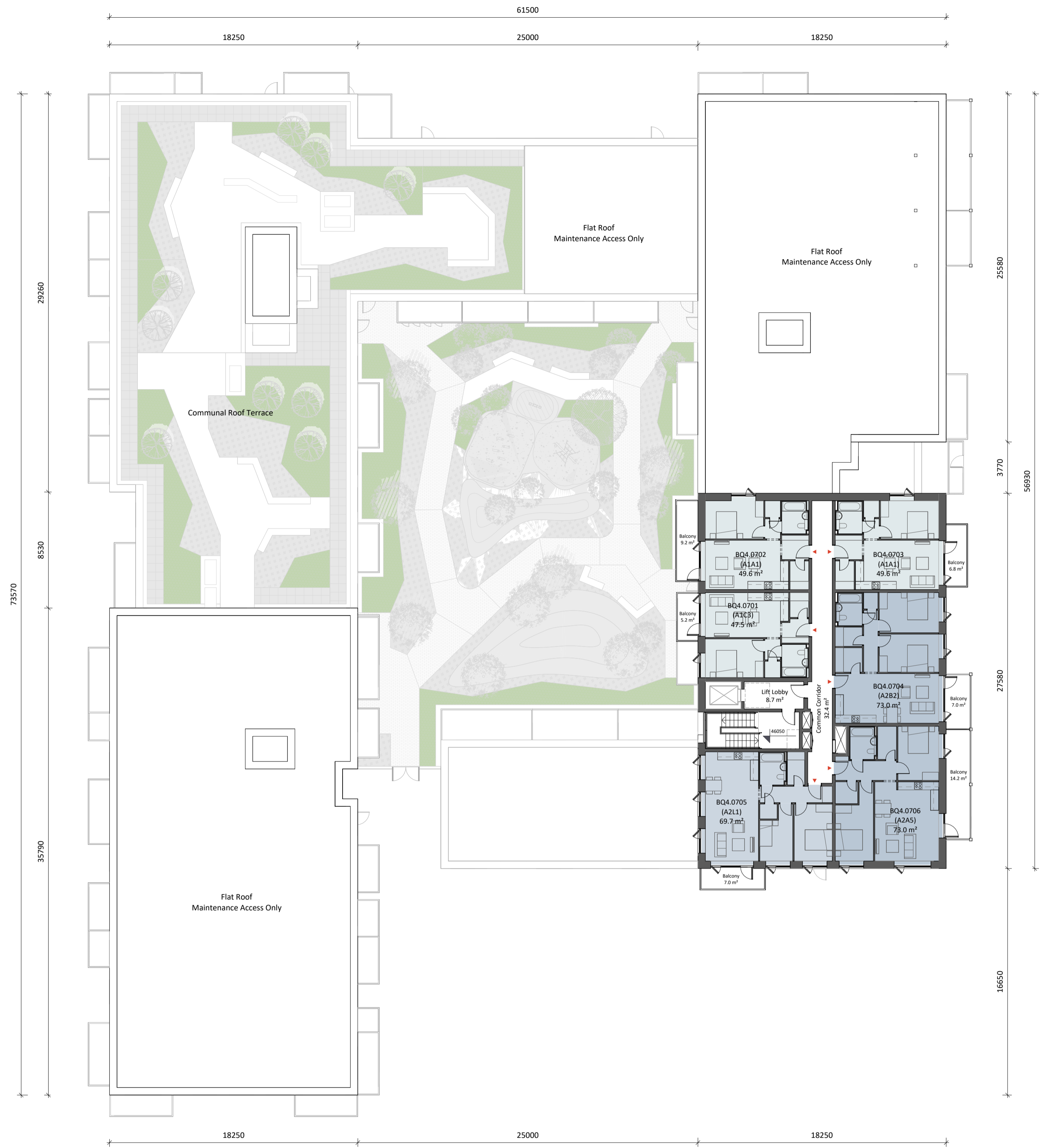
2 Block Q - Seventh Floor 1:200