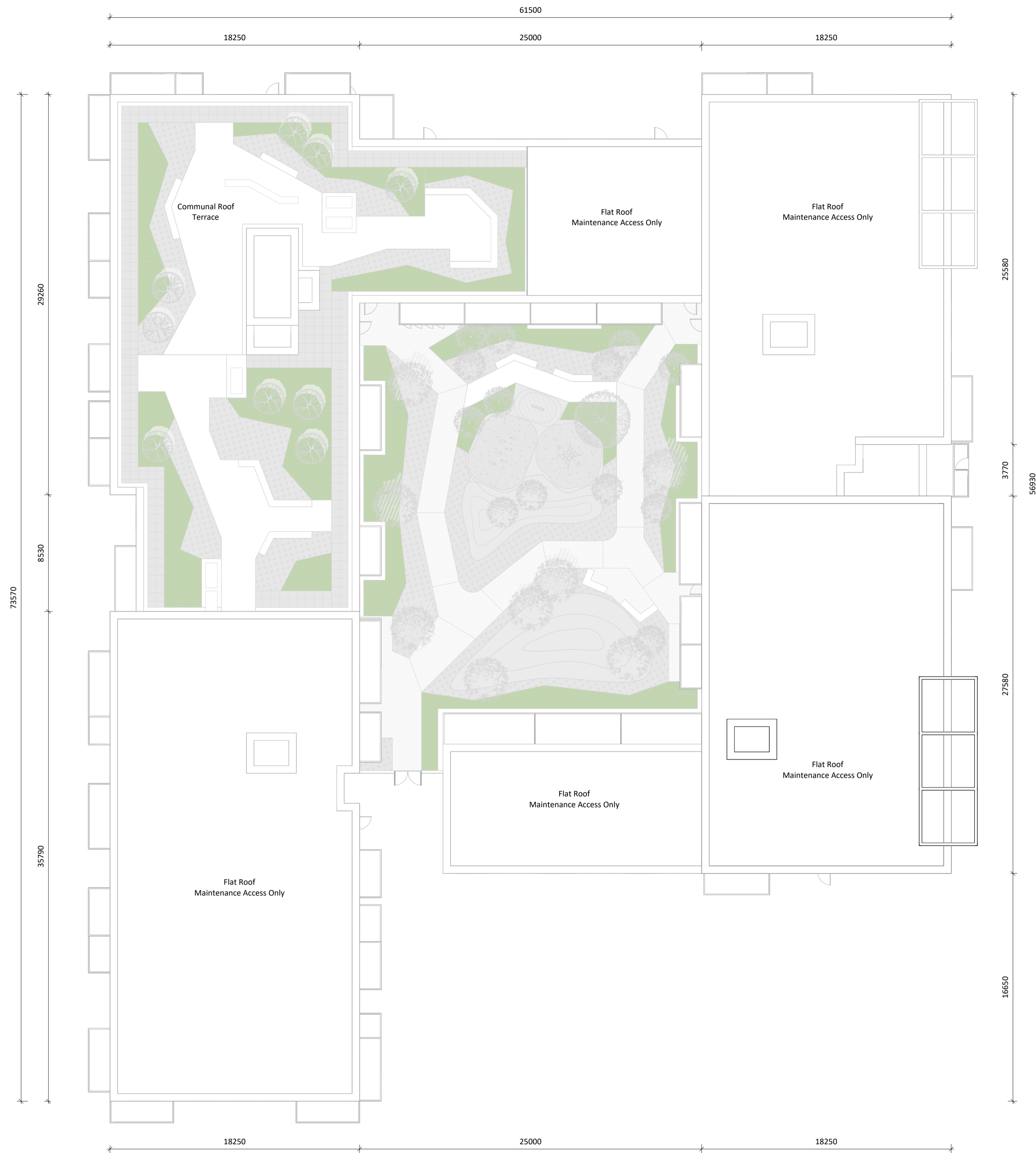
1 Block Q - Roof Plan 1 : 200