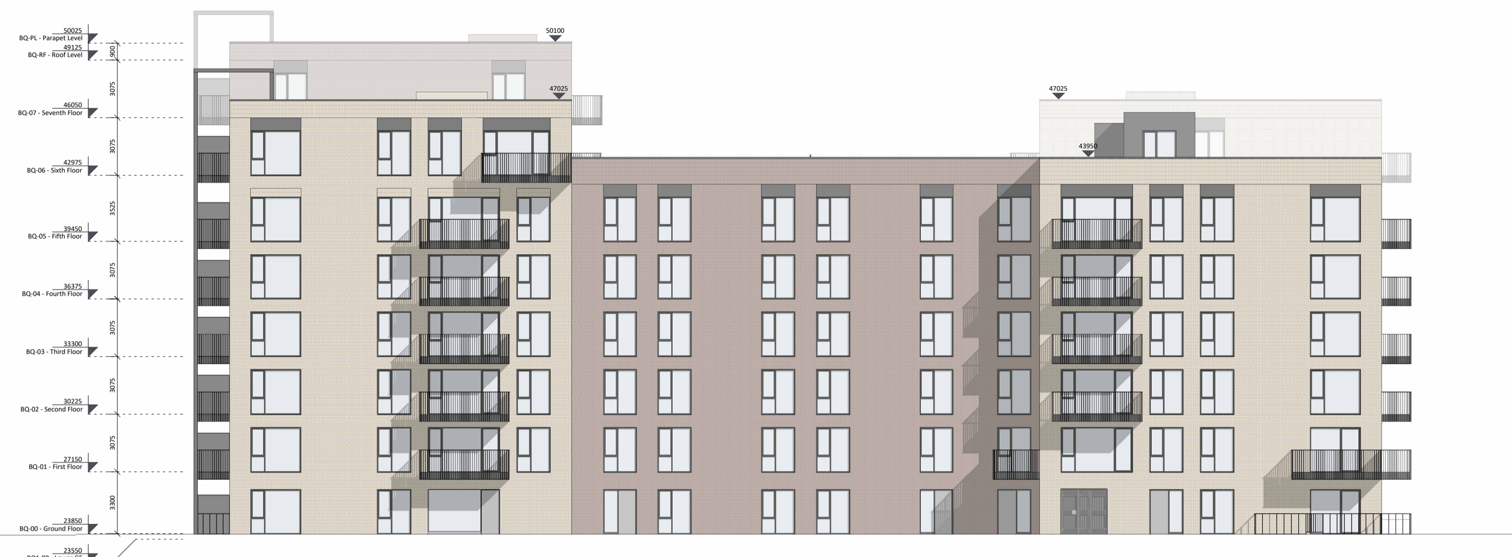
2 Block Q - North Elevation 1 : 200