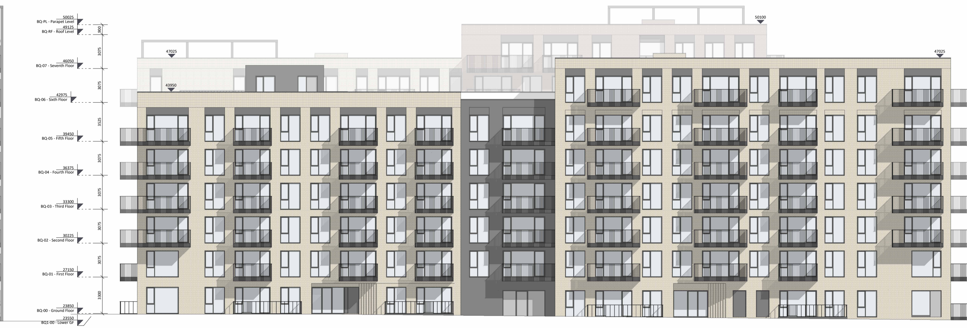
4 Block Q - West Elevation 1 : 200