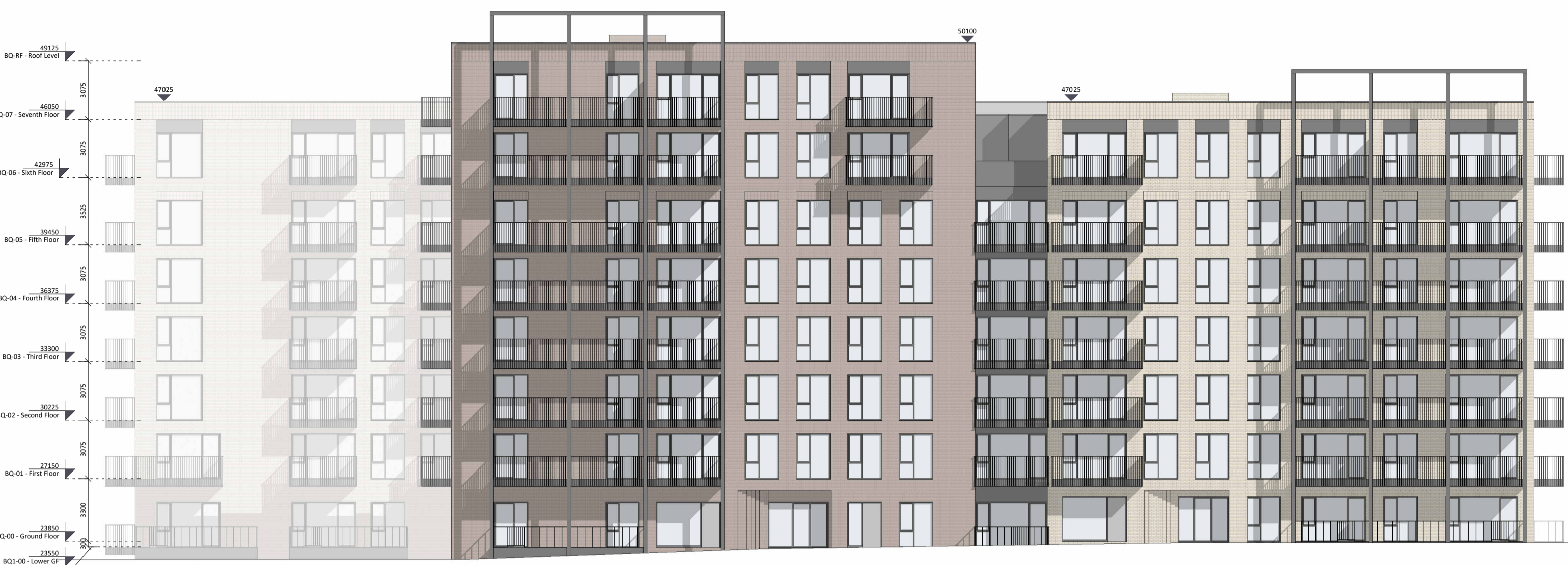
1 Block Q - East Elevation 1 : 200