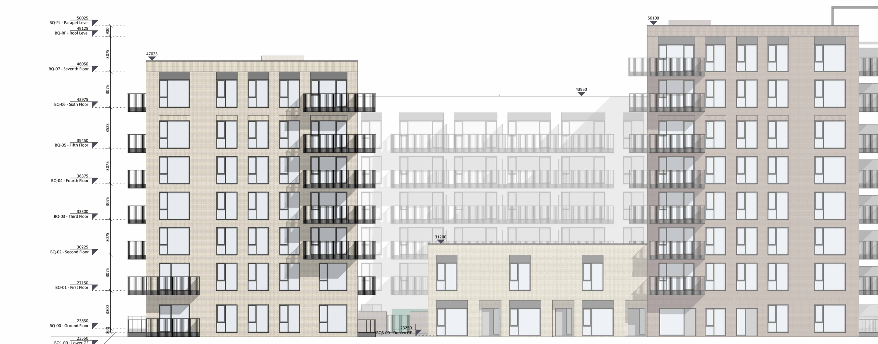
3 Block Q - South Elevation 1 : 200