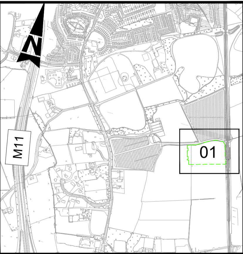
KEY PLAN Scale NTS