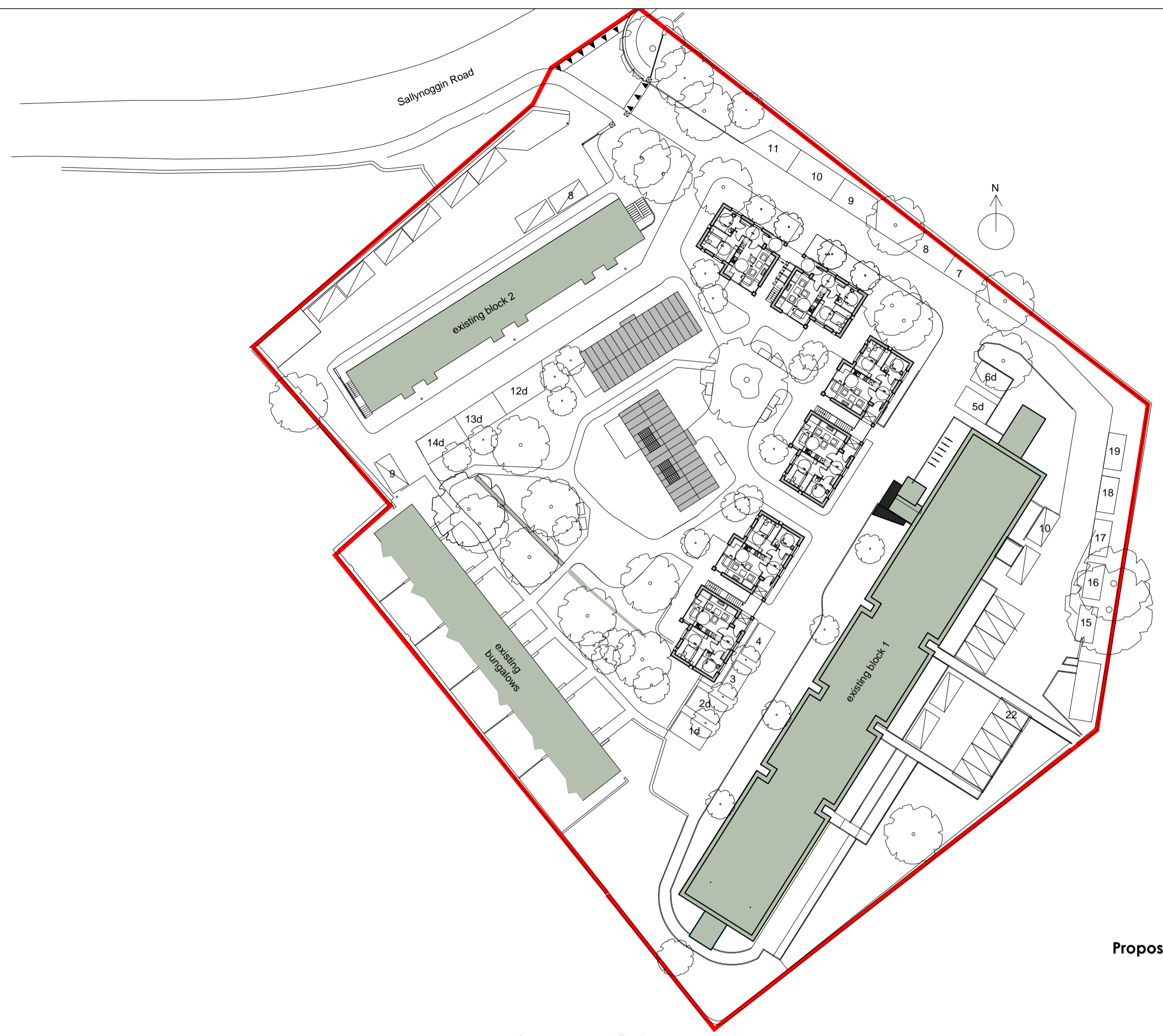
Proposed First Floor Plan