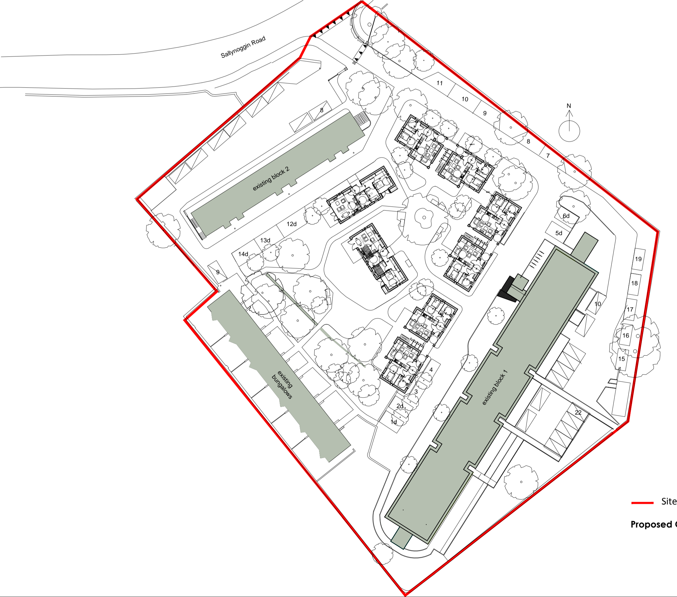
— Site boundary Proposed Ground Floor Plan