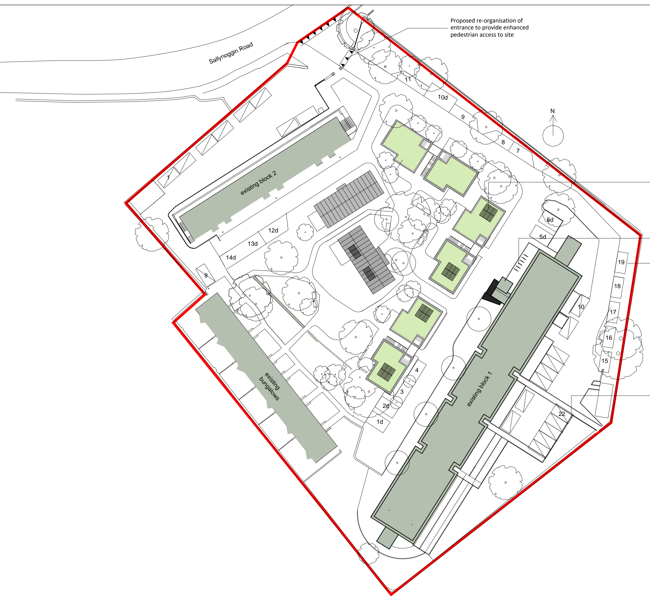
Proposed Roof Plan