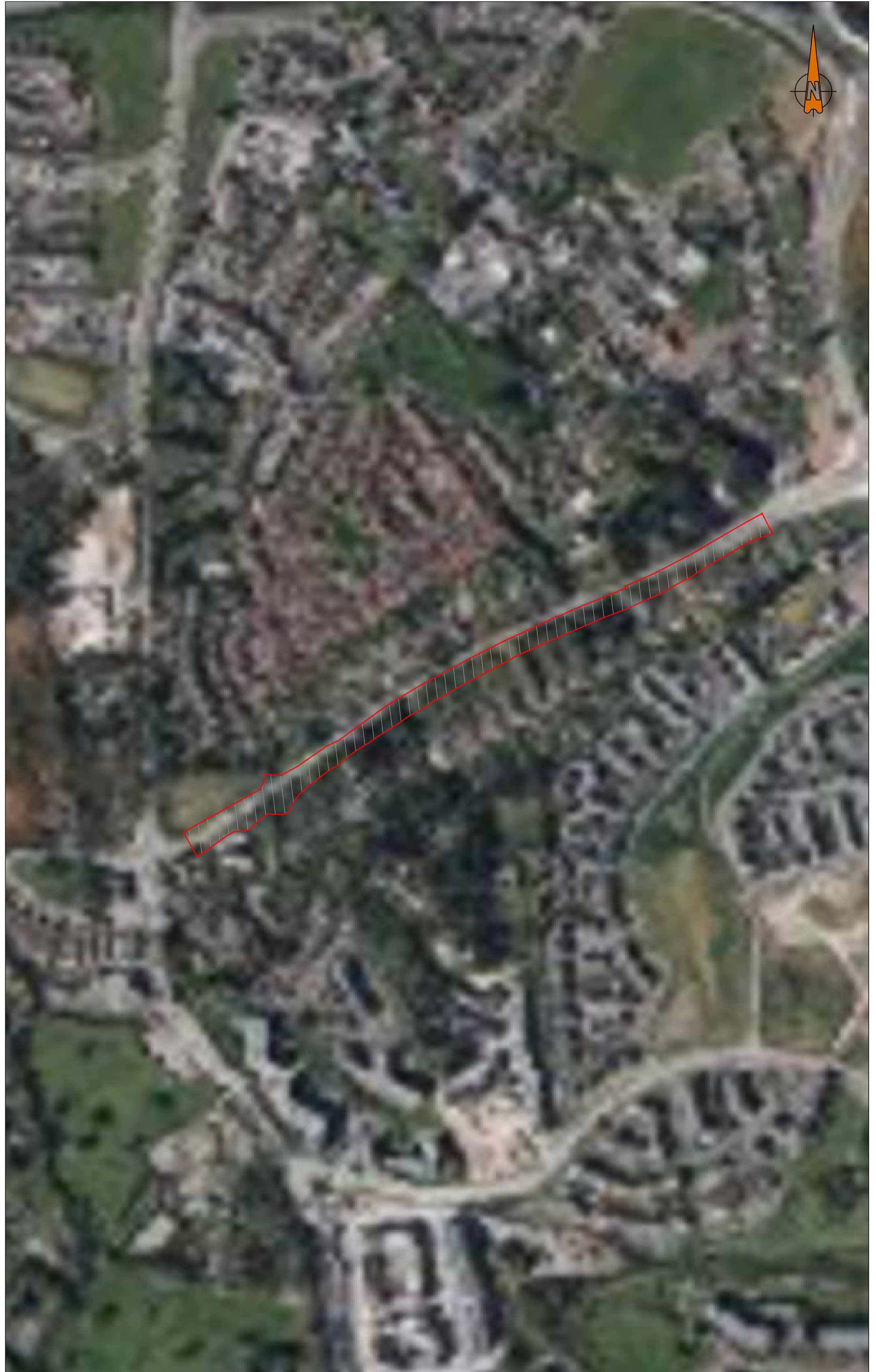
Study Area SCALE: 1:2500 @A1