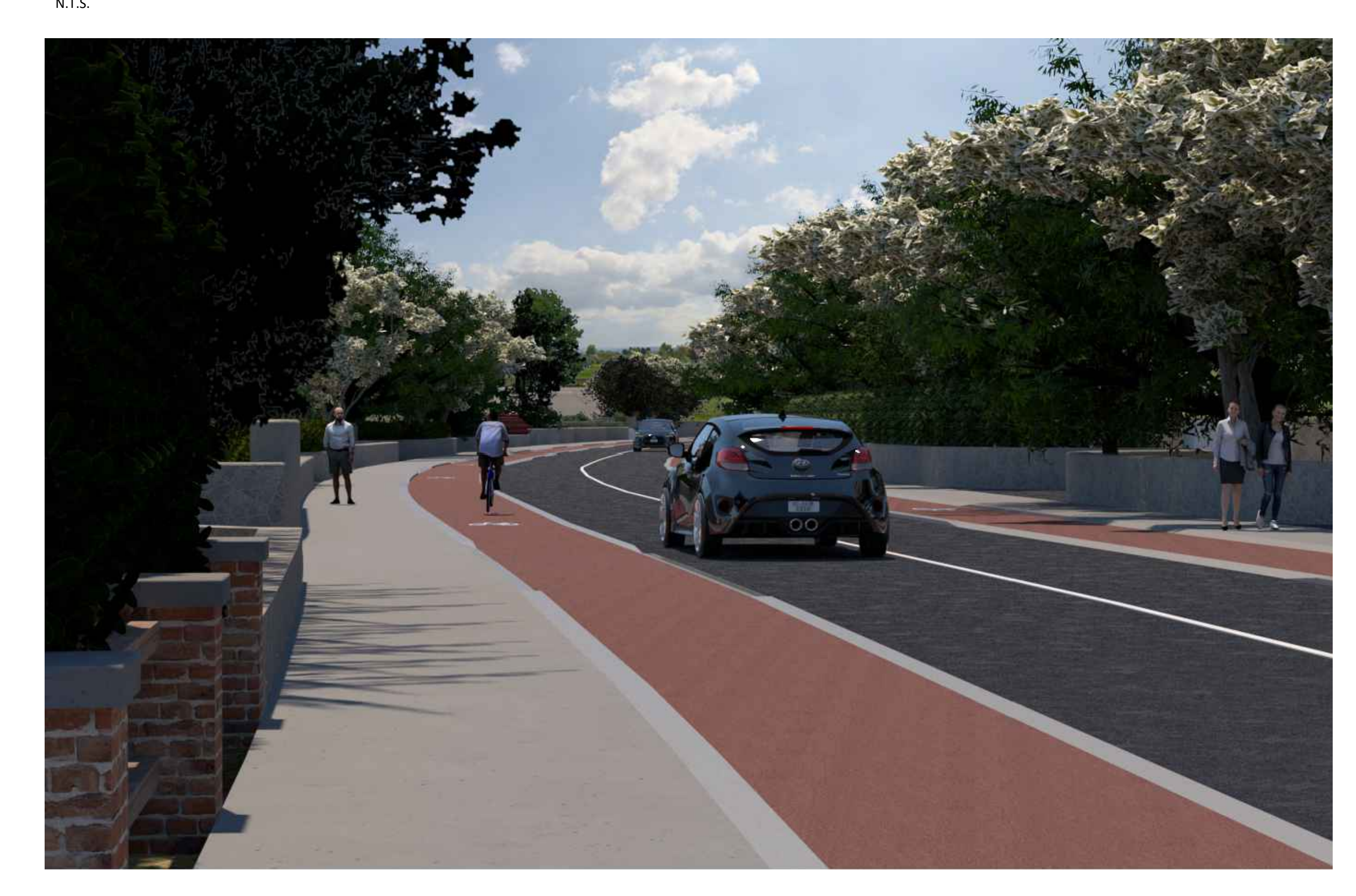
GREENPARK ENTRANCE - PROPOSED LAYOUT