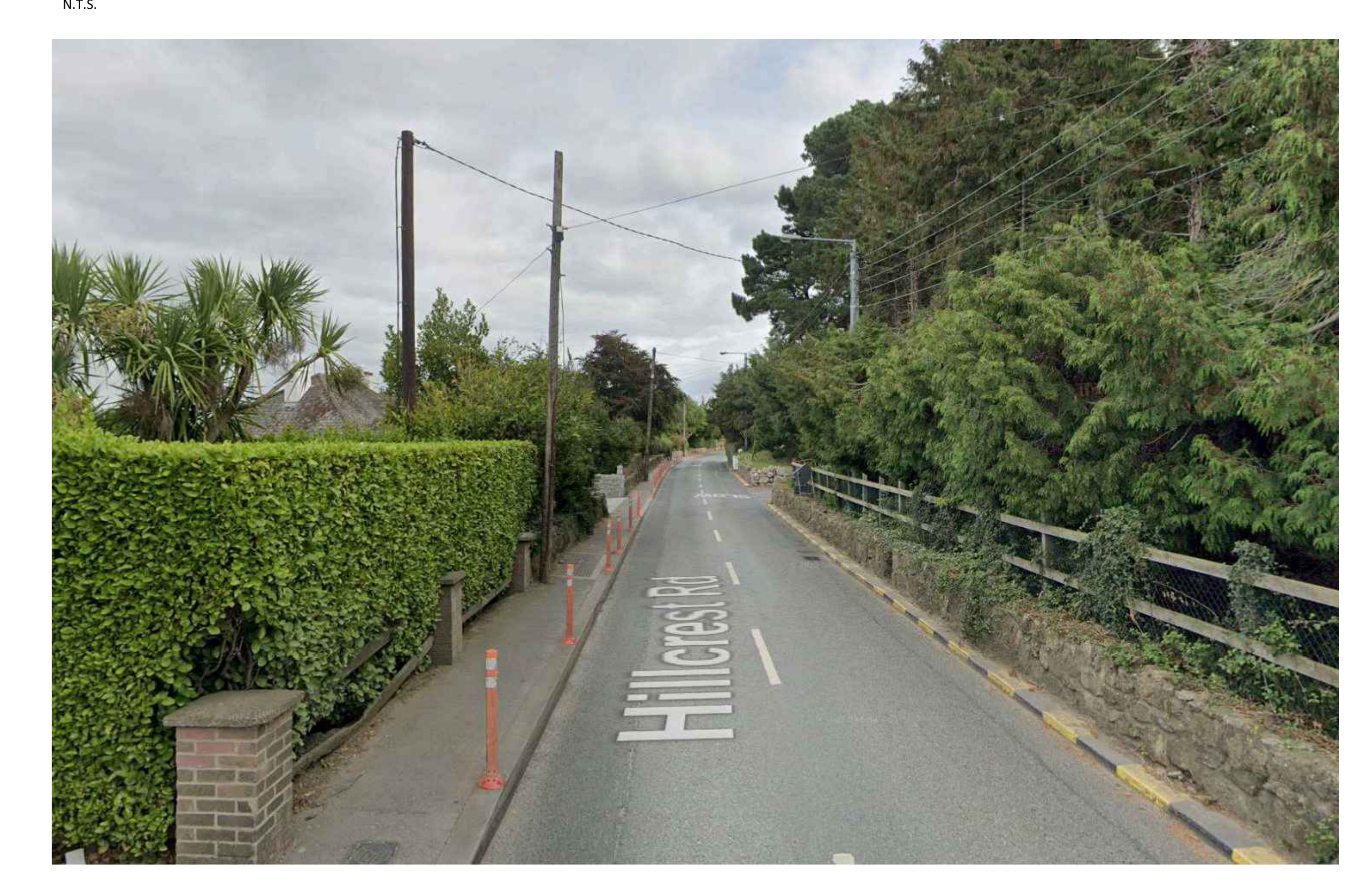
GREENPARK ENTRACE - EXISTING LAYOUT