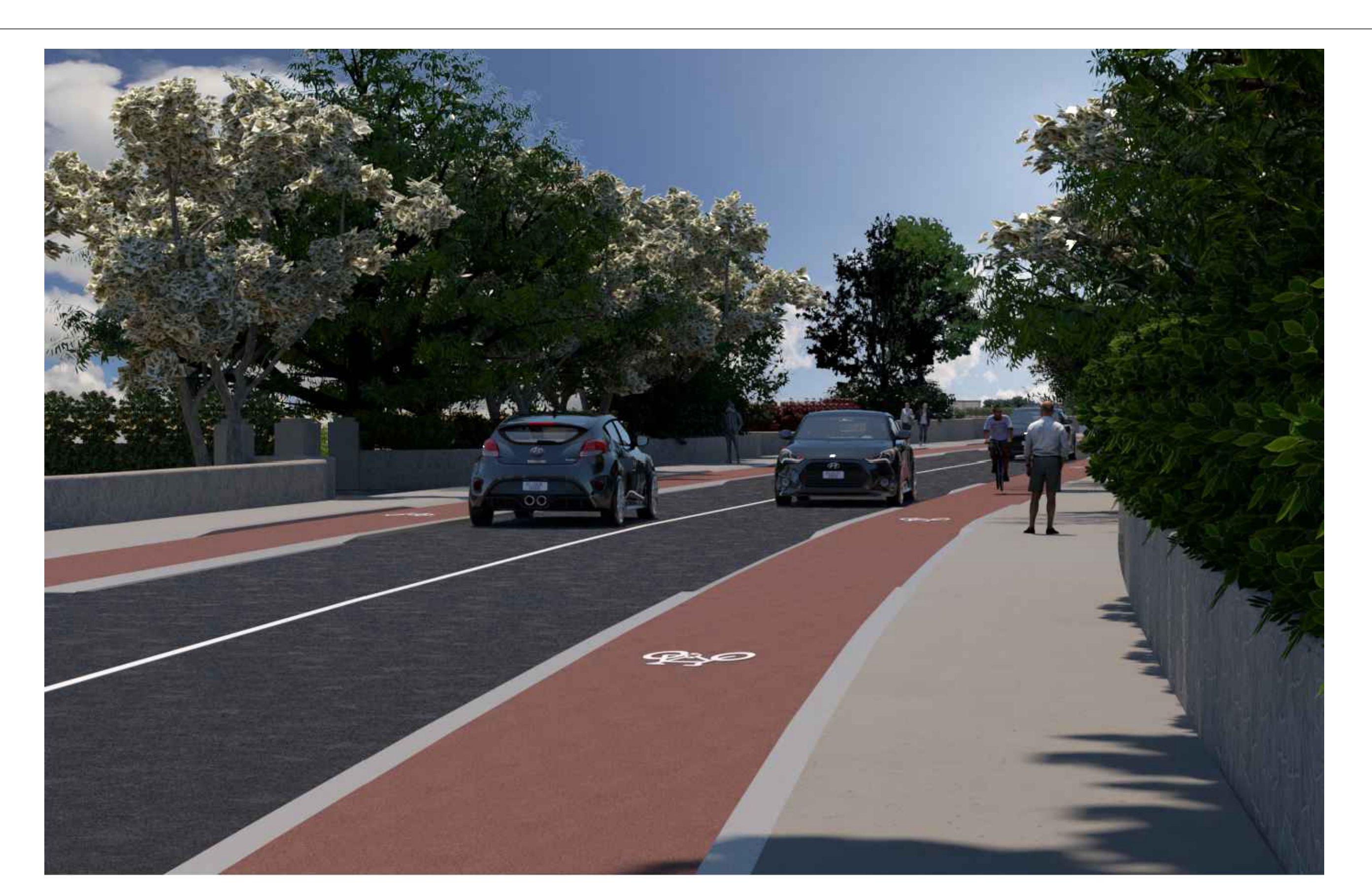
TURVEY AND BIRCH LODGE ENTRACE - PROPOSED LAYOUT N.T.S.