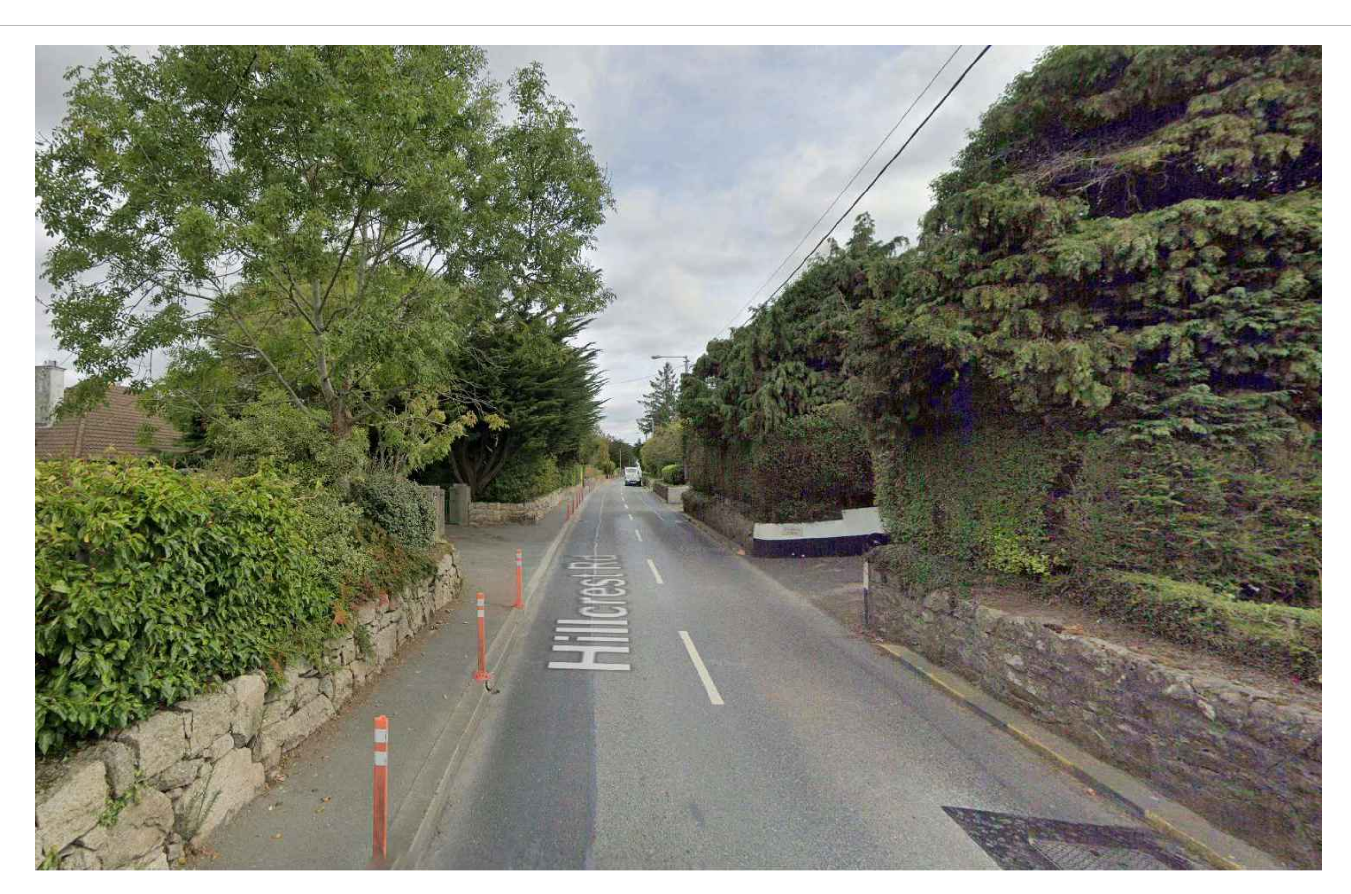
TURVEY AND BIRCH LODGE ENTRANCE - EXISTING LAYOUT N.T.S.