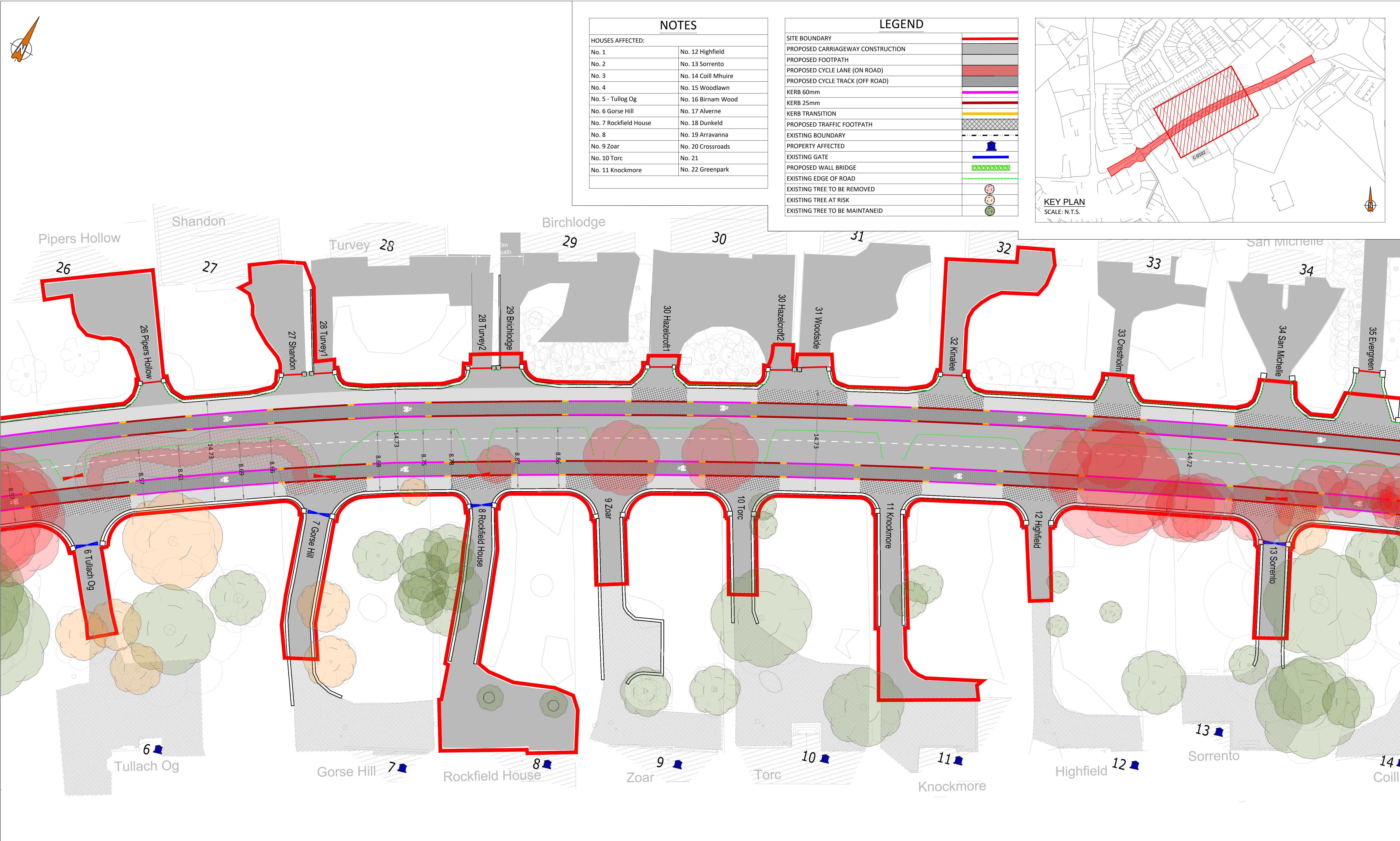
LAYOUT PLAN SCALE: 1:250