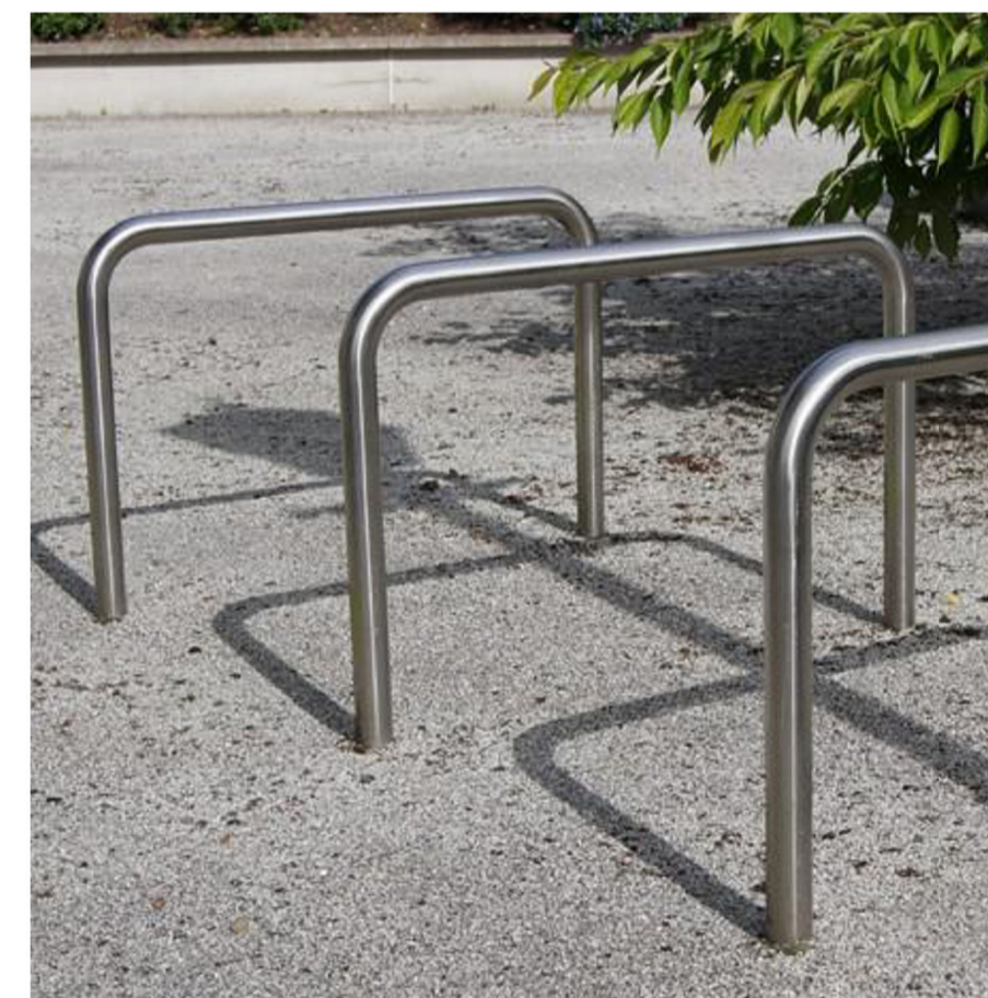
SHEFFIELD BIKE STAND