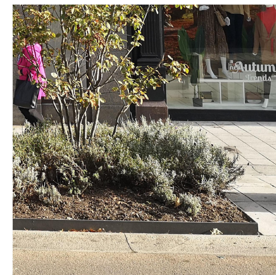
STEEL PLANTER EDGE