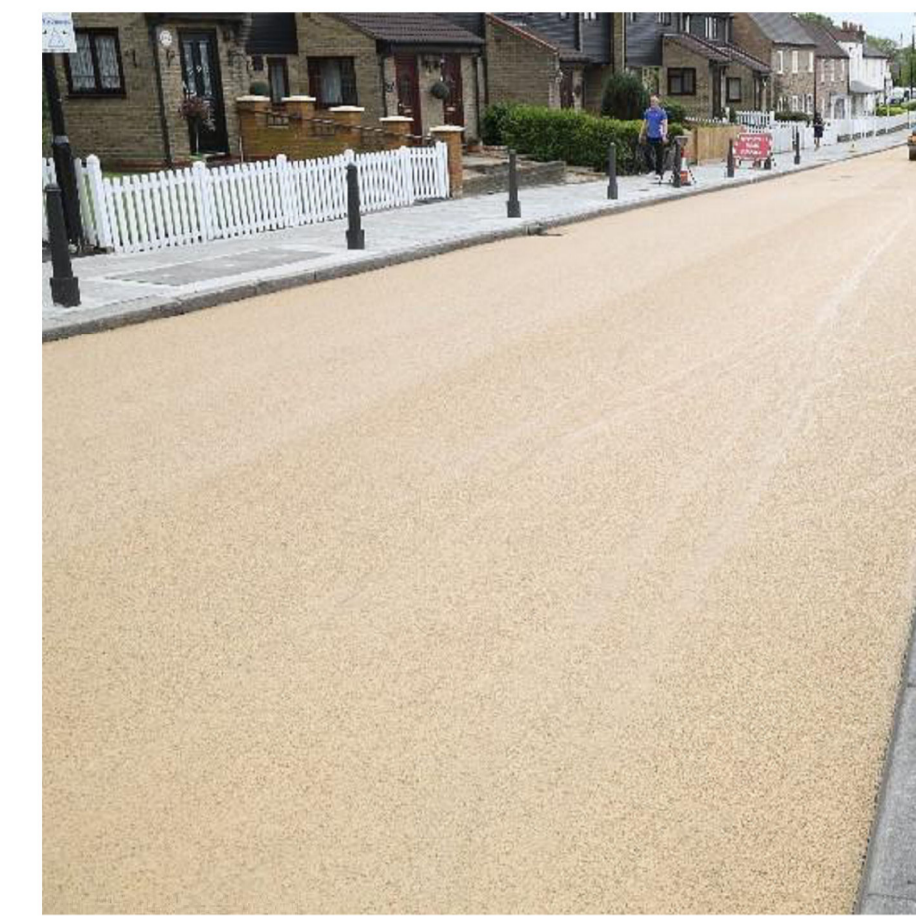
P3 - HIGH FRICTION SURFACE