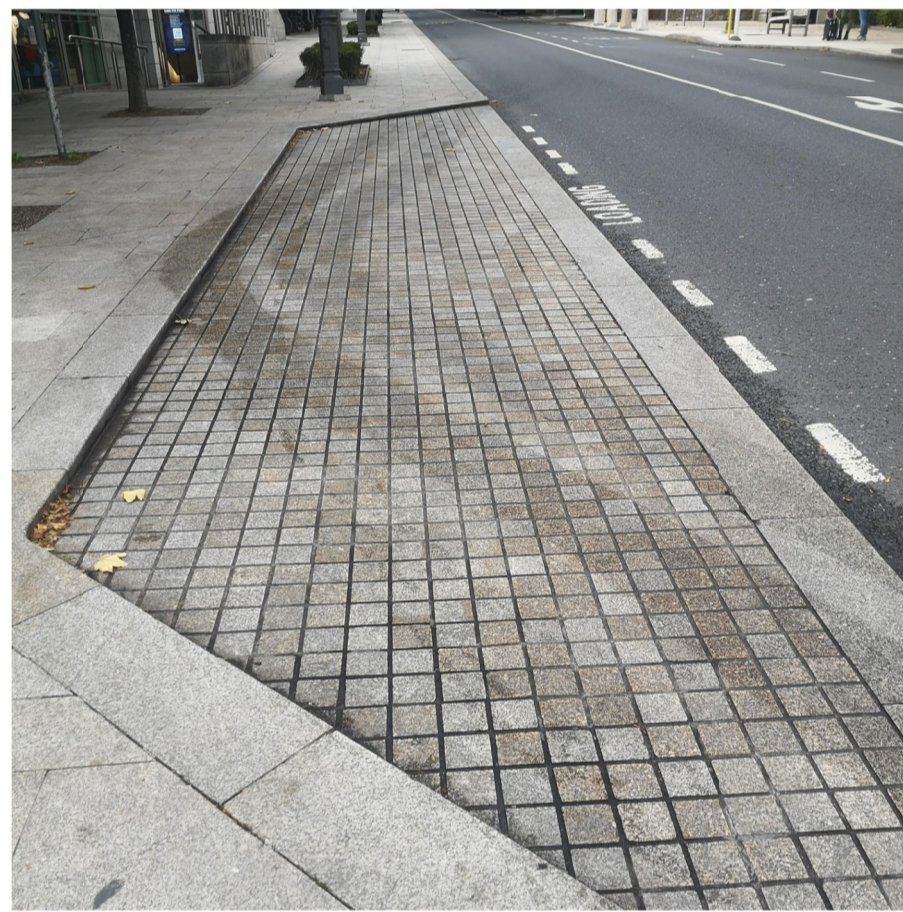
P5 - GRANITE SETS (TO PARKING BASE)