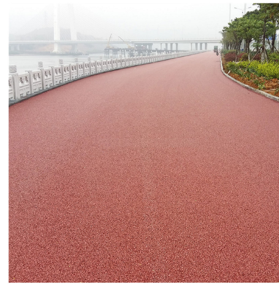
P2 - HIGH FRICTION SURFACE TO CYCLE LANE