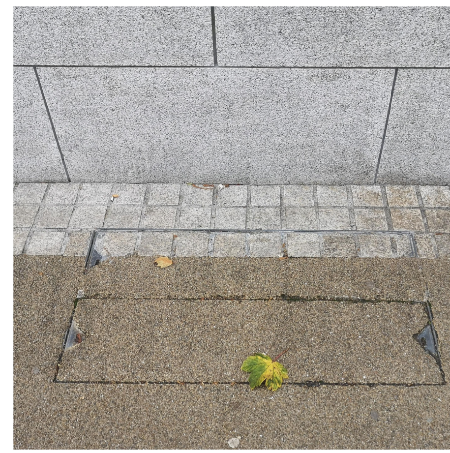
P1 - GRANITE PAVING SETS TO BUILDING EDGE