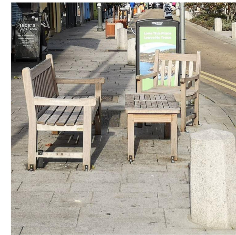
F1 - FIXED FURNITURE - TABLE AND CHAIR (ALTERNATE)