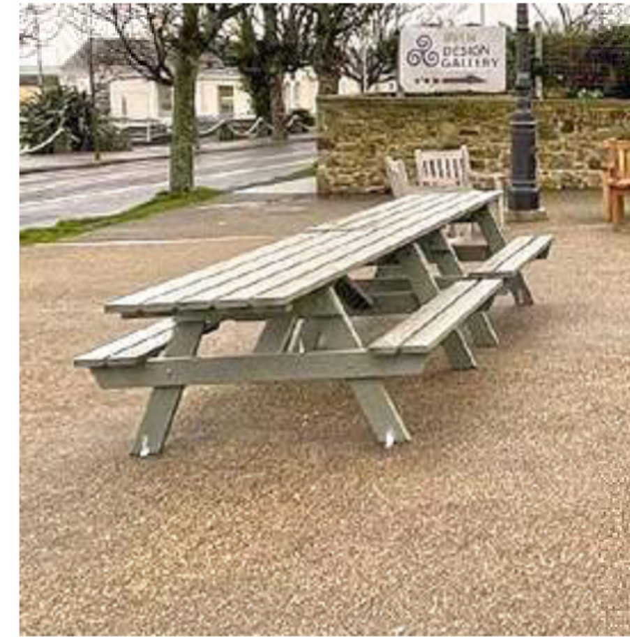
F1 - FIXED FURNITURE - PICNIC TABLE (ALTERNATE)