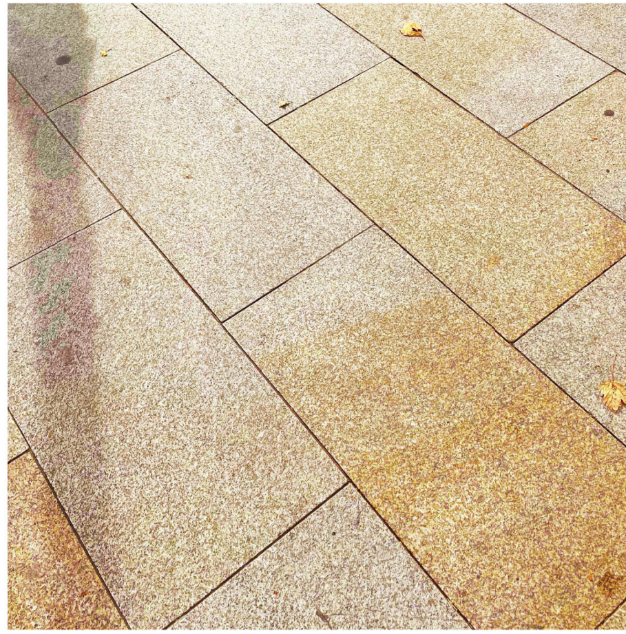
P1 - GRANITE PAVING FLAGS (BUFF COLOUR TO FOOTPATH)