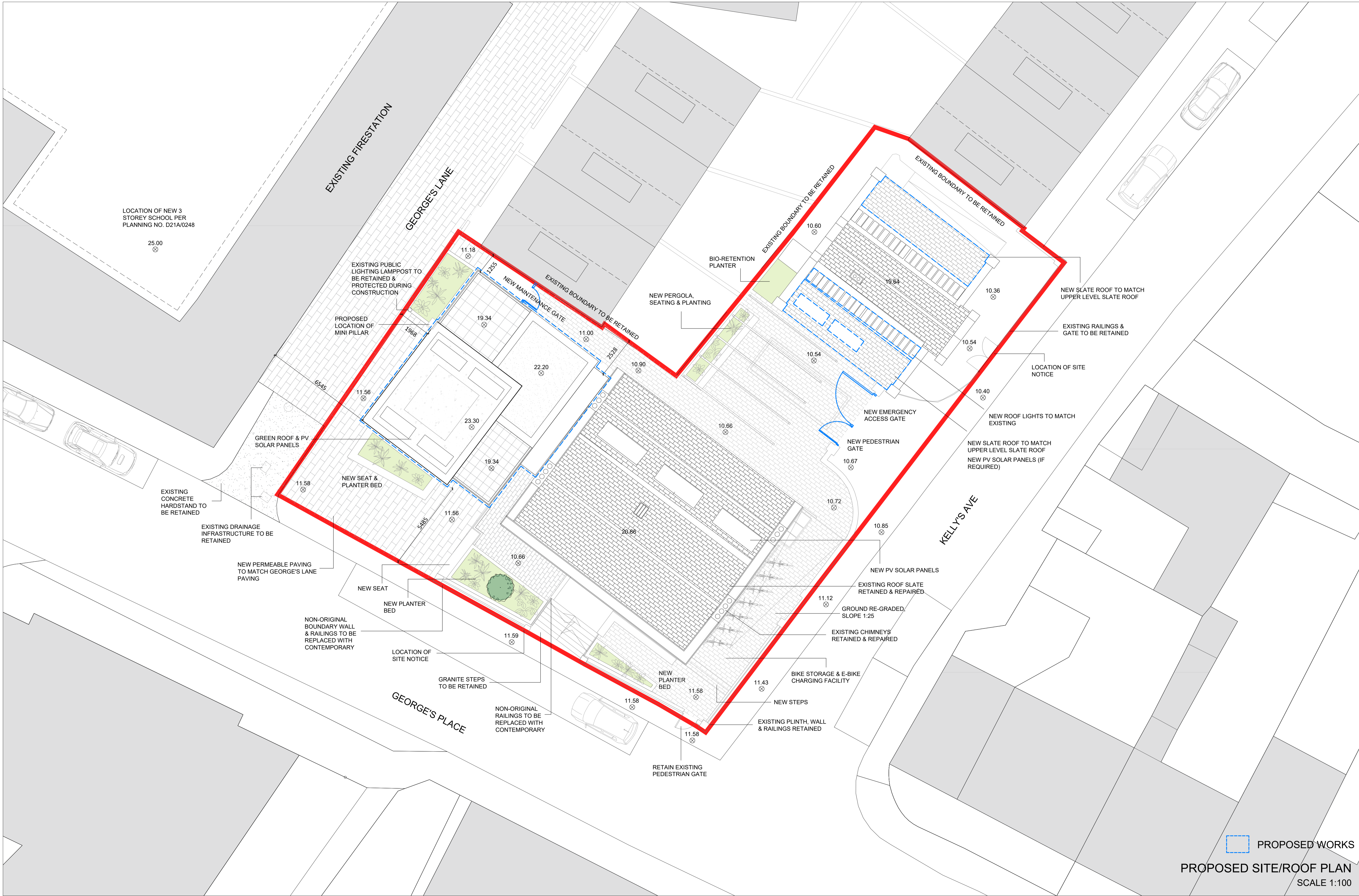
PROPOSED WORKS PROPOSED SITE/ROOF PLAN SCALE 1:100