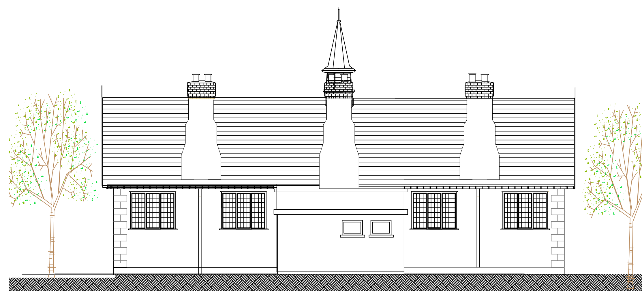
BACK ELEVATION P-P 1:100