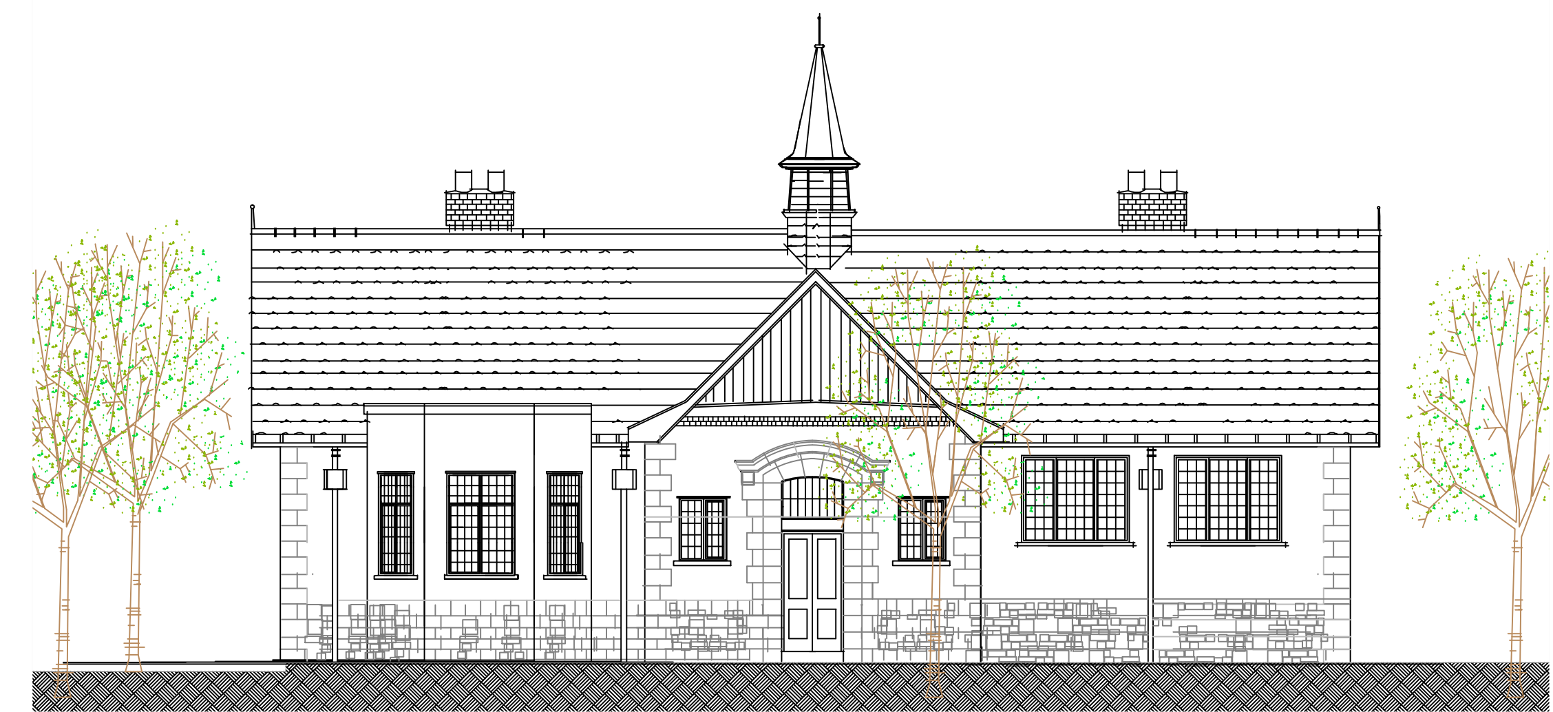
ENTRANCE ELEVATION O-O 1:100