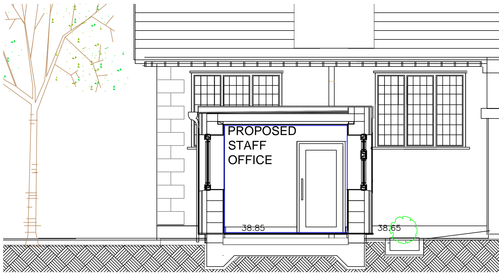
Section A-A- 1:50 New Extension

Porotherm block plaster internally and external finish cedar cladding Zinc roof and parapet cladding Aluclad windows Concrete raft foundation