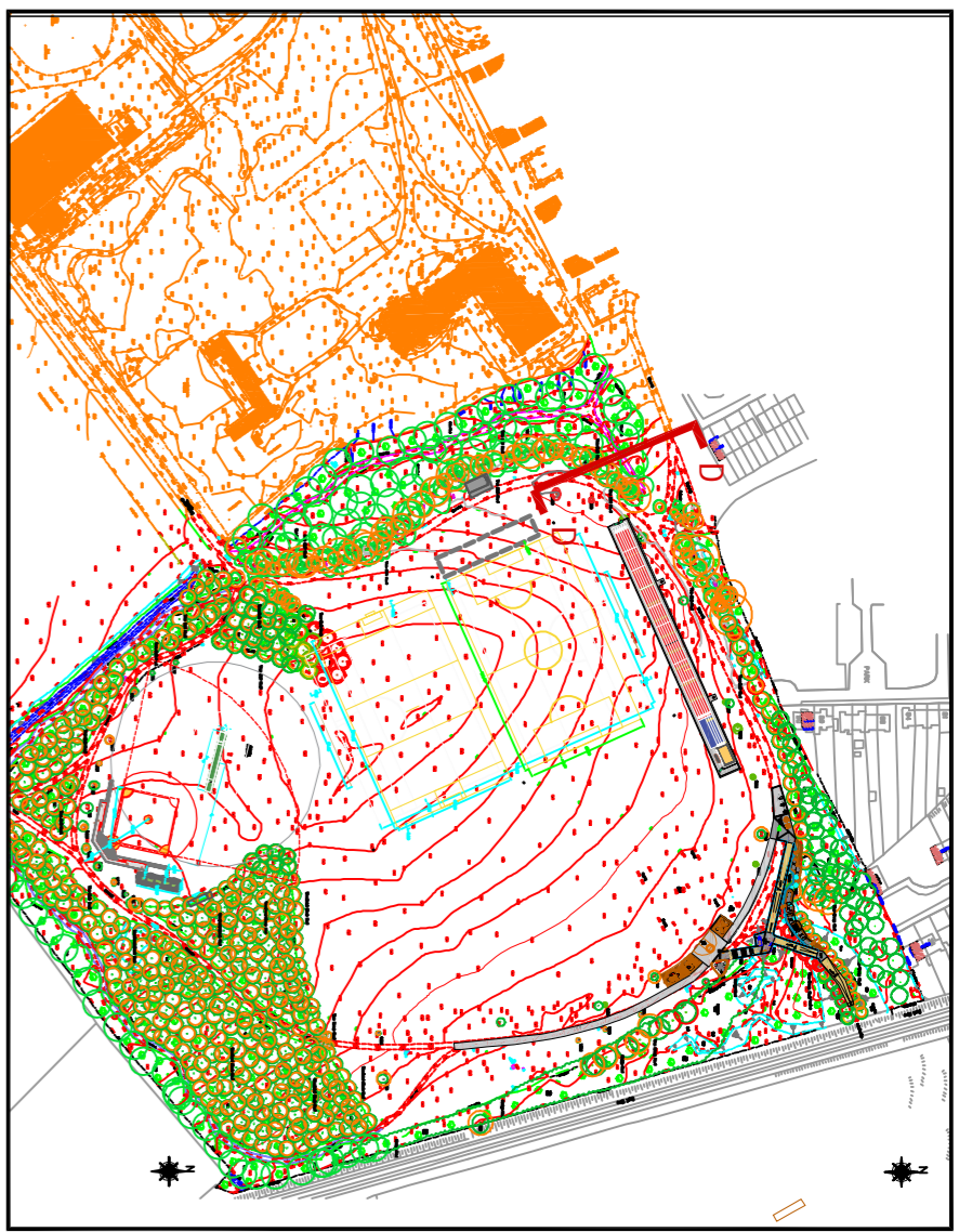
KEY PLAN Scale: 1:400 @ A1