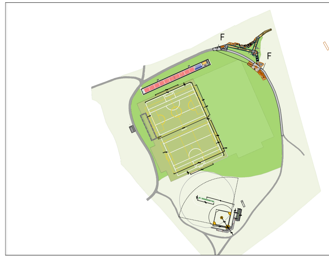
KEY PLAN Scale: 1:4000 @ A1