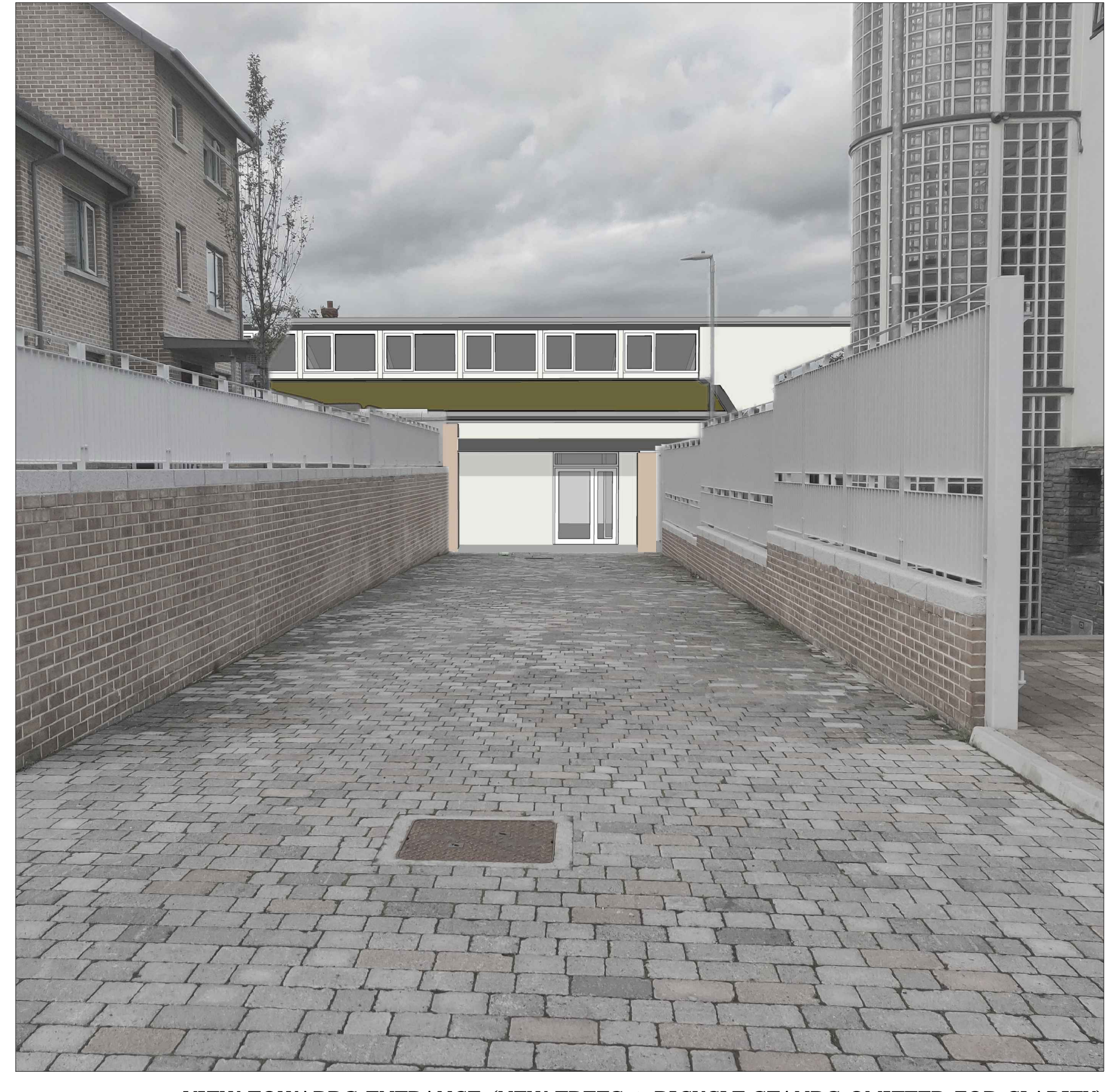
VIEW TOWARDS ENTRANCE (NEW TREES & BICYCLE STANDS OMITTED FOR CLARITY)