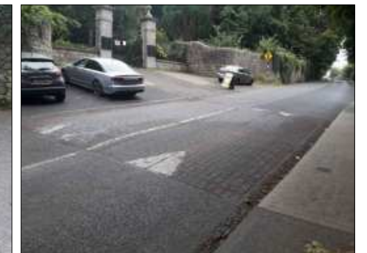
8. Traffic Calming table