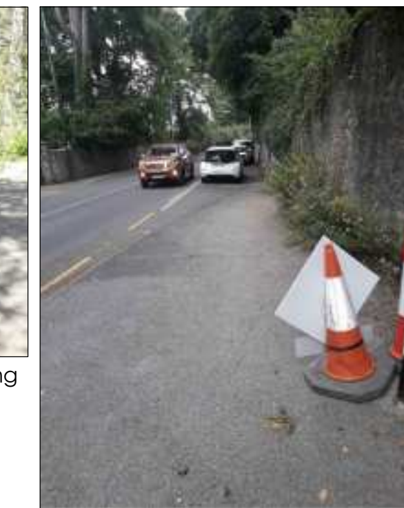
6. Stone Boundary Wall