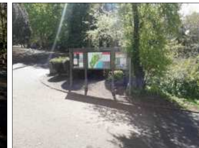
4. Park Signage