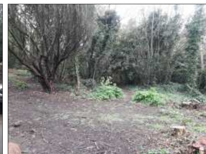
11. Sloped embankment