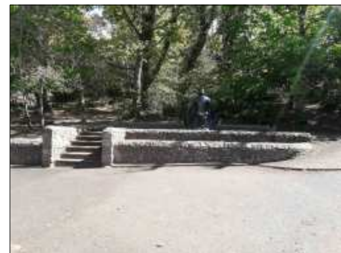
1. Sculptural piece