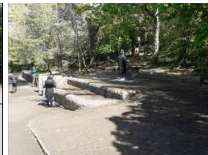
2. Linear Stone Planter