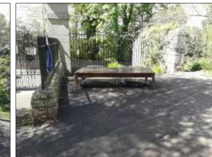
5. Access Chamber with Timber Seating