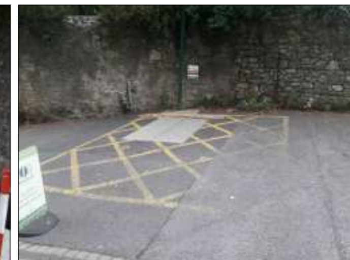
7. Gas access chamber