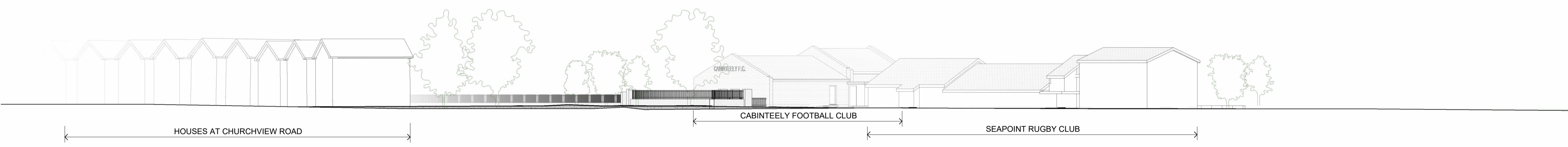
3 Existing north contiguous elevation 1 : 250