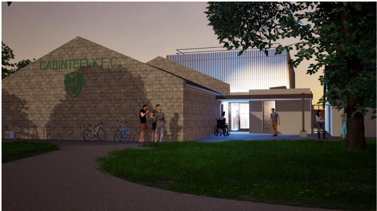
Fig. 19 CGI of Evening View of Entrance to Proposed Sports Pavilion to the Right and of Existing Cabinteely FC Building on the Left