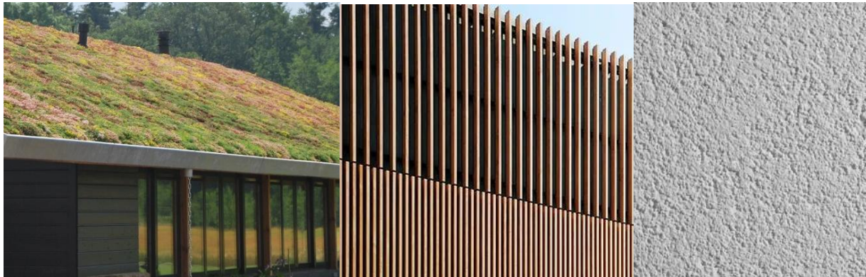
Fig. 16 Proposed Material Palette Showing Intensive Green Roof, Composite Timber Slats and Render

Changing rooms and WCs are accessible from the perimeter of the two-storey block. On the 1 st floor a picture window from the gym overlooks the grass pitches and beyond, with views towards the Dublin Mountains.