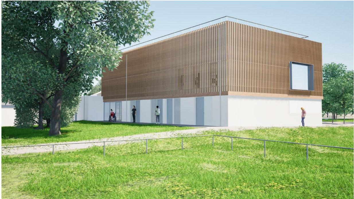
Fig. 13 CGI of View from the North-West Towards the Proposed Sports Pavilion. NTS