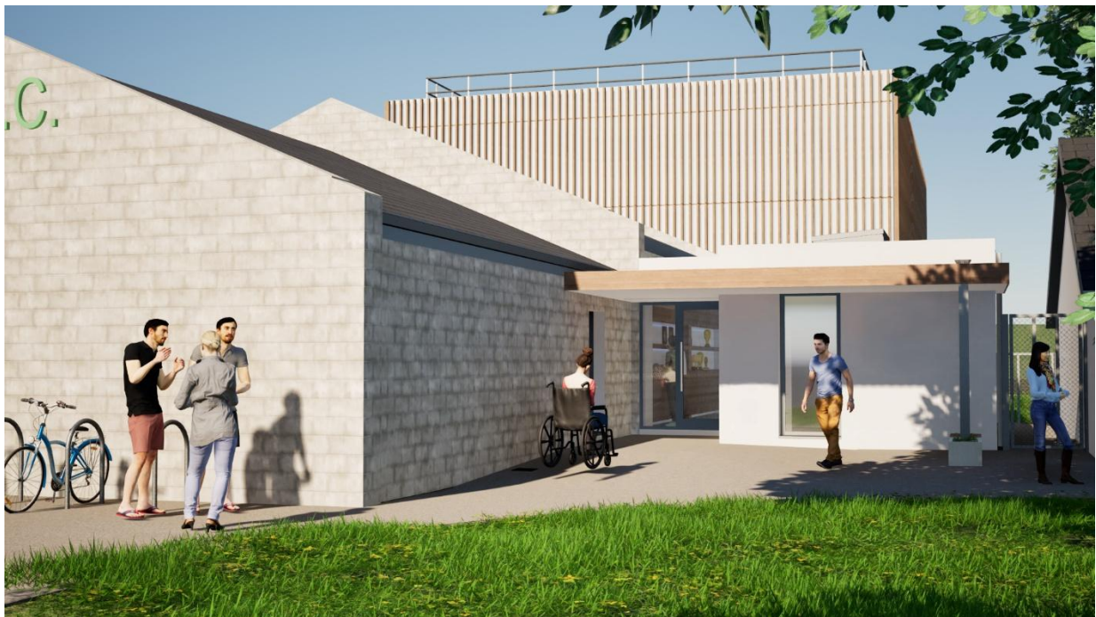
Fig. 1 CGI of Existing Cabinteely FC Building on the Left and Entrance to Proposed Sports Pavilion on the Right. NTS