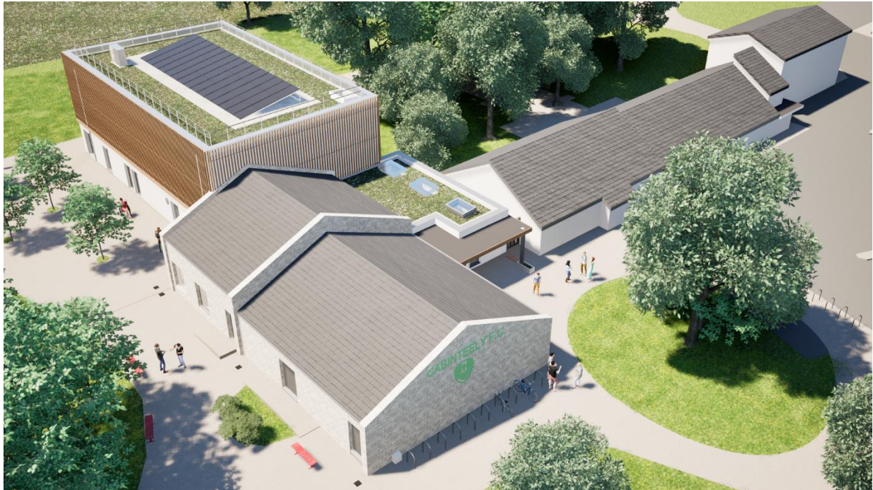
Fig. 5 CGI of Aerial View Showing Proposed Sports Pavilion Nestled Between Existing Clubhouses of Cabinteely FC and Seapoint Rugby. NTS