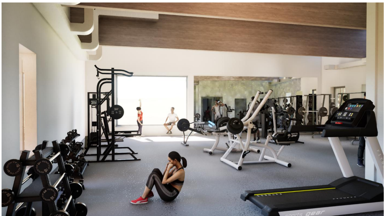
Fig. 17 CGI of View Inside First Floor Gym