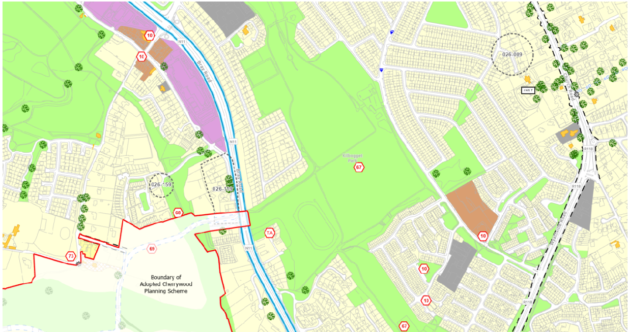
Fig. 20 Extract from Dún Laoghaire-Rathdown County Development Plan 2022-2028. NTS