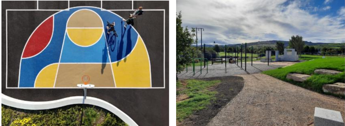
Fig. 11 & 12 Examples of 3v3 Basketball Court and Teen Space