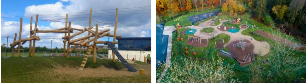
Fig. 7 & 8 Example of Play Equipment and Play Area

play area will be as accessible and inclusive as possible. Detail design will be undertaken by the contracted design and build playground company.