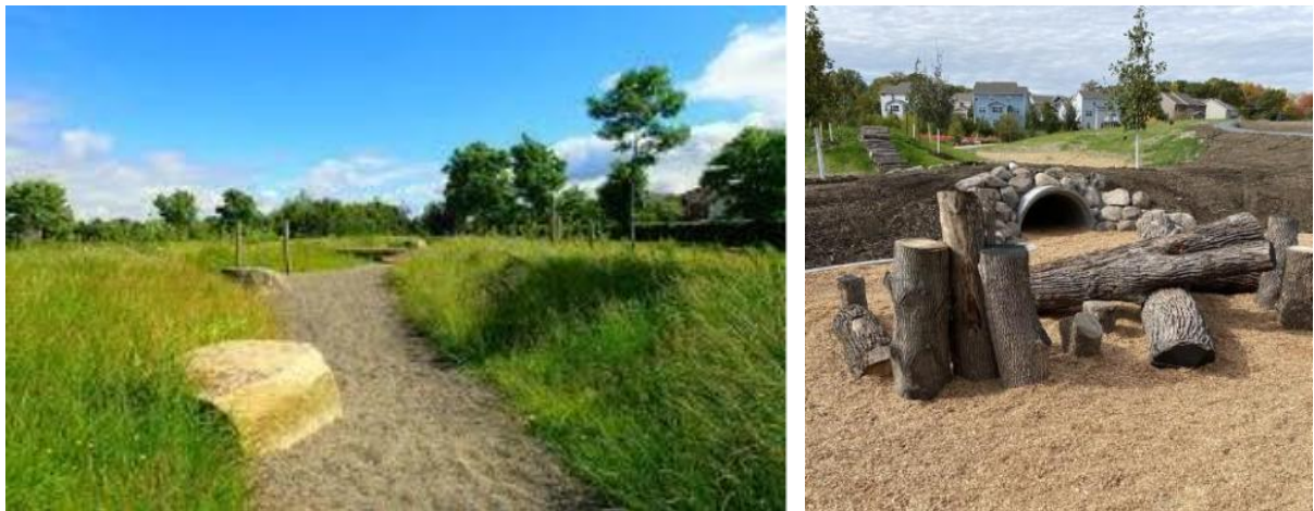
Fig. 9 & 10 Examples of Natural Play Features

The natural play area will be loose in its design and contain many new trees, grasses, landforms and boulders.