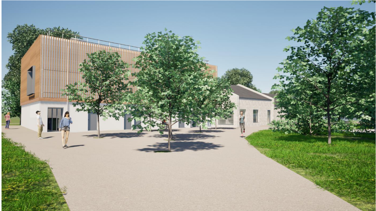
Fig. 18 CGI of Proposed Sports Pavilion to the Left in the Foreground and of Existing Cabinteely FC Building on the Right

sources, are more sustainable than concrete or steel and allow for reduced construction time on site when compared with more traditional builds.