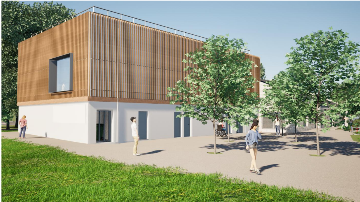
Fig. 2 CGI of View from the South Towards the Proposed Sports Pavilion. NTS