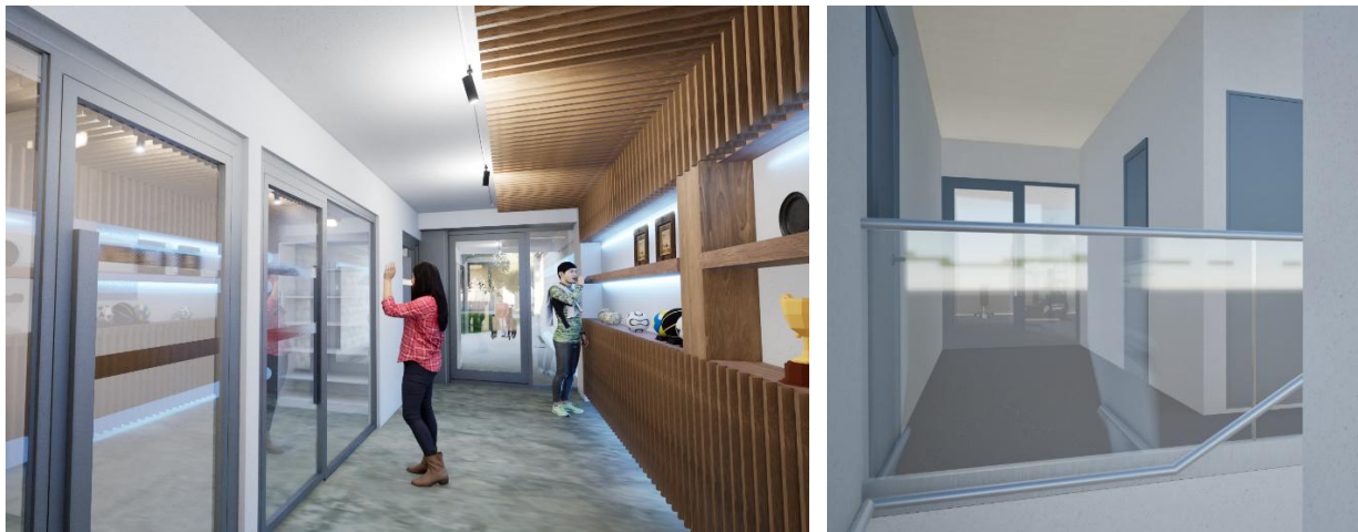
Fig. 14 & 15 CGIs of View Inside Entrance Hall and View Ascending Stairs to First Floor