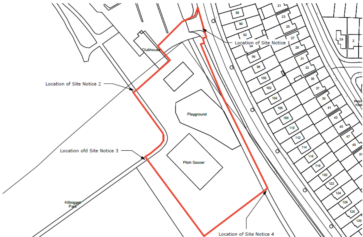
Fig. 3 Extract from OS Map, showing area of this Part 8 Application outlined in red. NTS