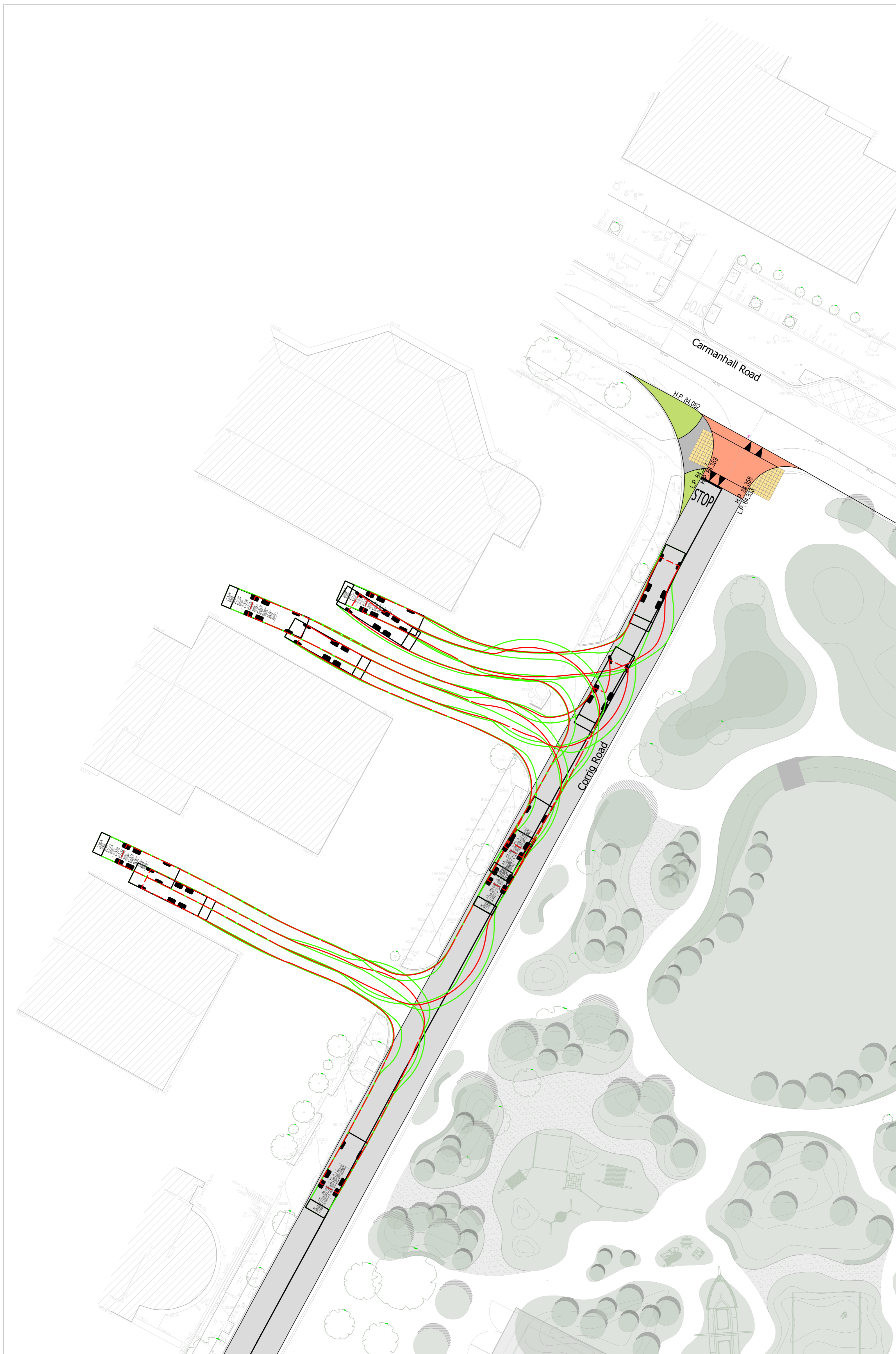
PROPOSED REFUSE VEHICLE TRACKING SIDE STREETS ONTO CORRIG ROAD SCALE 1:250