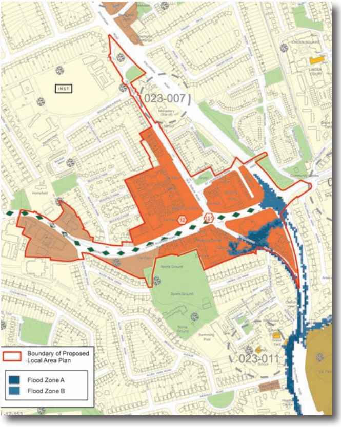
Map 20: Eastern CFRAMS Flood Zones A and B