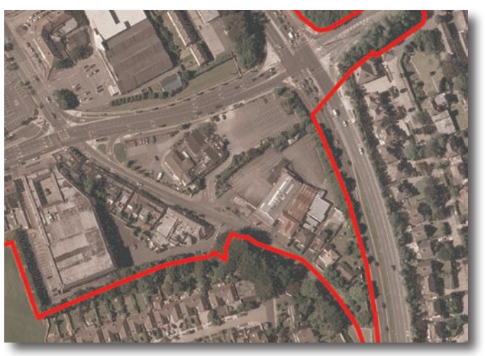
Map 19: Blakes/Esmonde Motors

As referred to in the previous Section, it is crucial that the relationship between the two taller buildings proposed for both the Blakes and Leisureplex/Library sites is carefully considered, as these two buildings will form an important 'gateway' feature to Stillorgan. The design statement that will be prepared for each landmark building will assess the coherence of approach in terms of its massing, bulk and form with any permitted or completed taller building opposite and both design approaches will consider the wider 'set piece' created by the increased building height at this important entrance to Stillorgan.