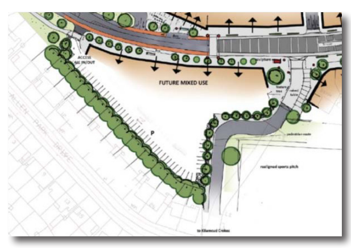
Figure 9: Overflow Car Park Long Term Proposal