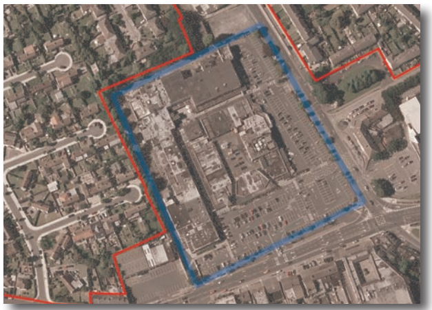
Map 17: Stillorgan Shopping Centre

The site is approximately 2.9 hectares in area and is zoned "Objective DC" 'to protect, provide for and or improve District Centre facilities'. The site is located within the 'Retail Core' of Stillorgan and holds a pivotal position at the centre of Stillorgan. The site is bounded by the Old Dublin Road to the east, the Kilmacud Road Lower to the south; the Lenehan's