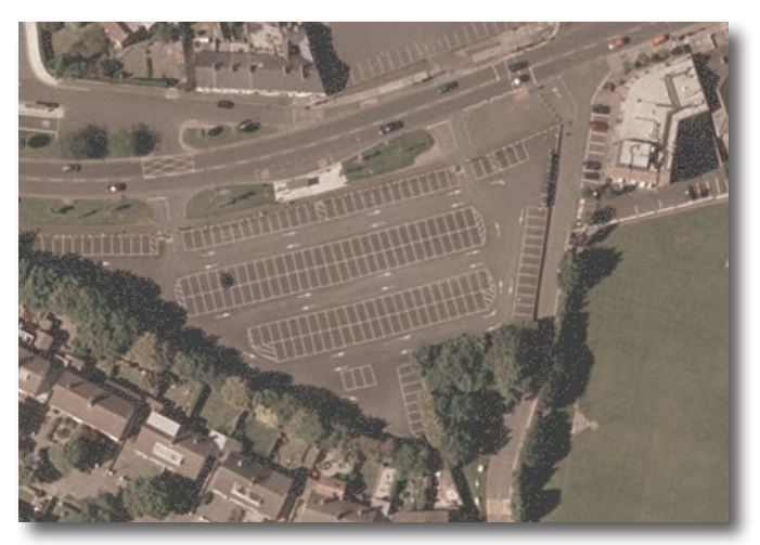
Map 21: Overflow Carpark

The relative lack of planning activity on the site over the years may be as a result of possible development constraints related to underground services, specifically wayleaves associated with number of surface water drains (both a 1200mm and a 750mm drain) in the vicinity of the site. Any future redevelopment proposals will have to address this issue.