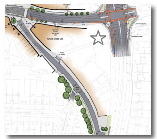
Figure 8: Blakes Esmonde Motors Long Term Proposal (location for taller building identified)