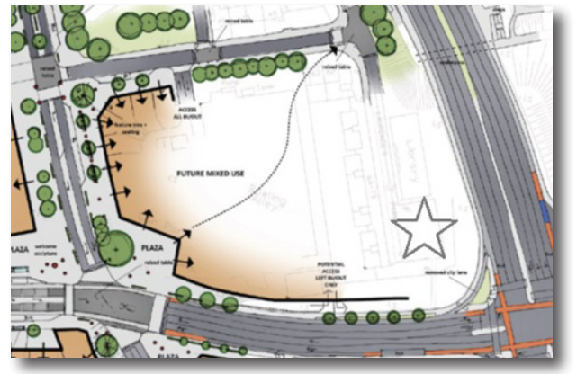
igure 7: Leisureplex , library and Environs Long Term Proposal – Landmark building location

Also, due to the visual prominence of a taller building at this location, the use of high quality, robust materials will be of critical importance.