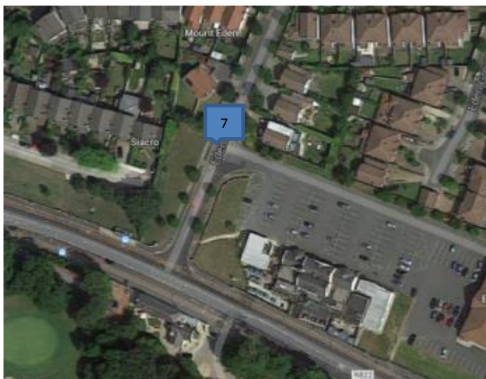
Marley Grange House