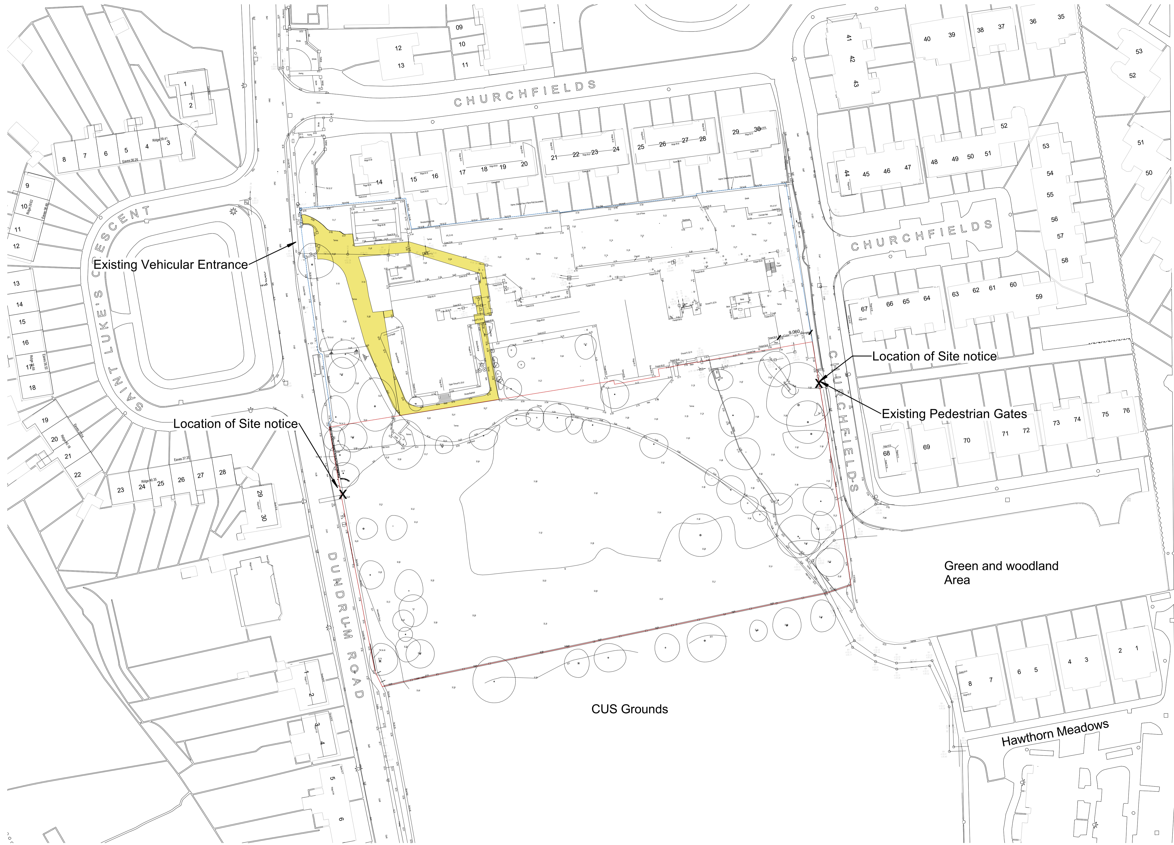
Site Location Map 1 : 500

Notes: - Do not scale from this drawing. Use figured dimensions in all cases. - Verify dimensions on site and report any discrepancies to the Architect immediately. - This drawing is to be read in conjunction with the Architect's Specification. - © This drawing is copyright and may only be reproduced with the Architect's permission.