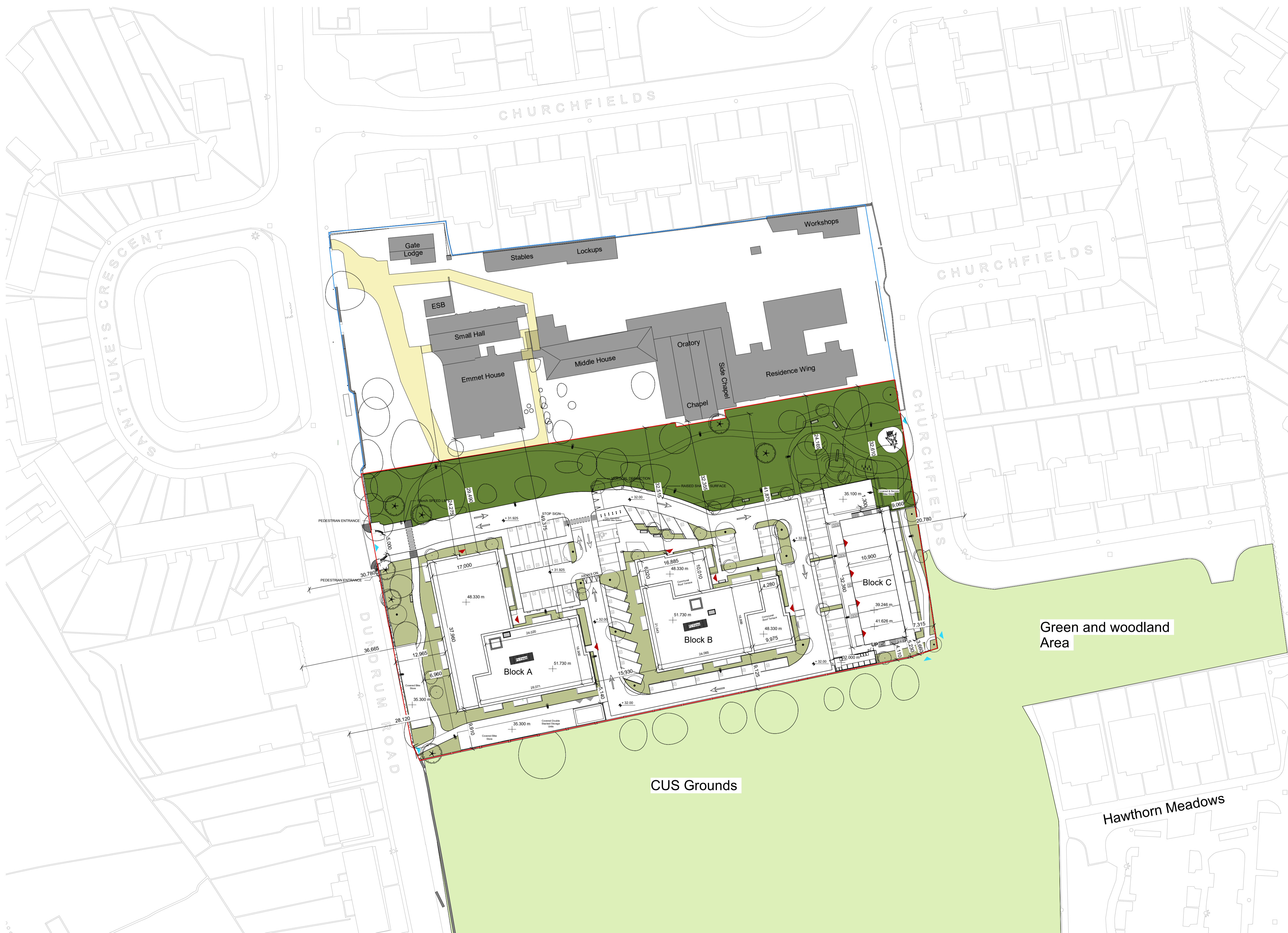
Proposed Site Plan 1: 500

Notes: - Do not scale from this drawing. Use figured dimensions in all cases. - Verify dimensions on site and report any discrepancies to the Architect immediately. - This drawing is to be read in conjunction with the Architect's Specification. - © This drawing is copyright and may only be reproduced with the Architect's permission.