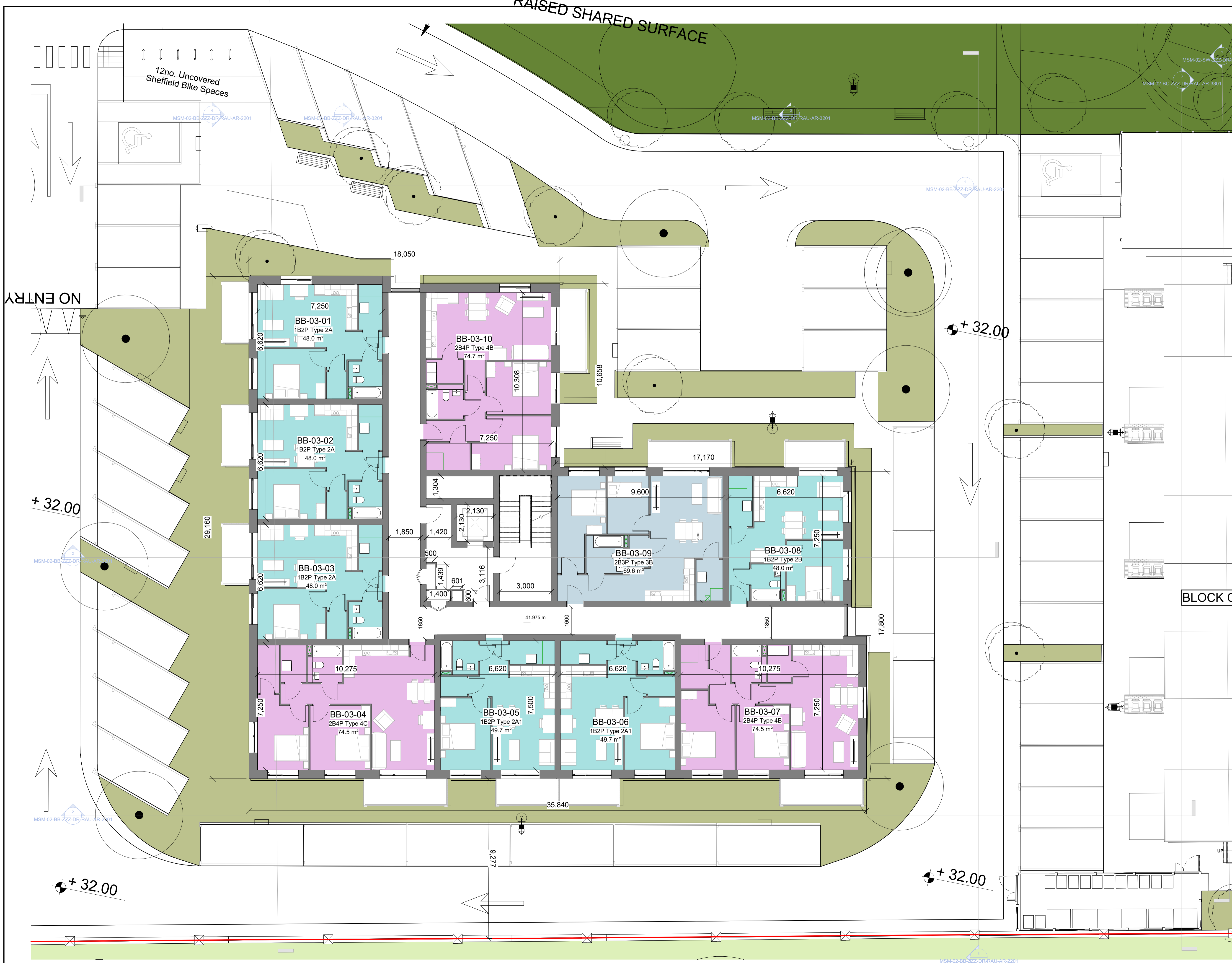
L03_Block B Third Floor Plan 1 : 100

Notes: - Do not scale from this drawing. Use figured dimensions in all cases. - Verify dimensions on site and report any discrepancies to the Architect immediately. - This drawing is to be read in conjunction with the Architect's Specification. - © This drawing is copyright and may only be reproduced with the Architect's permission.