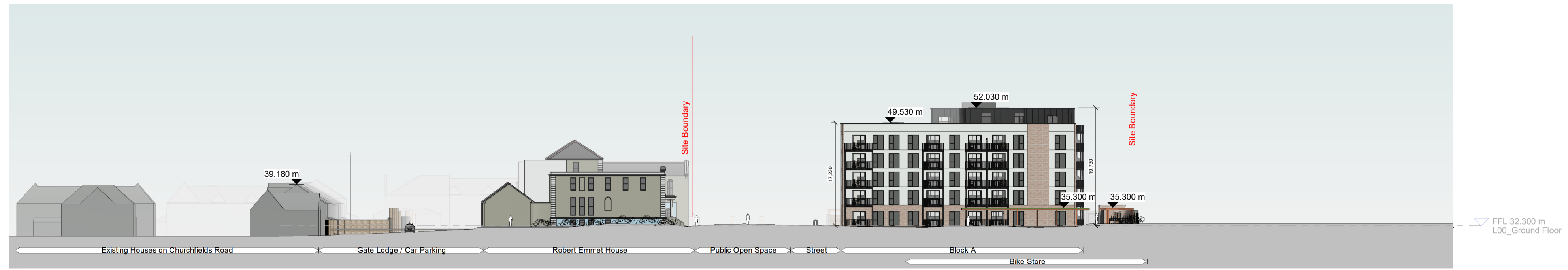
Contextual Elevation A 1 : 500