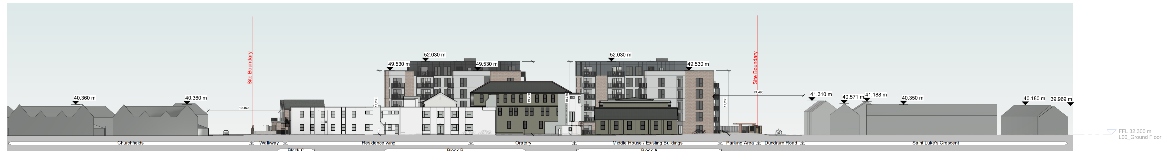
Contextual Elevation B 1 : 500