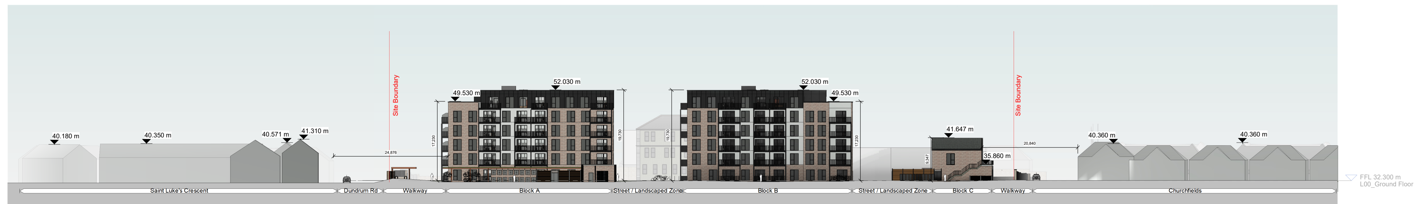
Contextual Elevation D 1 : 500

Notes: - Do not scale from this drawing. Use figured dimensions in all cases. - Verify dimensions on site and report any discrepancies to the Architect immediately. - This drawing is to be read in conjunction with the Architect's Specification. - © This drawing is copyright and may only be reproduced with the Architect's permission.