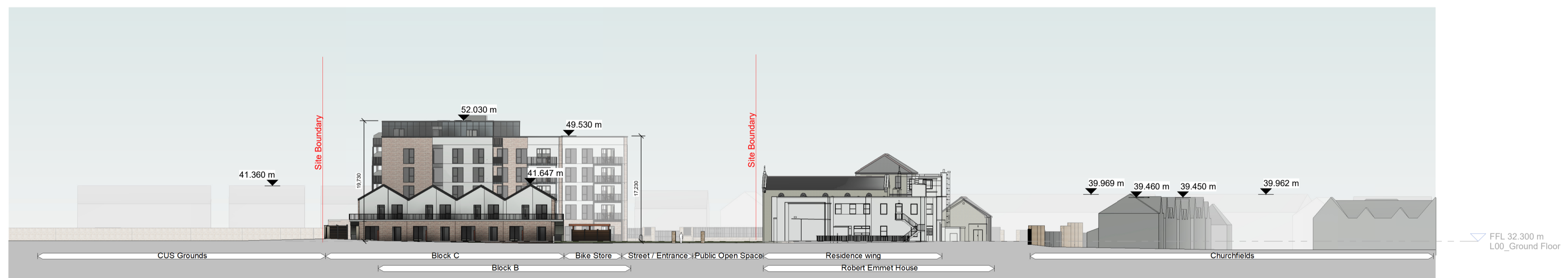
Contextual Elevation C 1 : 500