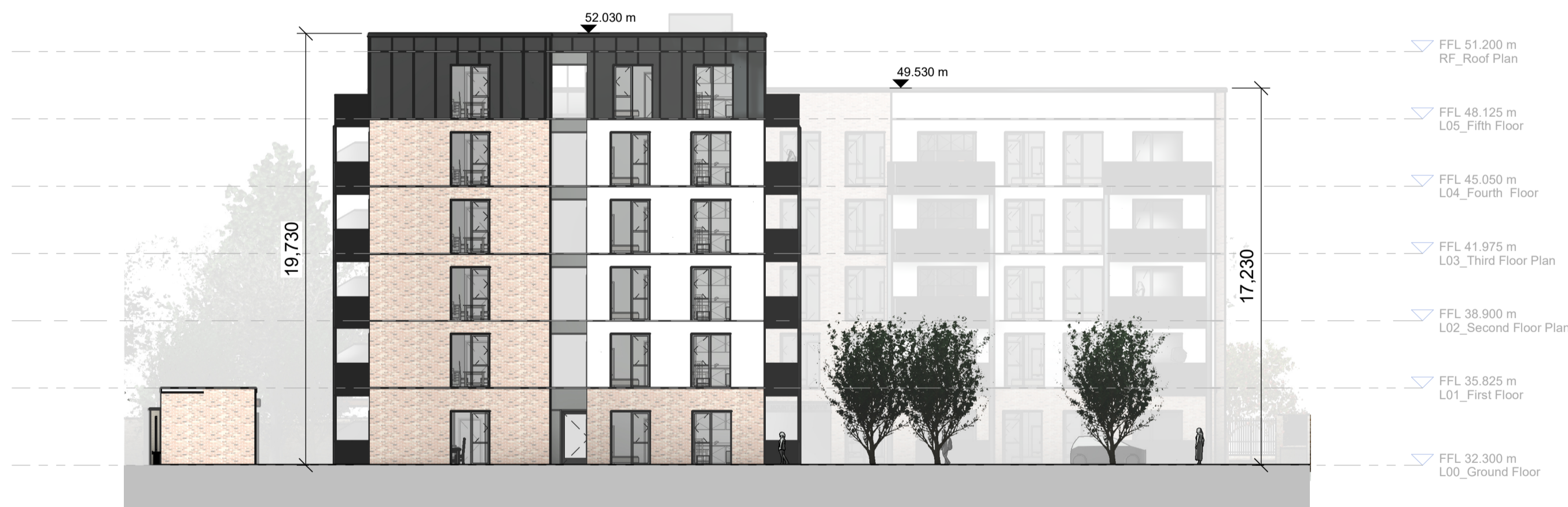
Block A, East Elevation 1 : 200