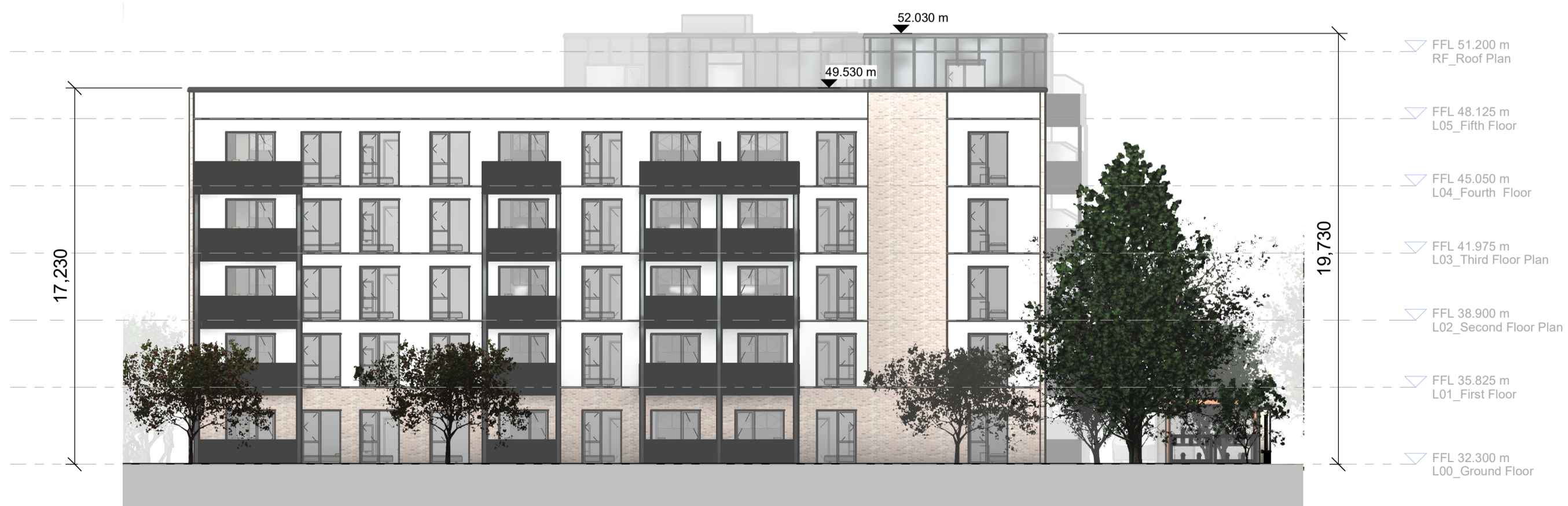
Block A, West Elevation 1 : 200

Notes: - Do not scale from this drawing. Use figured dimensions in all cases. - Verify dimensions on site and report any discrepancies to the Architect immediately. - This drawing is to be read in conjunction with the Architect's Specification. - © This drawing is copyright and may only be reproduced with the Architect's permission.