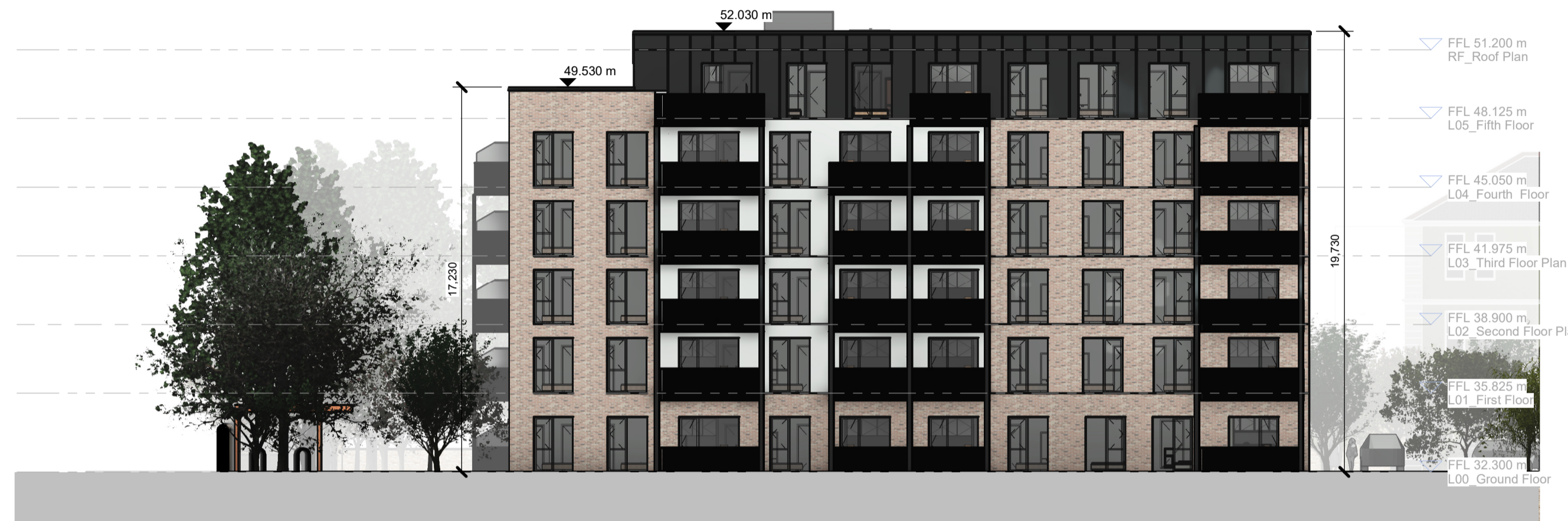
Block A, South Elevation 1 : 200