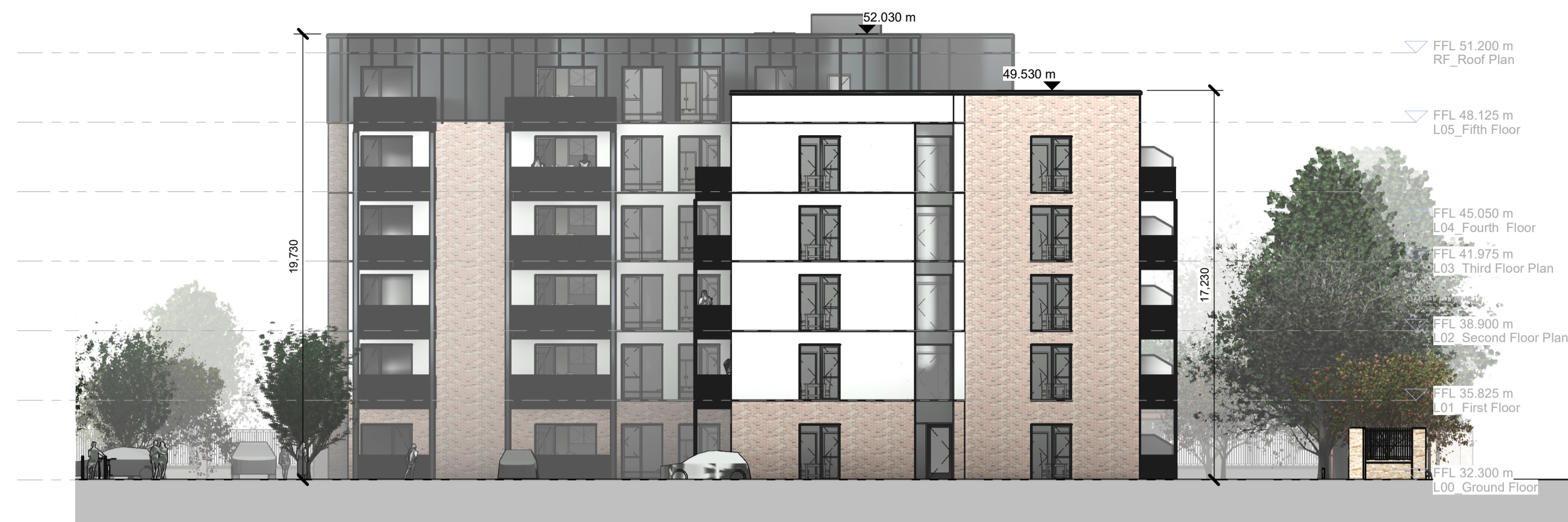
Block A, North Elevation 1 : 200