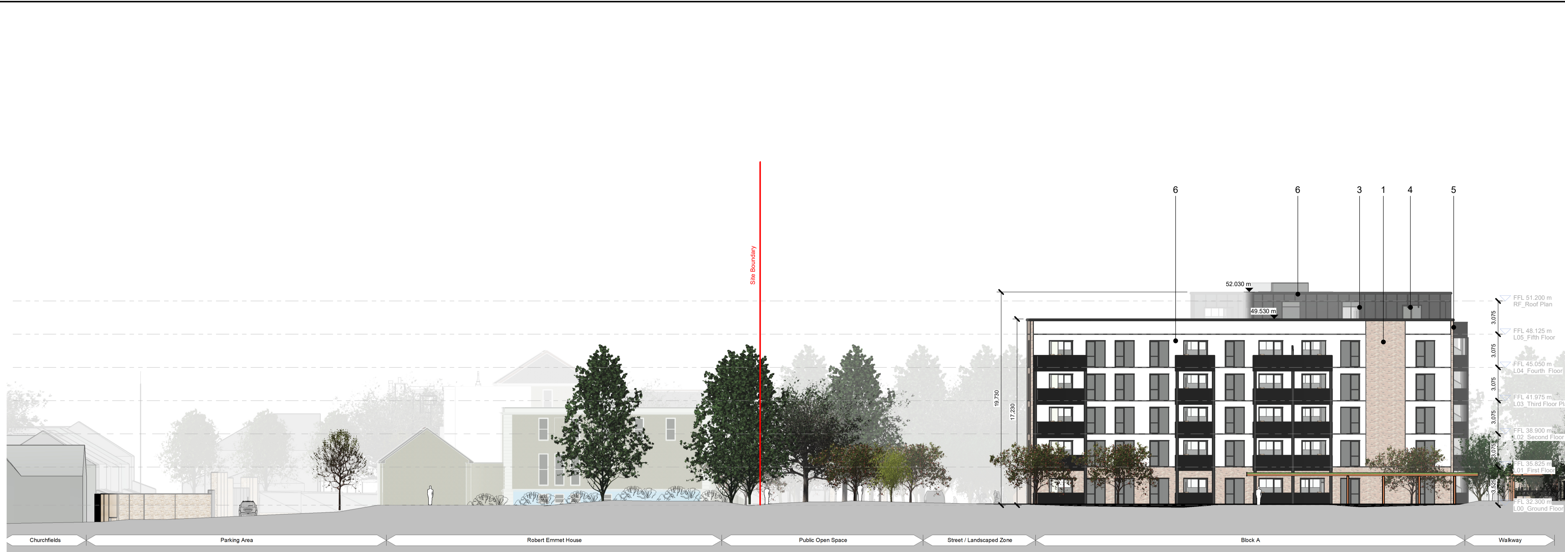
Elevation A 1 : 200