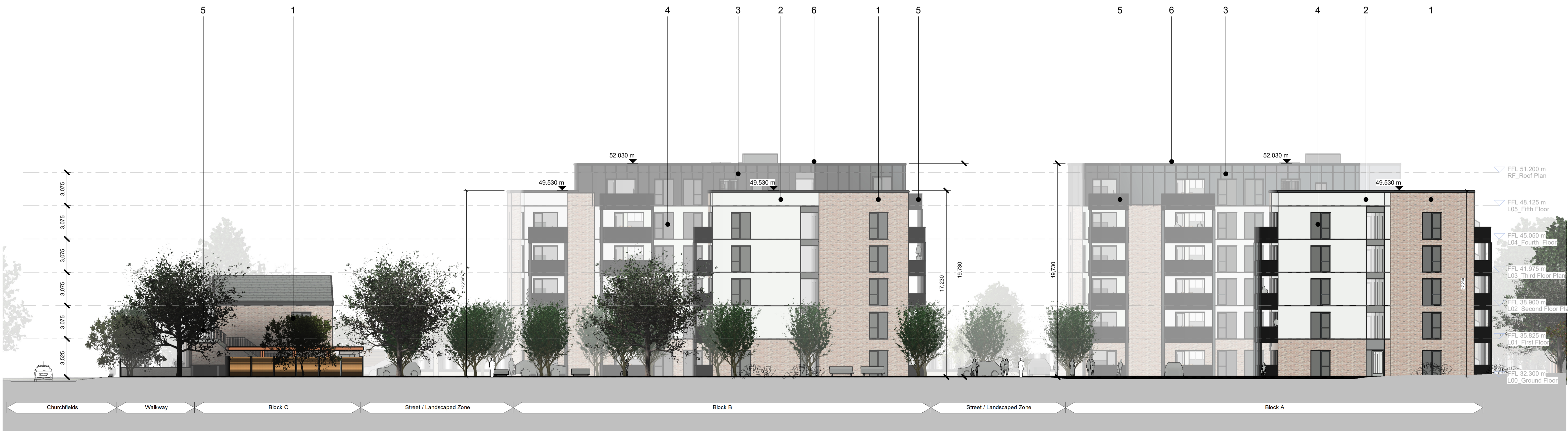
Elevation B 1 : 200

Notes: - Do not scale from this drawing. Use figured dimensions in all cases. - Verify dimensions on site and report any discrepancies to the Architect immediately. - This drawing is to be read in conjunction with the Architect's Specification. - © This drawing is copyright and may only be reproduced with the Architect's permission.