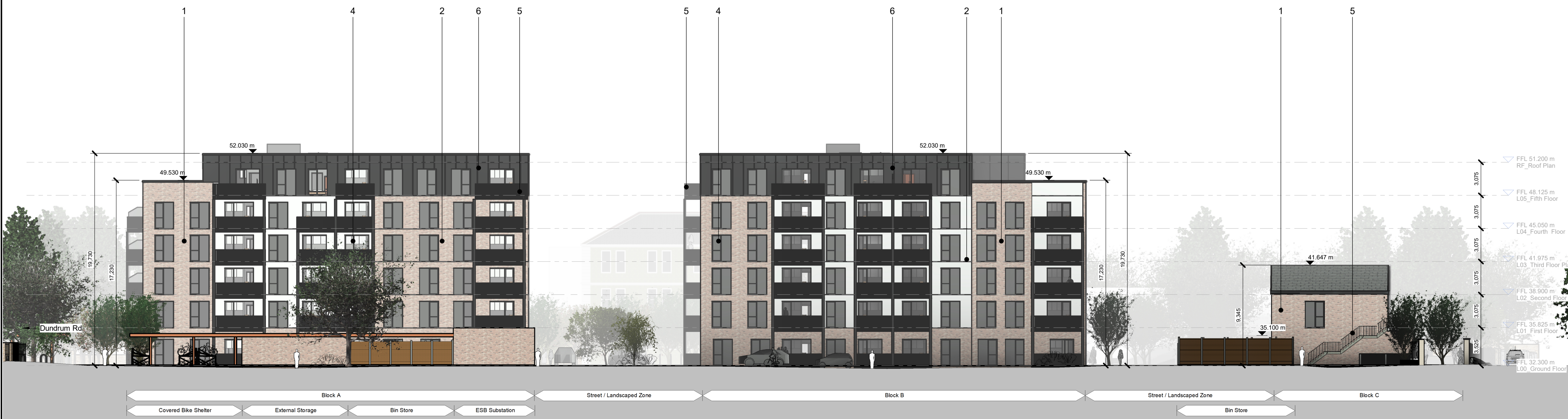
Elevation D 1 : 200

Notes: - Do not scale from this drawing. Use figured dimensions in all cases. - Verify dimensions on site and report any discrepancies to the Architect immediately. - This drawing is to be read in conjunction with the Architect's Specification. - © This drawing is copyright and may only be reproduced with the Architect's permission.