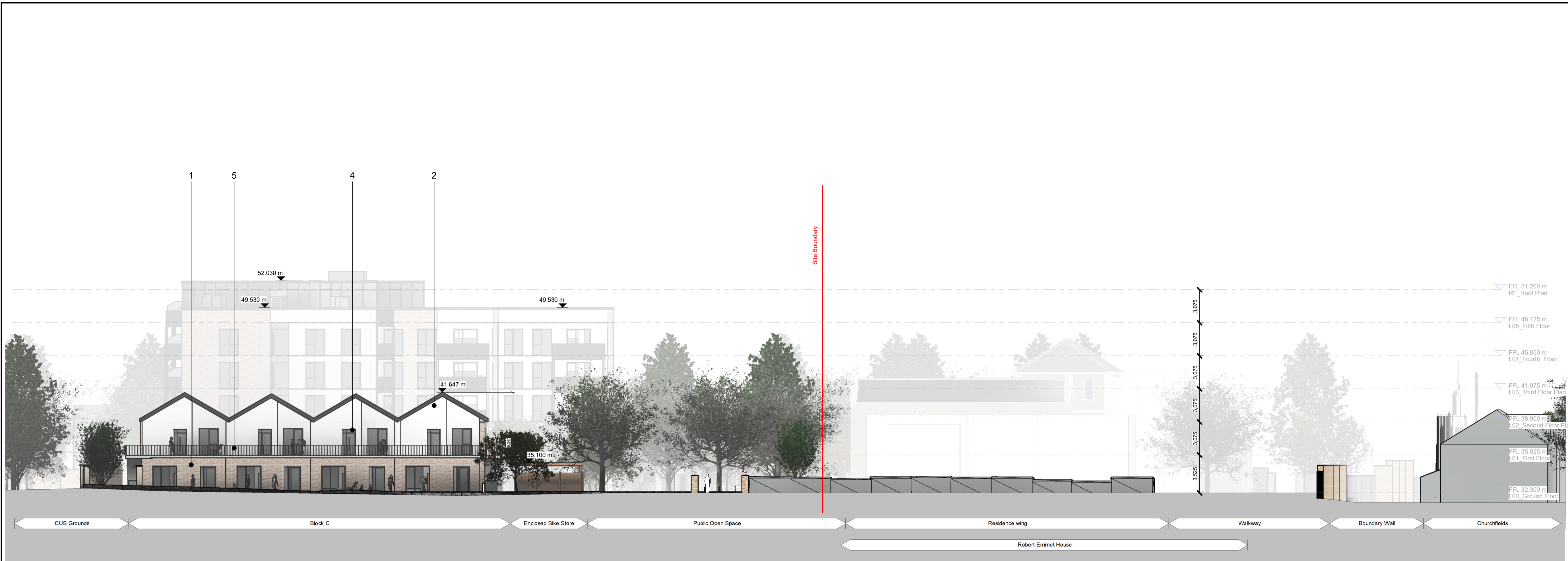
Elevation C 1 : 200