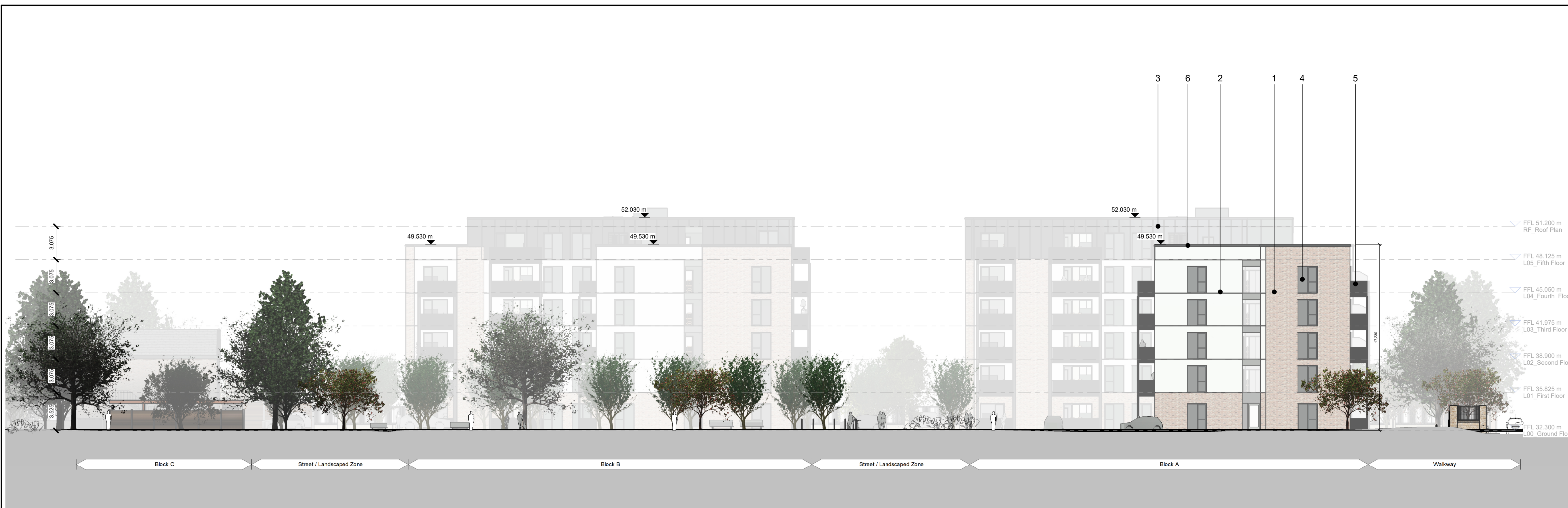
Elevation E 1 : 200