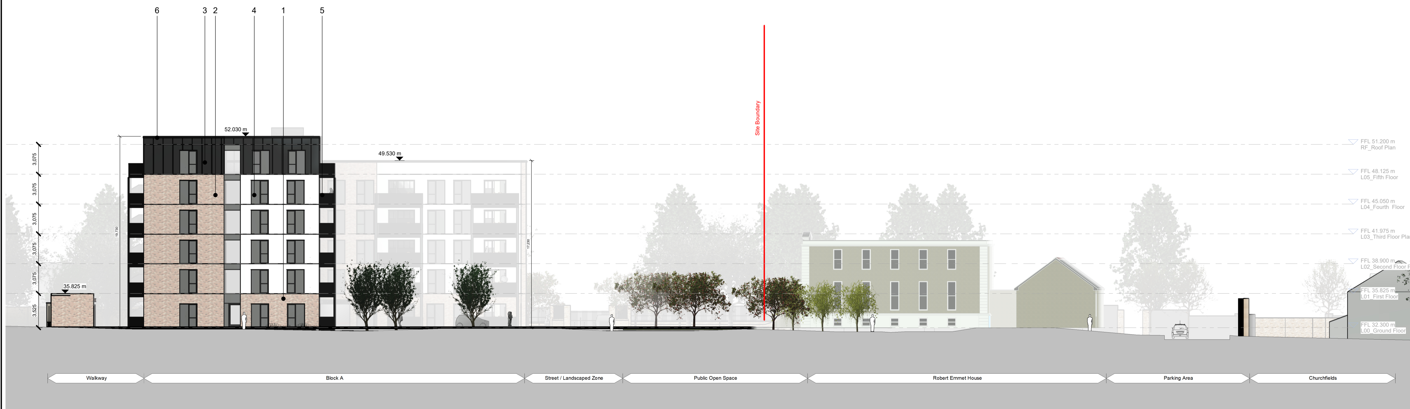
Elevation F 1 : 200

Notes: - Do not scale from this drawing. Use figured dimensions in all cases. - Verify dimensions on site and report any discrepancies to the Architect immediately. - This drawing is to be read in conjunction with the Architect's Specification. - © This drawing is copyright and may only be reproduced with the Architect's permission.