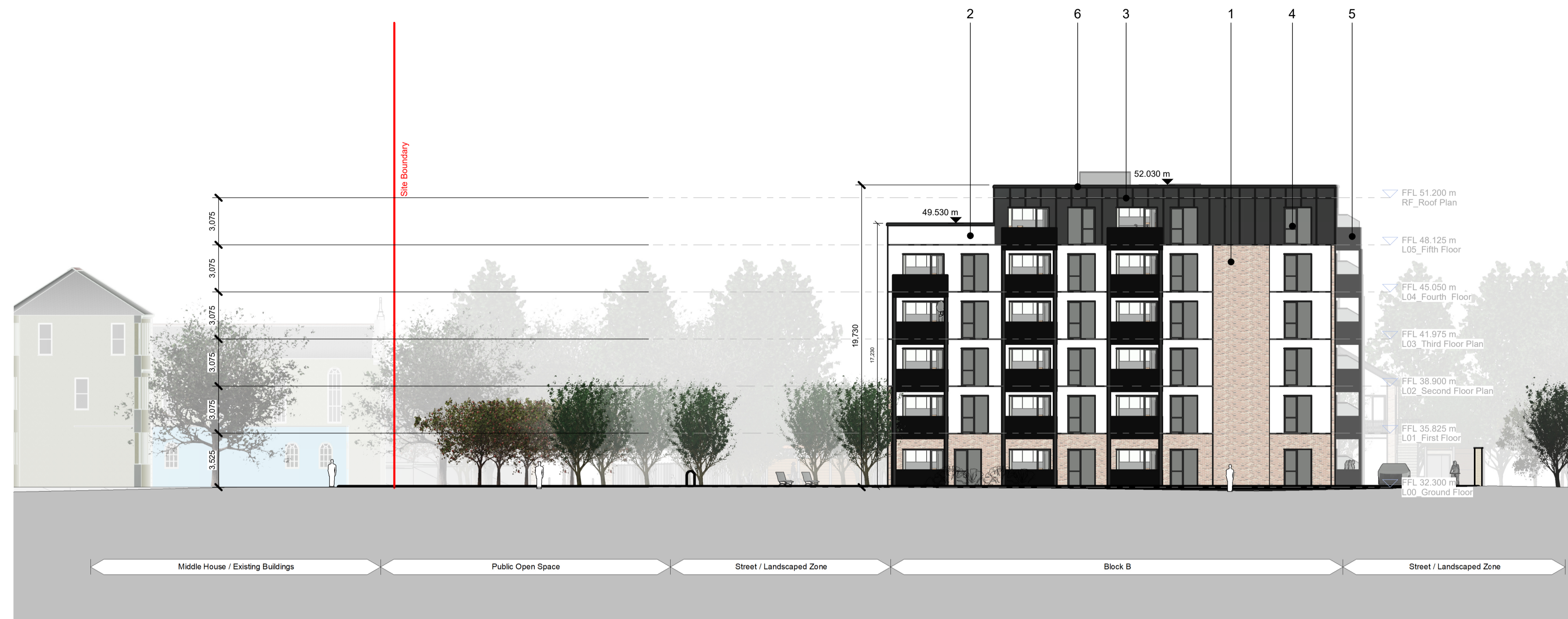
Elevation G 1 : 200