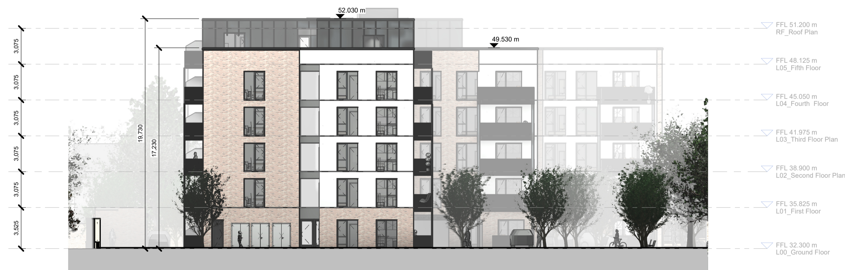
Block B, East Elevation 1 : 200