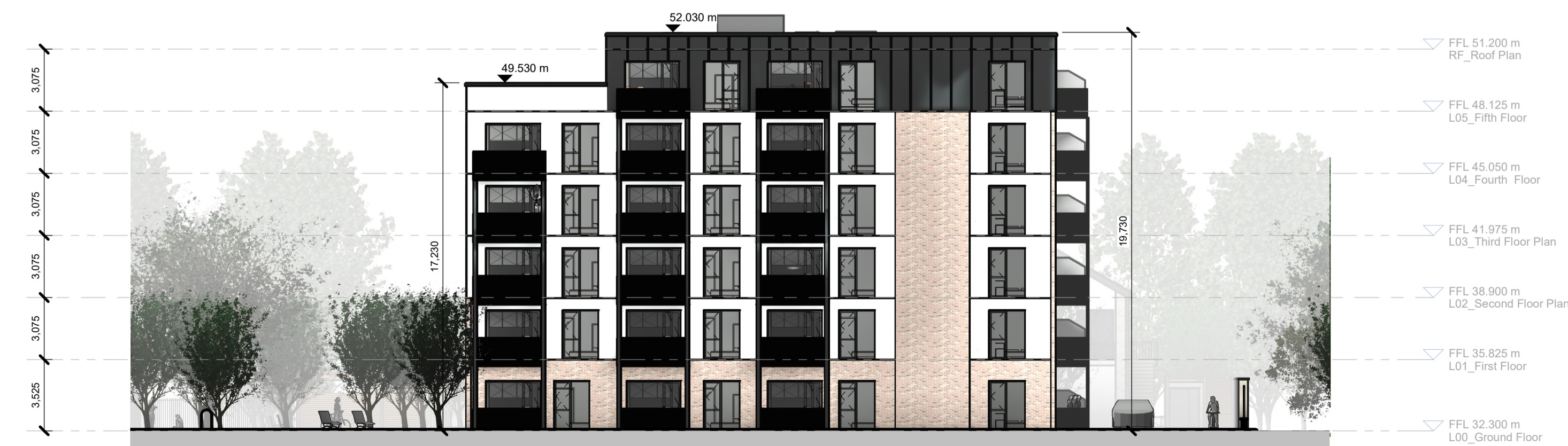
Block B, West Elevation 1 : 200

Notes: - Do not scale from this drawing. Use figured dimensions in all cases. - Verify dimensions on site and report any discrepancies to the Architect immediately. - This drawing is to be read in conjunction with the Architect's Specification. - © This drawing is copyright and may only be reproduced with the Architect's permission.