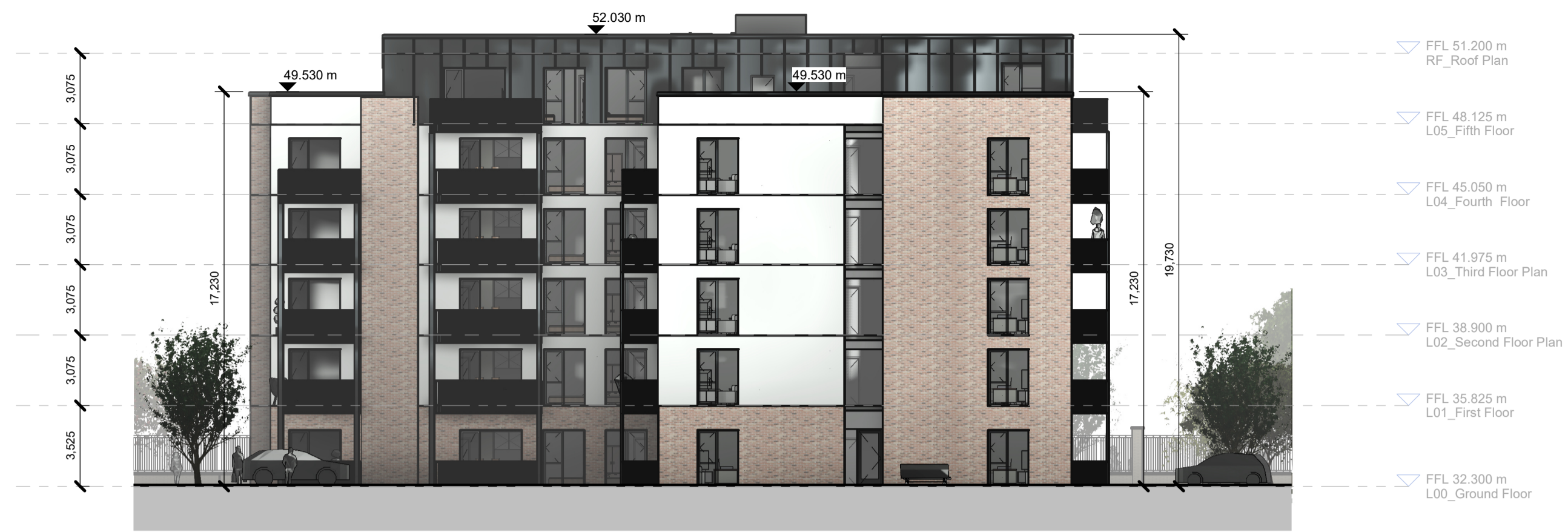
Block B, North Elevation 1 : 200