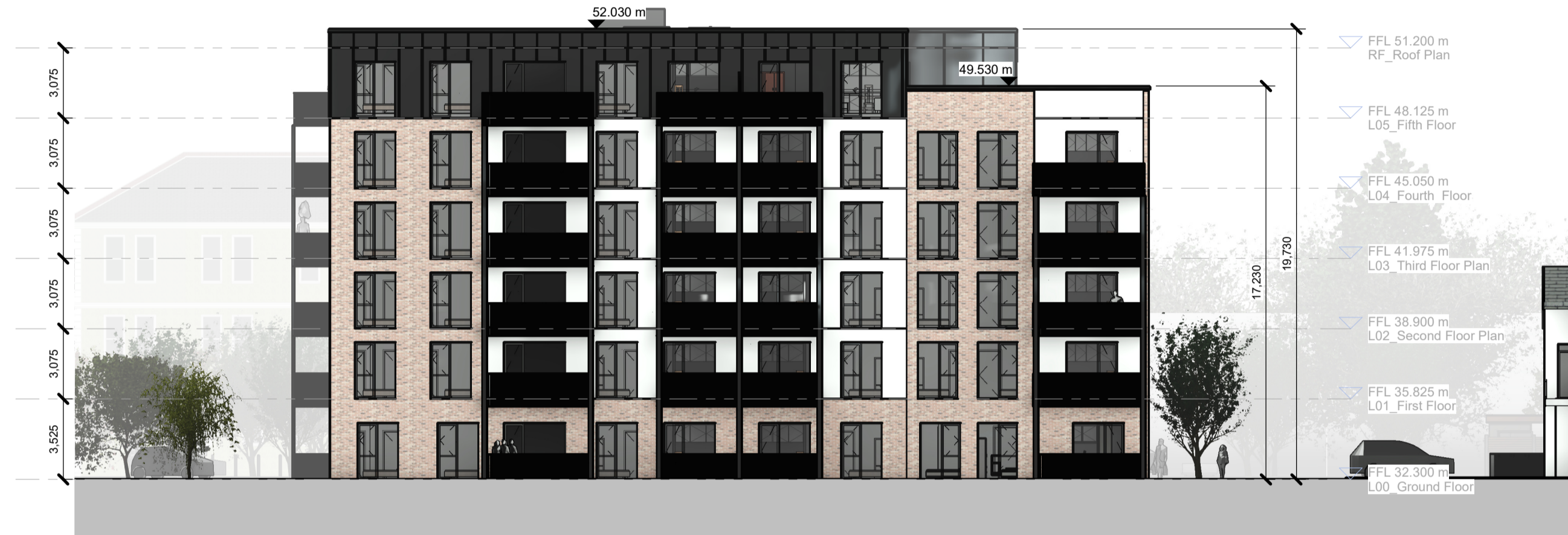
Block B, South Elevation 1 : 200