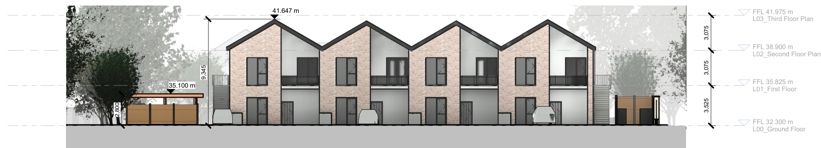
Block C, West Elevation 1 : 200

Notes: - Do not scale from this drawing. Use figured dimensions in all cases. - Verify dimensions on site and report any discrepancies to the Architect immediately. - This drawing is to be read in conjunction with the Architect's Specification. - © This drawing is copyright and may only be reproduced with the Architect's permission.