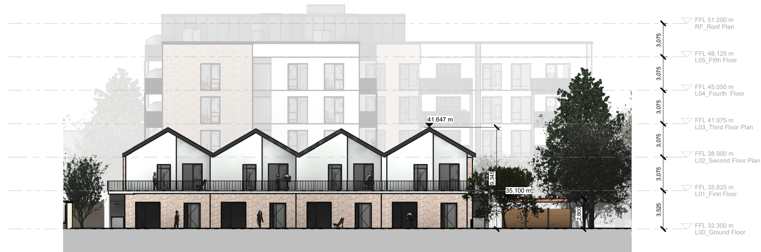
Block C, East Elevation 1 : 200