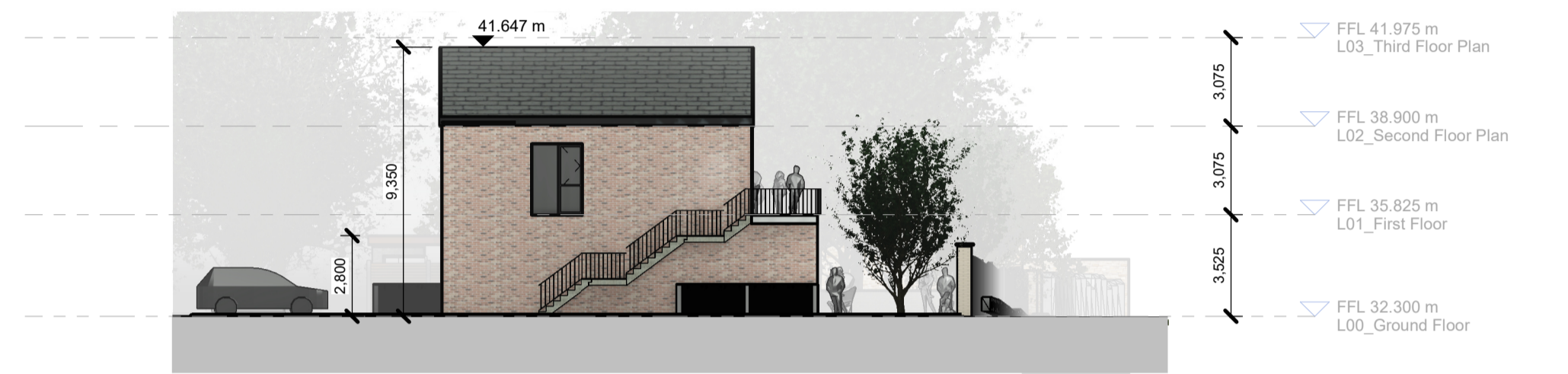
Block C, South Elevation 1 : 200