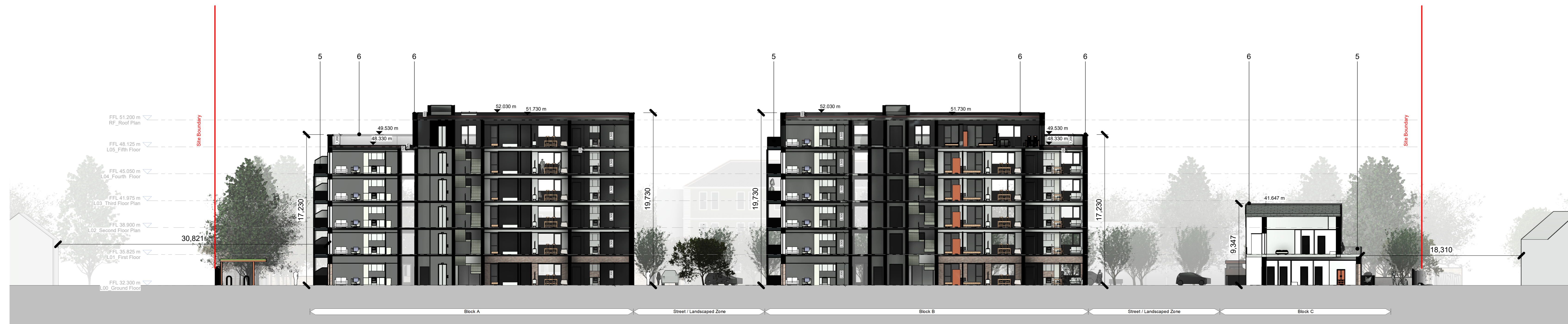
Site Section A 1: 200

Notes: Do not scale from this drawing. Use figured dimensions in all cases. Verify dimensions on site and report any discrepancies to the Architect immediately. This drawing to be read in conjunction with the Architect's Specifications. © This drawing is copyright and may only be reproduced with the Architect's permission. Drawing Notes: