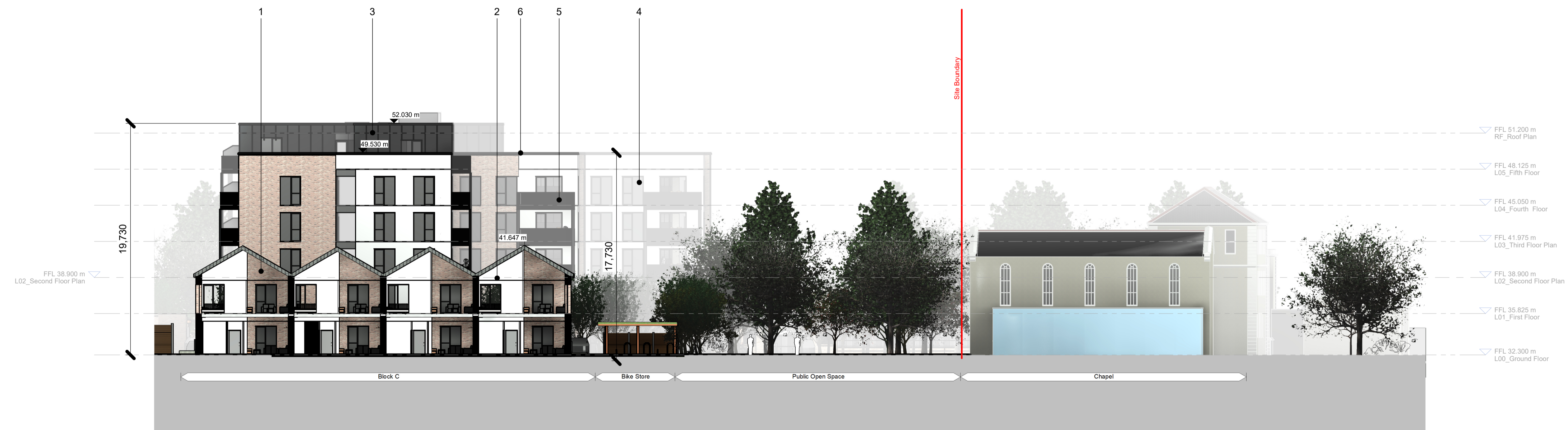
Site Section D 1 : 200

Notes: - Do not scale from this drawing. Use figured dimensions in all cases. - Verify dimensions on site and report any discrepancies to the Architect immediately. - This drawing is to be read in conjunction with the Architect's Specification. - © This drawing is copyright and may only be reproduced with the Architect's permission.