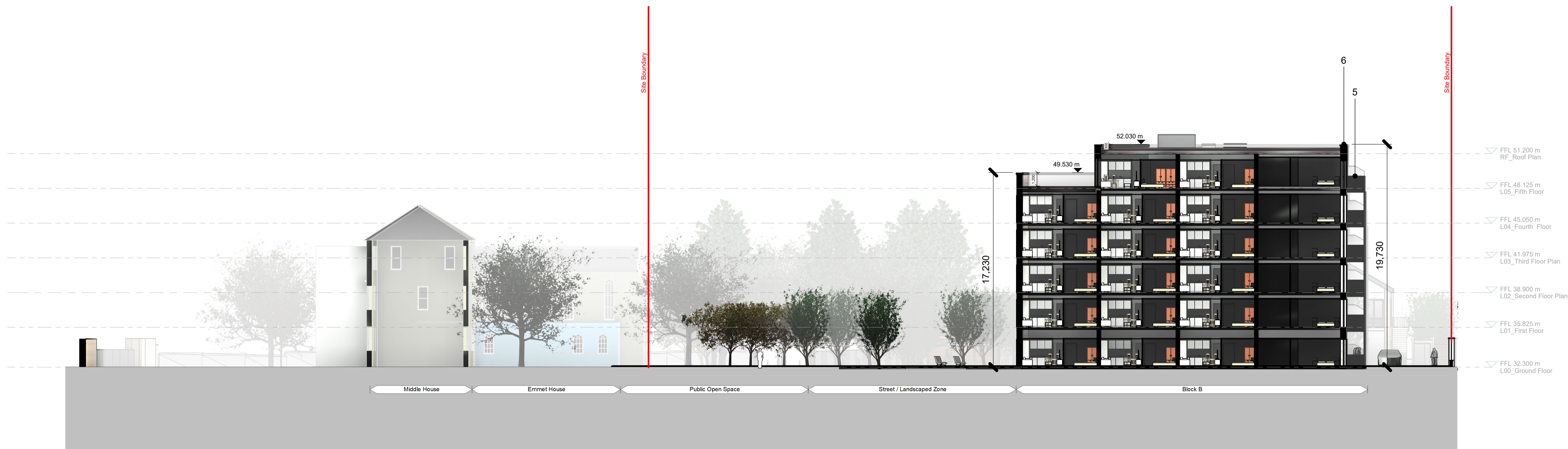
Site Section C 1 : 200