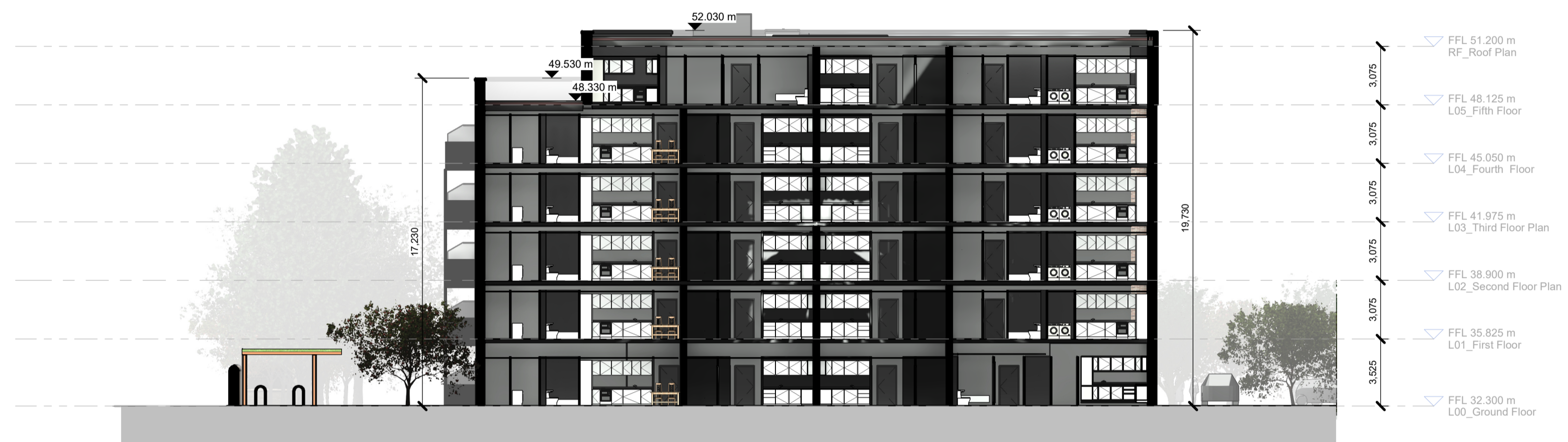
Block A, Section B-B 1 : 200