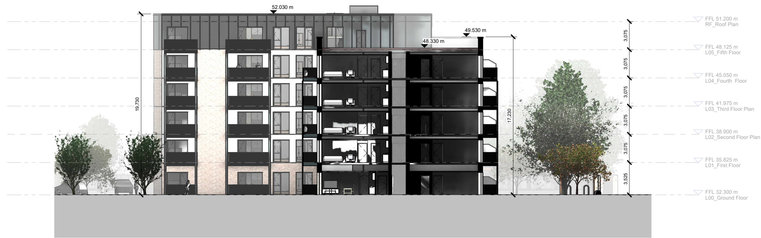
Block A, Section C-C 1 : 200

Notes: - Do not scale from this drawing. Use figured dimensions in all cases. - Verify dimensions on site and report any discrepancies to the Architect immediately. - This drawing is to be read in conjunction with the Architect's Specification. - © This drawing is copyright and may only be reproduced with the Architect's permission.