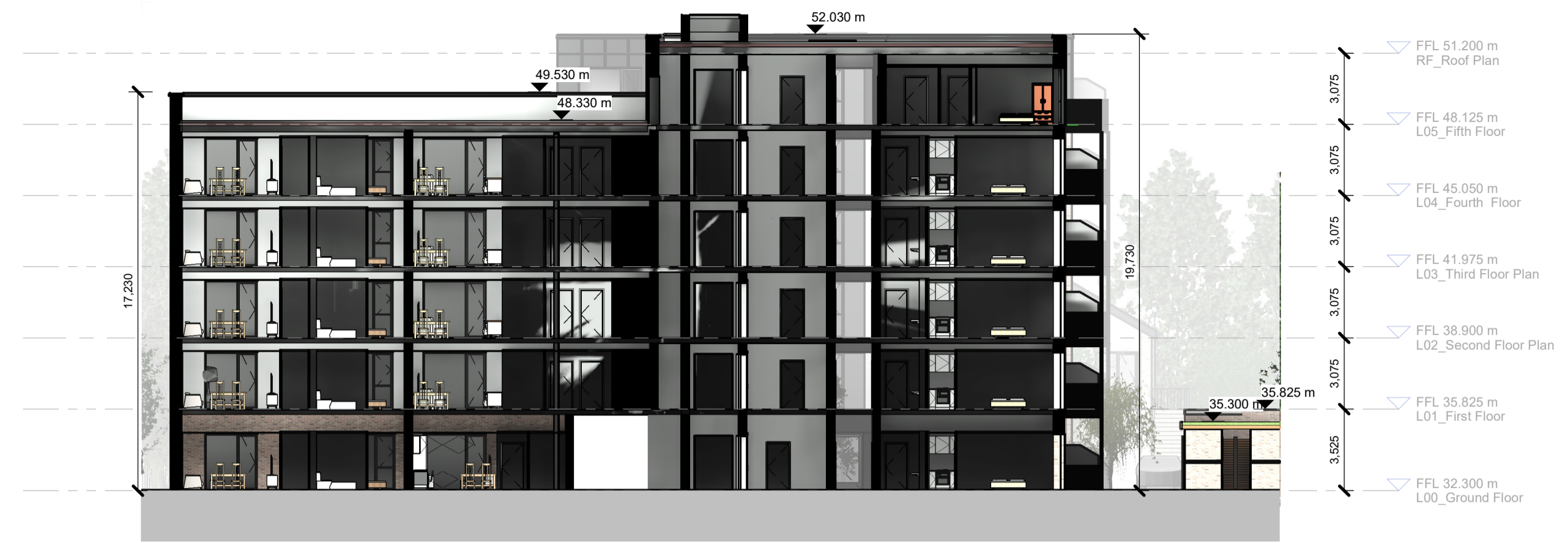
Block A, Section A-A 1 : 200