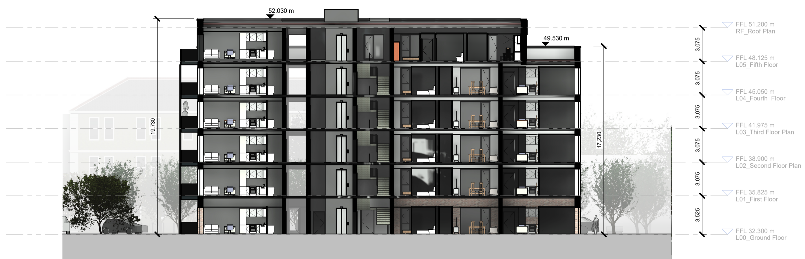
Block B, Section B-B 1 : 200