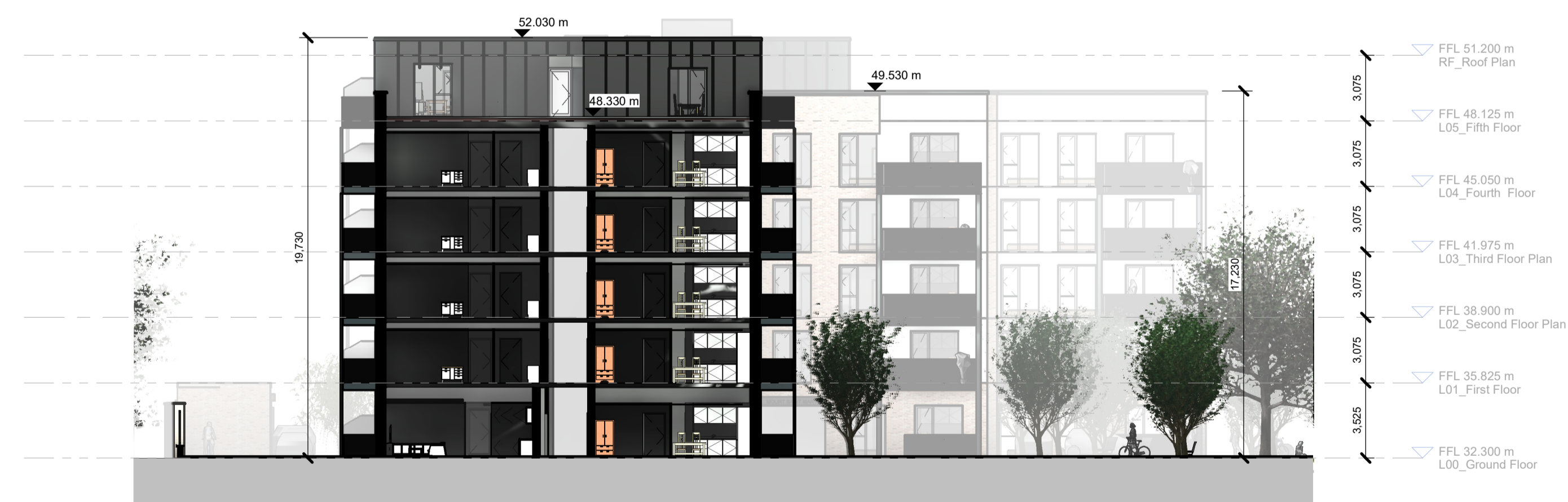
Block B, Section C-C 1 : 200

Notes: - Do not scale from this drawing. Use figured dimensions in all cases. - Verify dimensions on site and report any discrepancies to the Architect immediately. - This drawing to be read in conjunction with the Architect's Specification. - © This drawing is copyright and may only be reproduced with the Architect's permission.