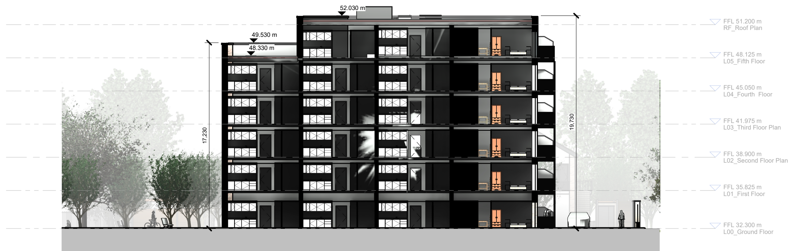
Block B, Section A-A 1 : 200