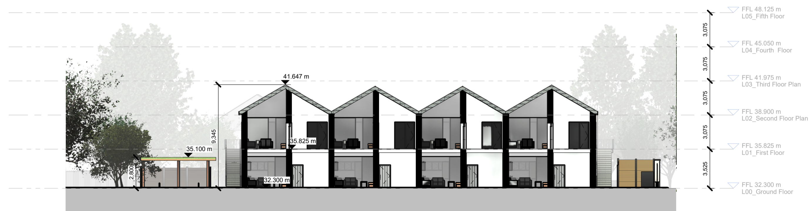
Block C, Section C-C 1 : 200

Notes: - Do not scale from this drawing. Use figured dimensions in all cases. - Verify dimensions on site and report any discrepancies to the Architect immediately. - This drawing is to be read in conjunction with the Architect's Specification. - © This drawing is copyright and may only be reproduced with the Architect's permission.