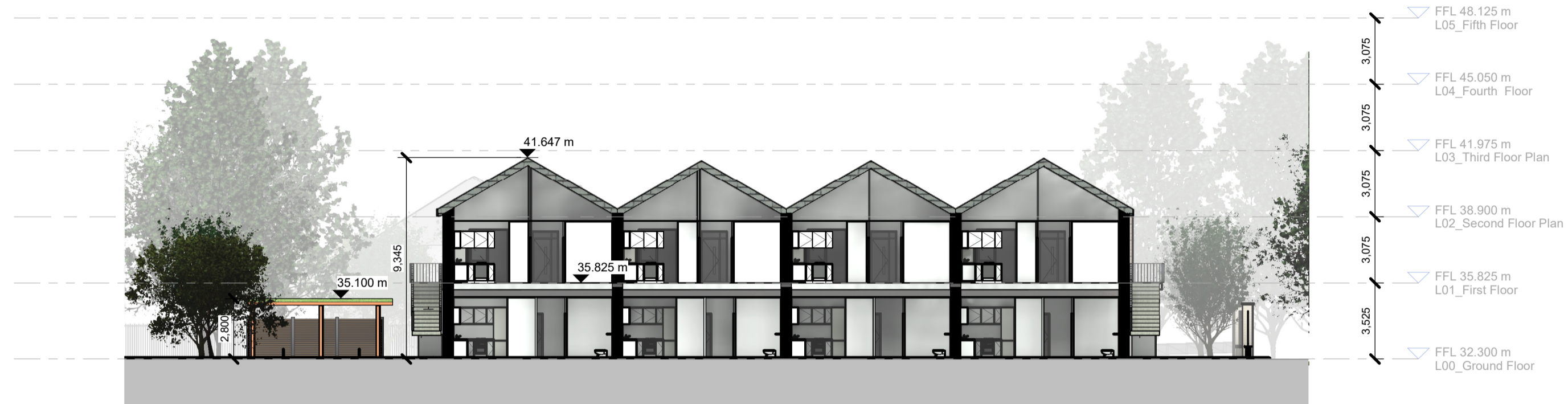
Block C, Section A-A 1 : 200