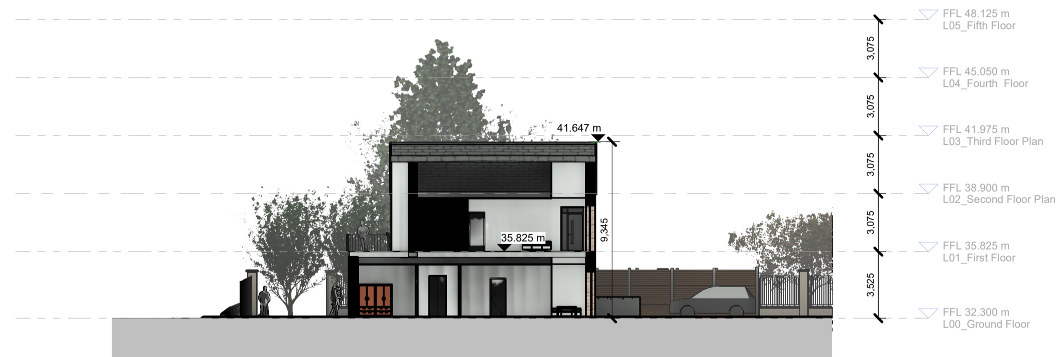
Block C, Section B-B 1 : 200