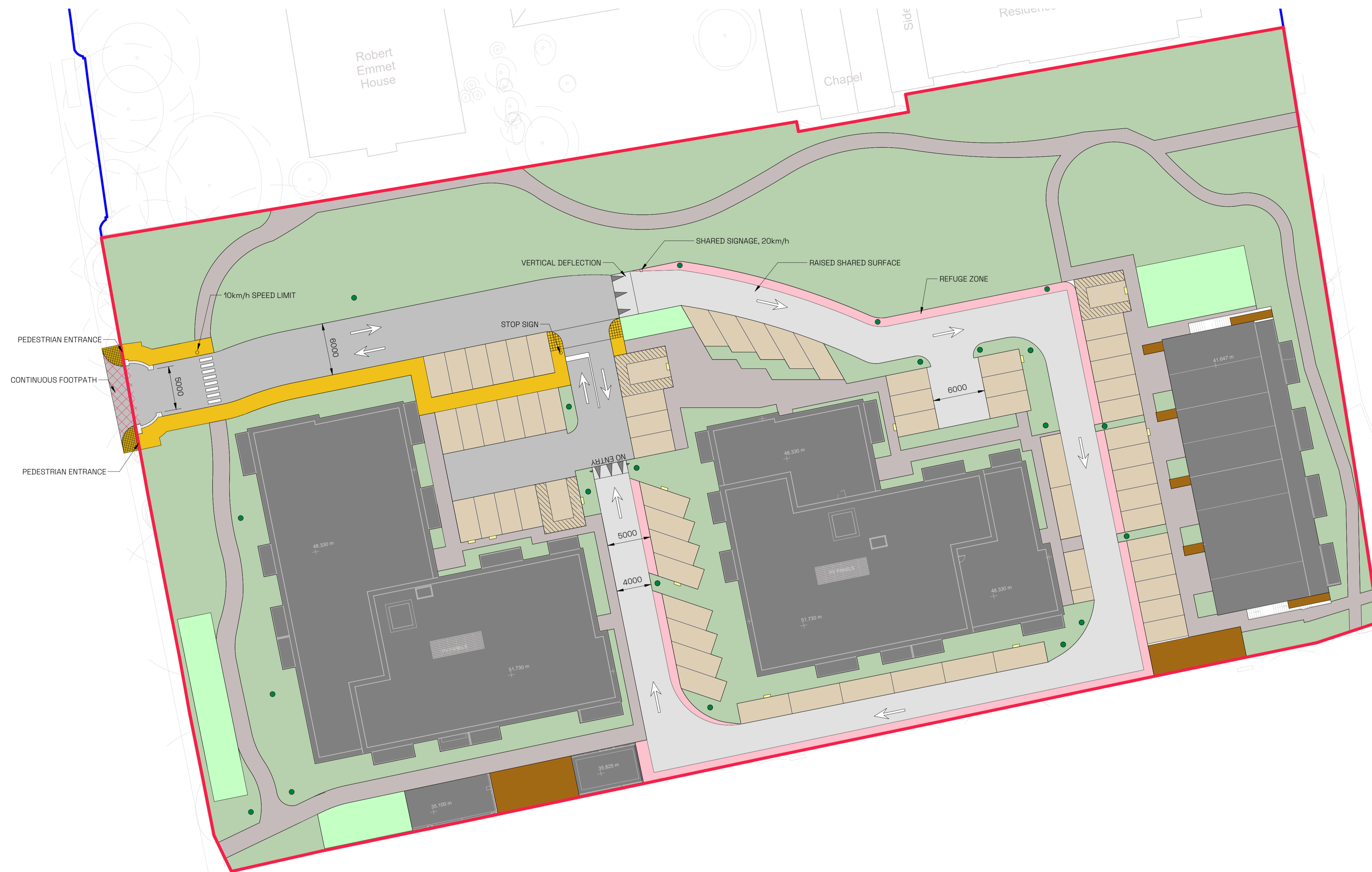
DMURS LAYOUT 1: 250