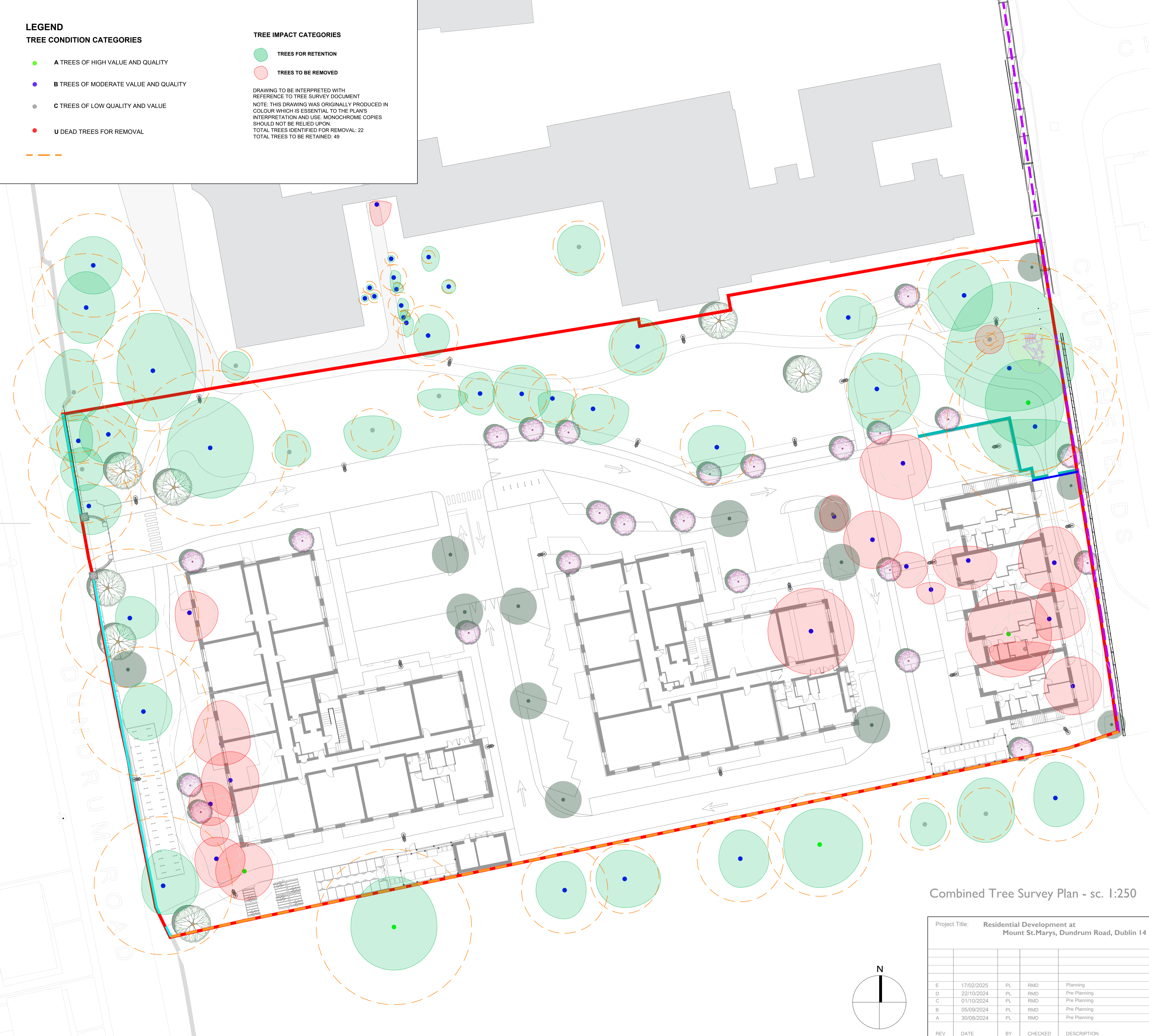
Combined Tree Survey Plan - sc. 1:250

DRAWING TO BE INTERPRETED WITH REFERENCE TO TREE SURVEY DOCUMENT NOTE: THIS DRAWING WAS ORIGINALLY PRODUCED IN COLOUR WHICH IS ESSENTIAL TO THE PLANS INTERPRETATION AND USE. MONOCHROME COPIES SHOULD NOT BE RELIED UPON. TOTAL TREES IDENTIFIED FOR REMOVAL: 22 TOTAL TREES TO BE RETAINED: 49