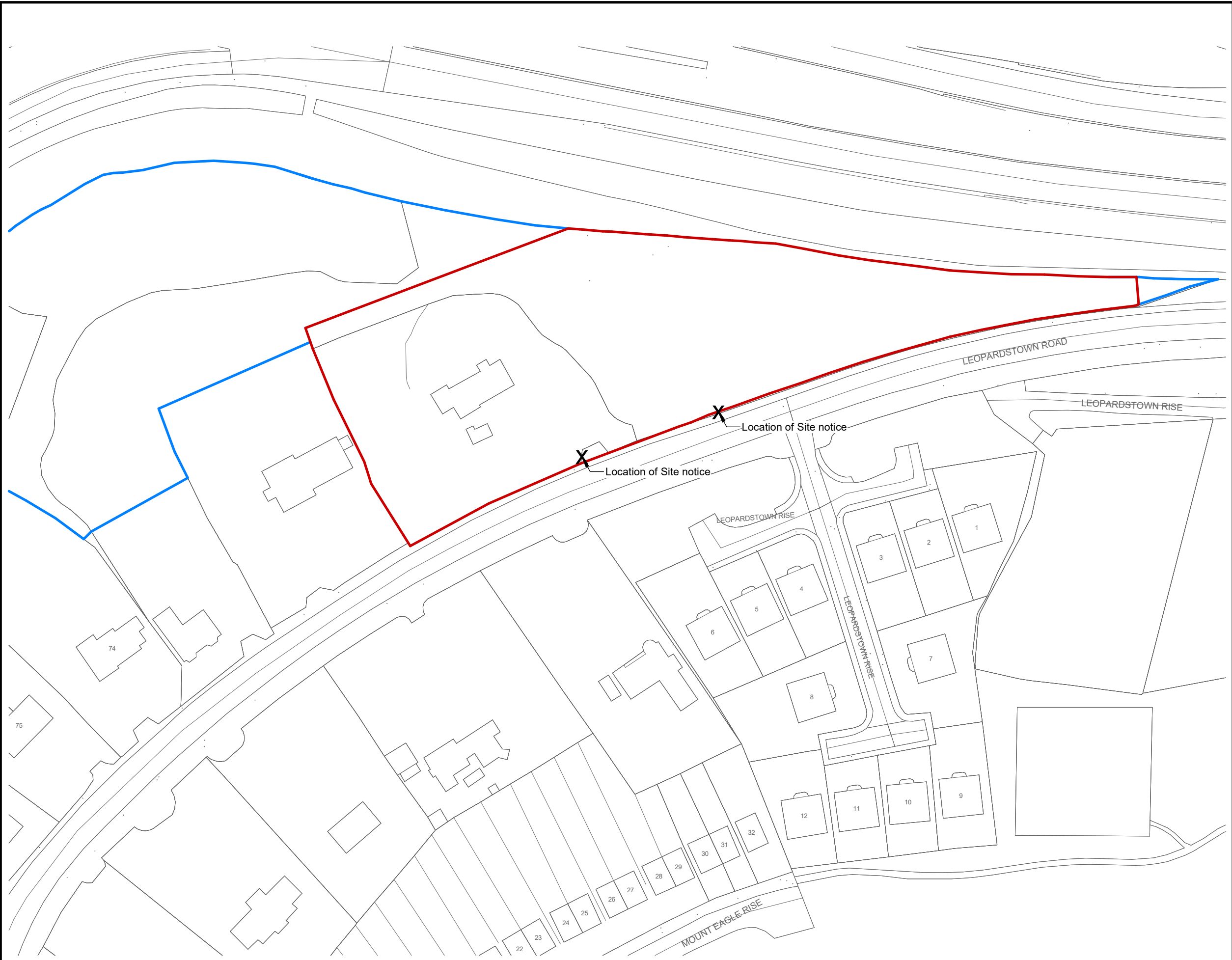
Site Location Map 1 : 1000

Notes: - Do not scale from this drawing. Use figured dimensions in all cases. - Verify dimensions on site and report any discrepancies to the Architect immediately. - This drawing to be read in conjunction with the Architect's Specification. - © This drawing is copyright and may only be reproduced with the Architect's permission.