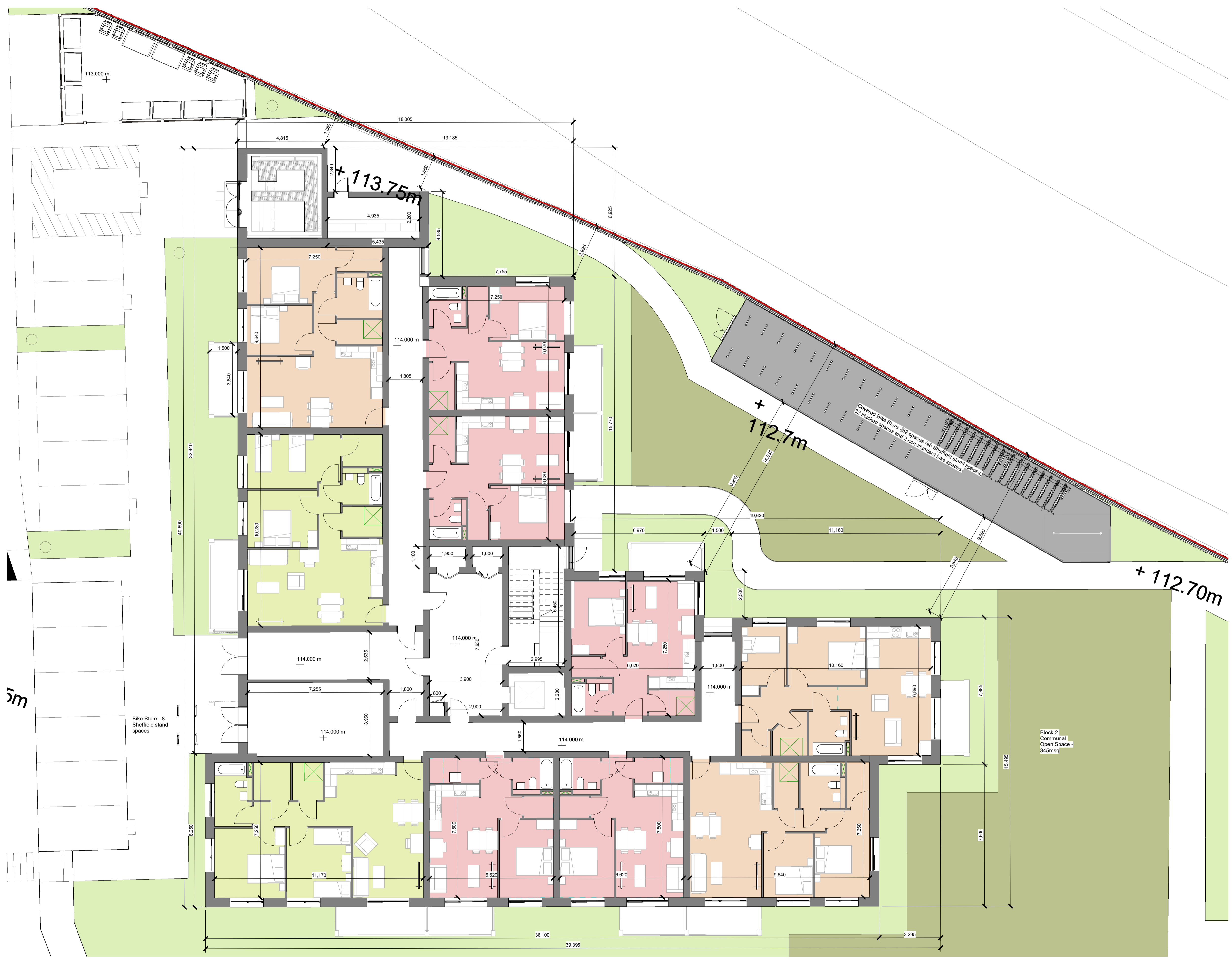
L00 - Ground Floor Apartment Block 1: 100