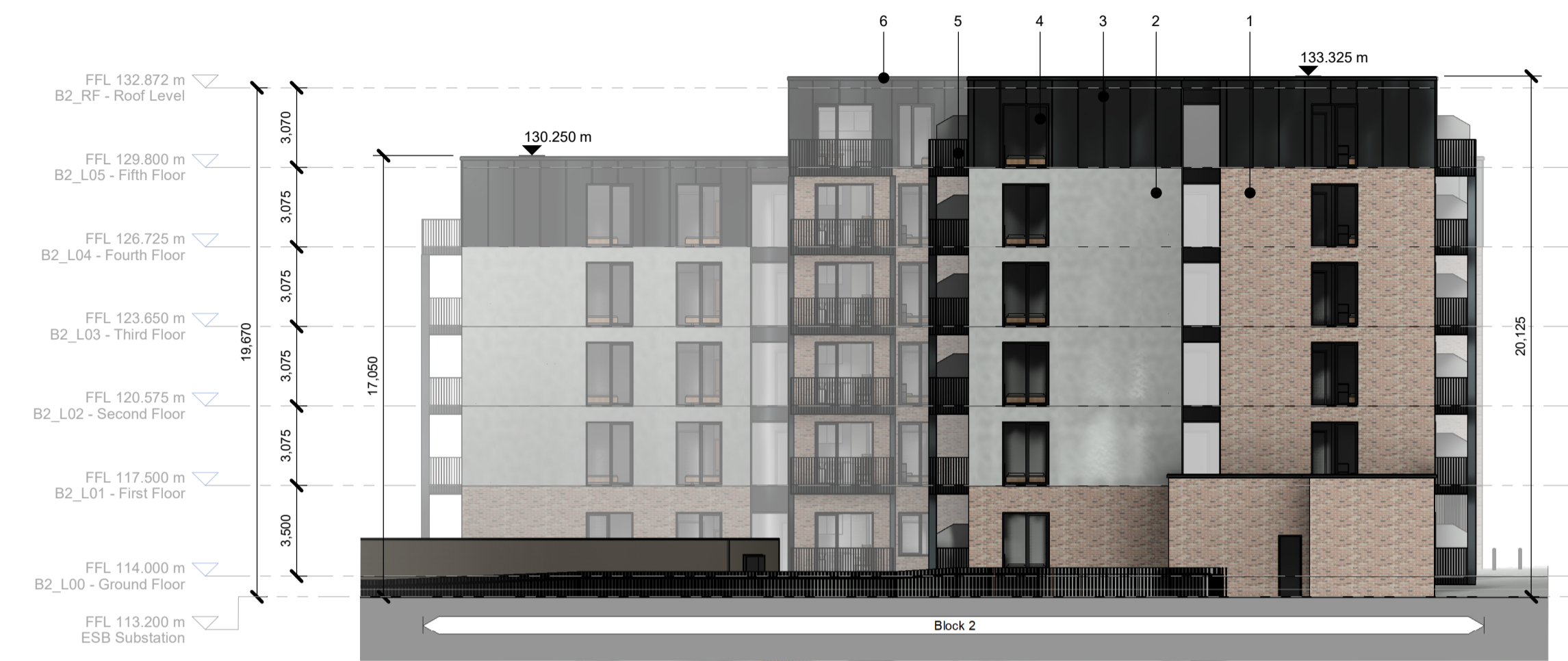
Block 2 North Elevation 1: 200