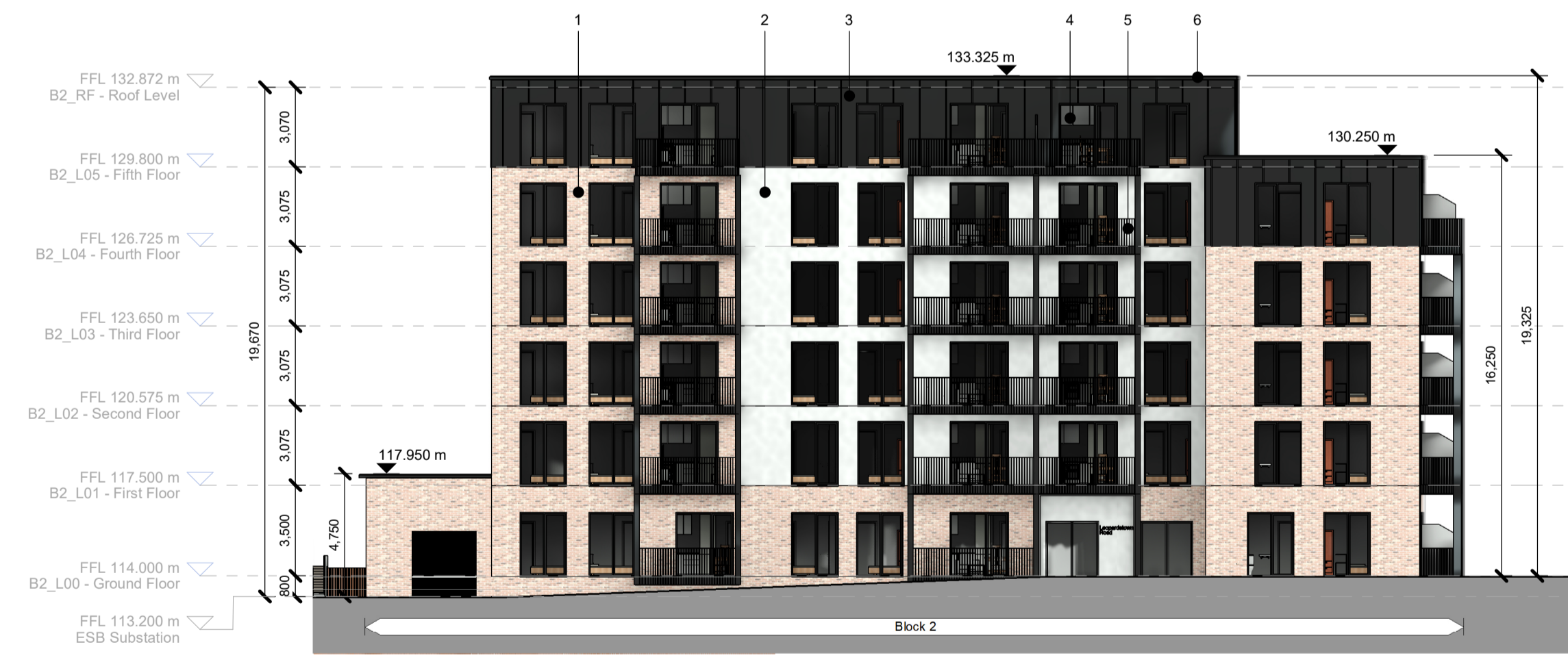
Block 2 East Elevation 1: 200