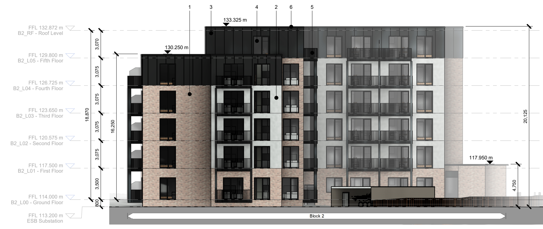
Block 2 West Elevation 1: 200