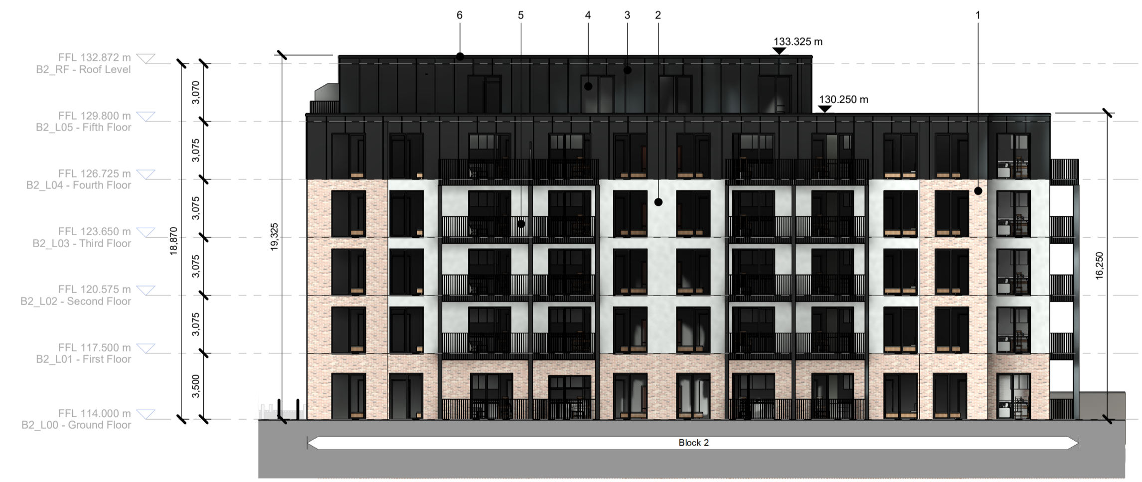
Block 2 South Elevation 1: 200