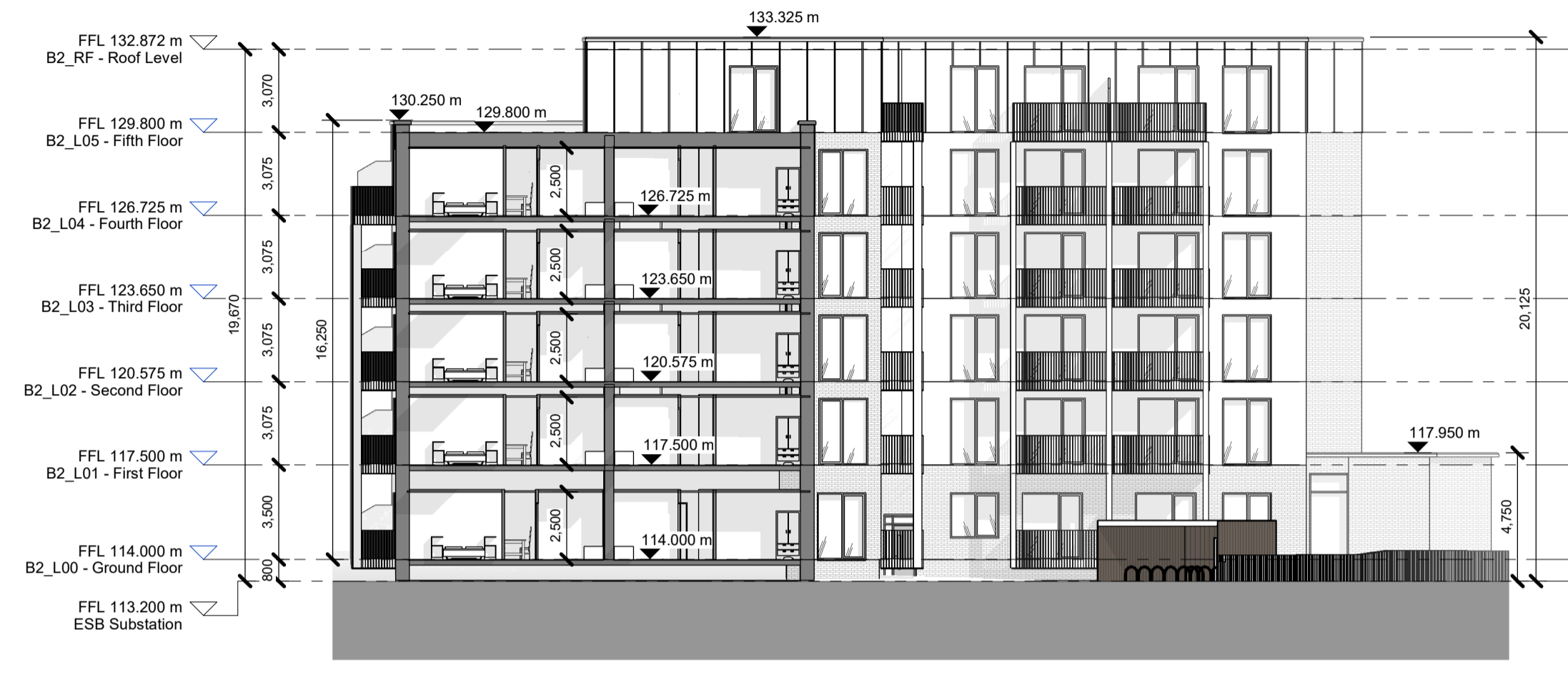
Block 2 Section 2 1 : 200