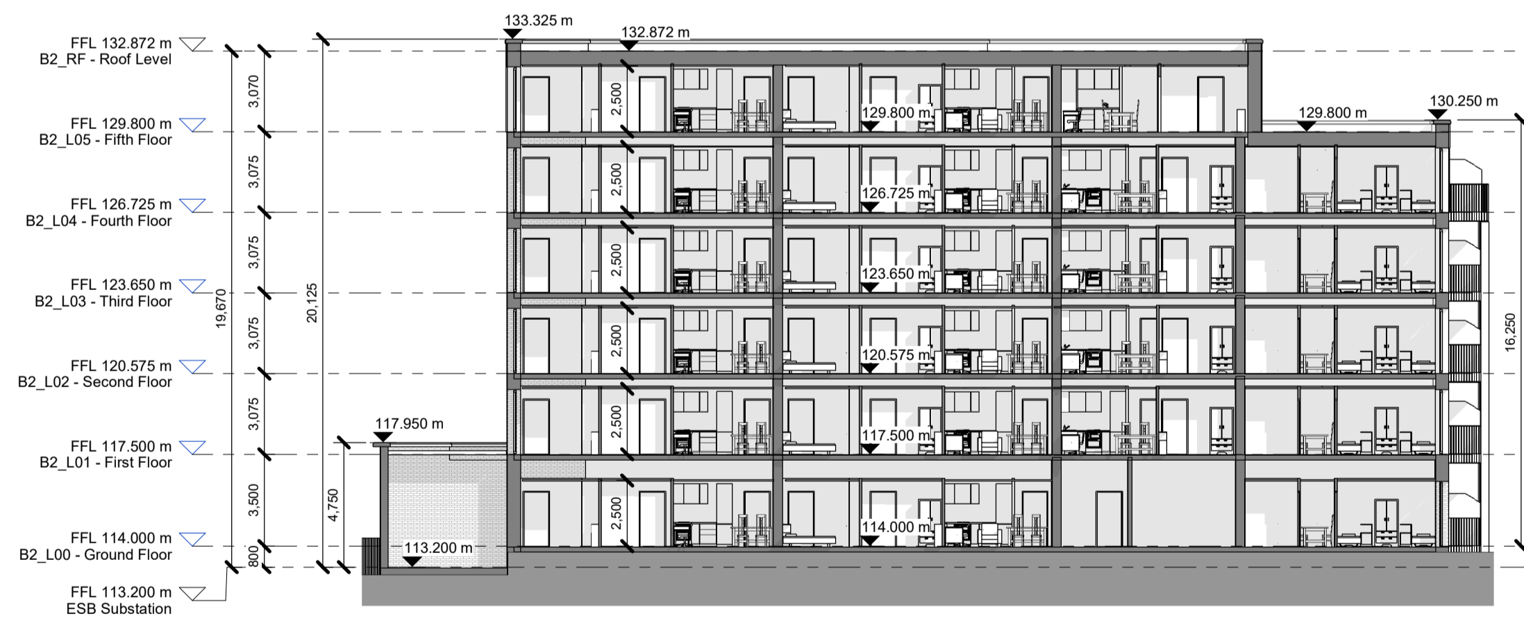
Block 2 Section 4 1 : 200

Notes: - Do not scale from this drawing. Use figured dimensions in all cases. - Verify dimensions on site and report any discrepancies to the Architect immediately. - This drawing is to be read in conjunction with the Architect's Specification. - © This drawing is copyright and may only be reproduced with the Architect's permission.