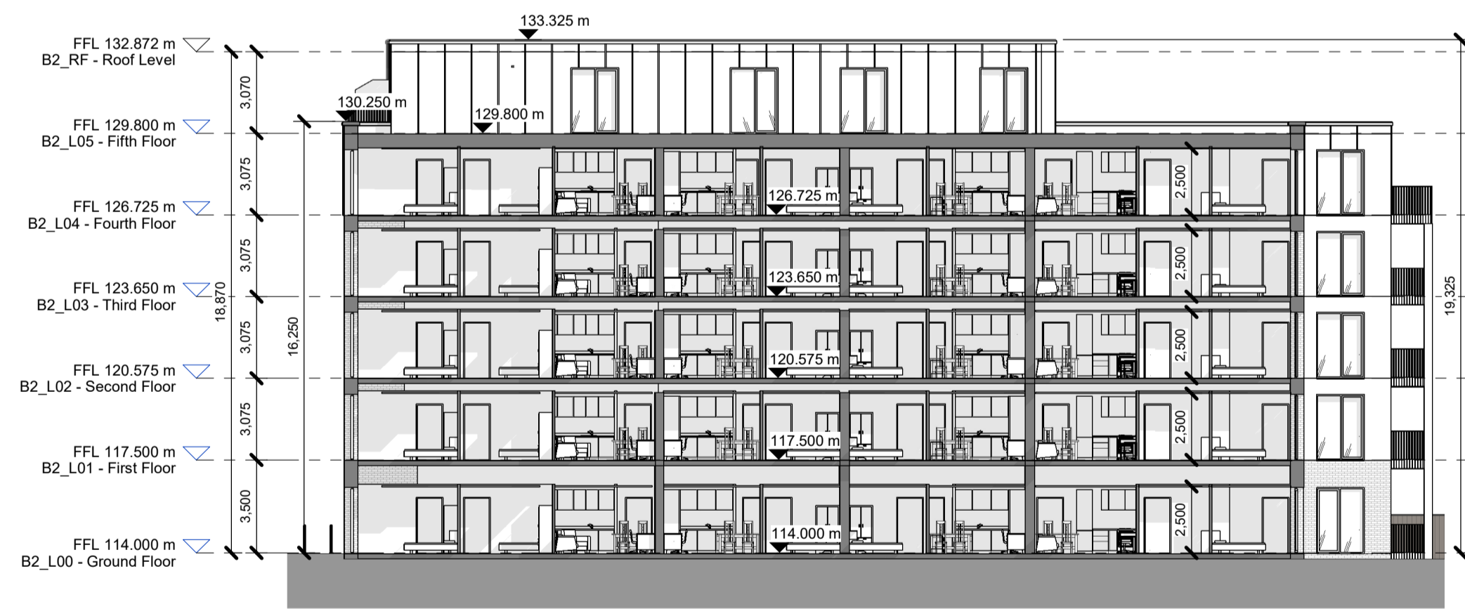
Block 2 Section 3 1 : 200