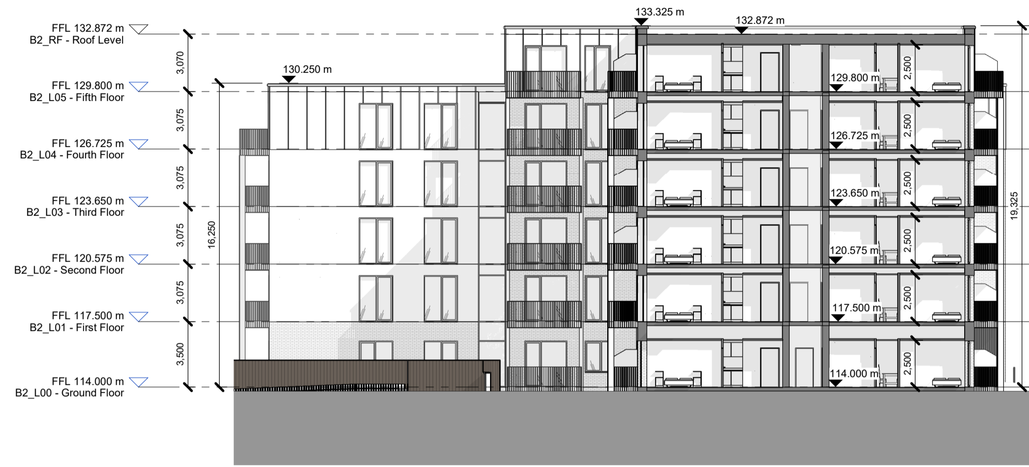
Block 2 Section 1 1 : 200