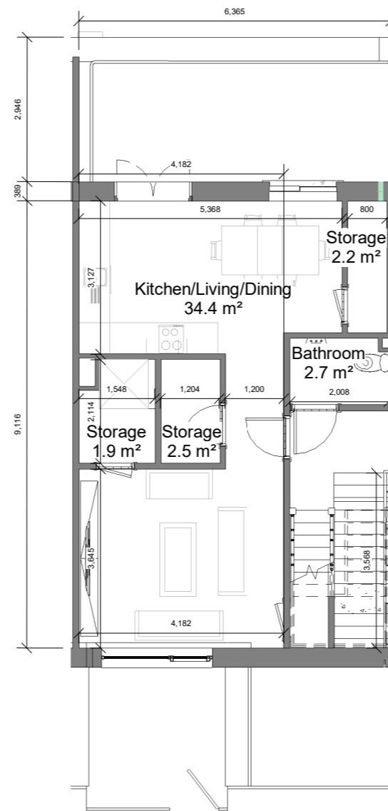
3B5P Type 5A_First Floor 1 : 100