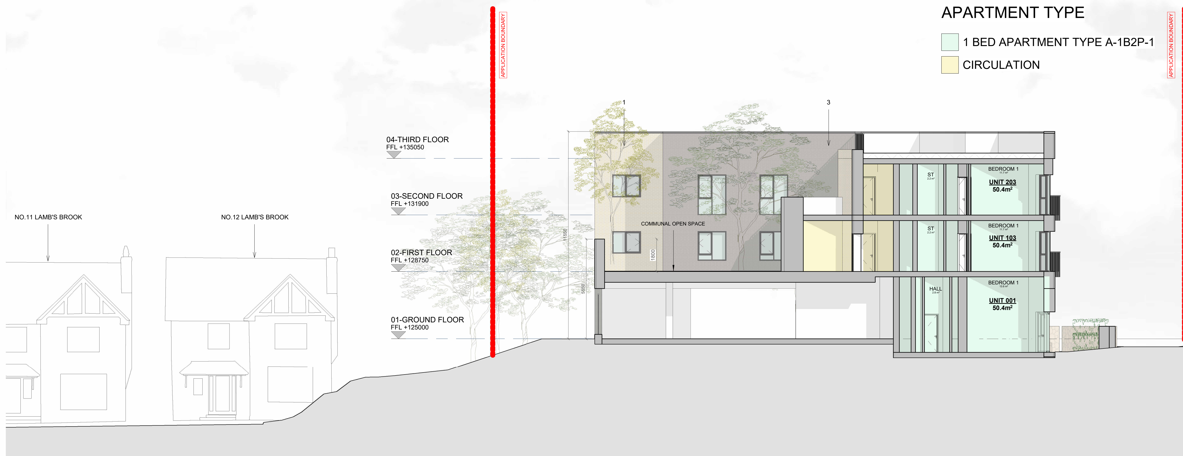
SECTION D-D SCALE: 1 : 100