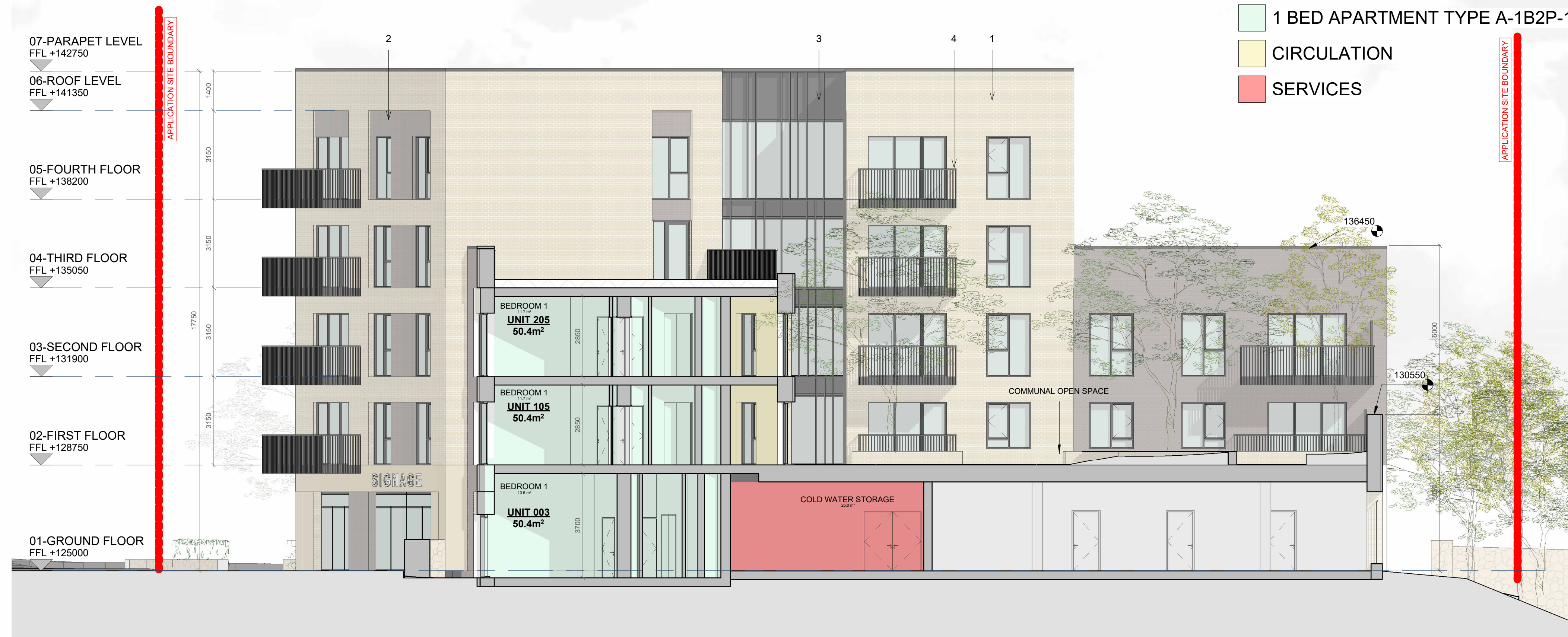
SECTION C-C SCALE: 1 : 100