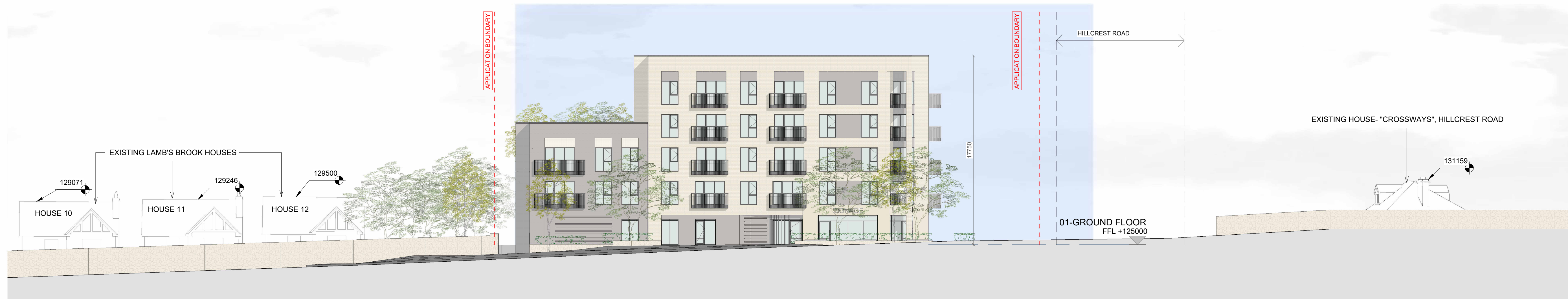
SANDYFORD ROAD ELEVATION SCALE: 1 : 200

THIS DRAWING TO BE READ IN CONJUNCTION WITH ALL ARCHITECT'S DRAWINGS, SPECIFICATIONS CONSULTANTS' DESIGN TEAM DRAWINGS AND SPECIFICATIONS.