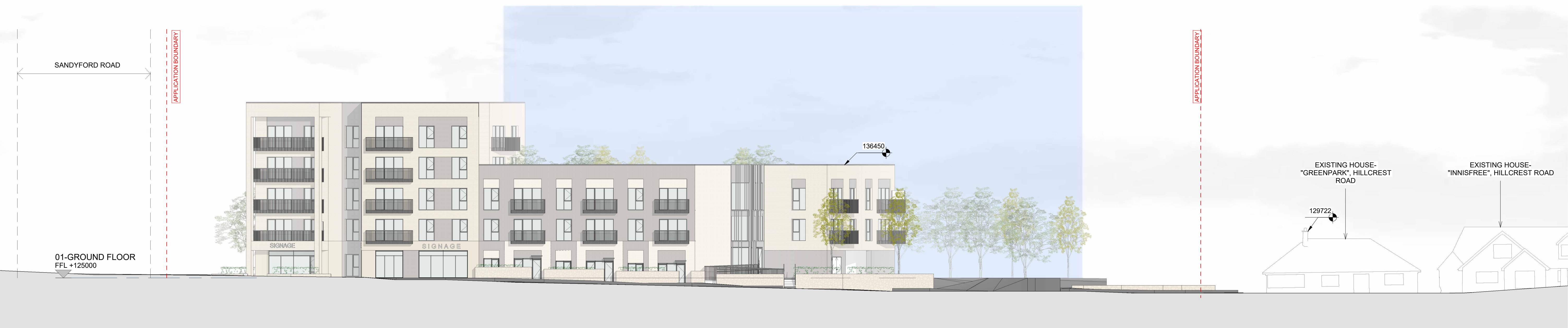
HILLCREST ROAD ELEVATION SCALE: 1 : 200