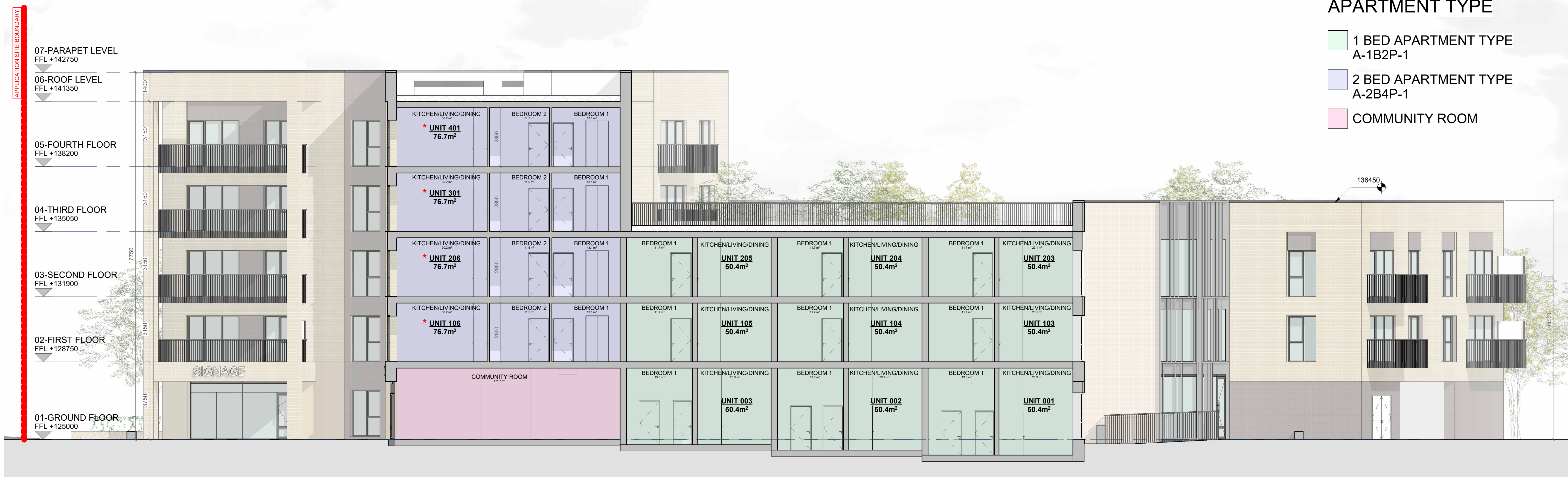
SECTION A-A SCALE: 1 : 100