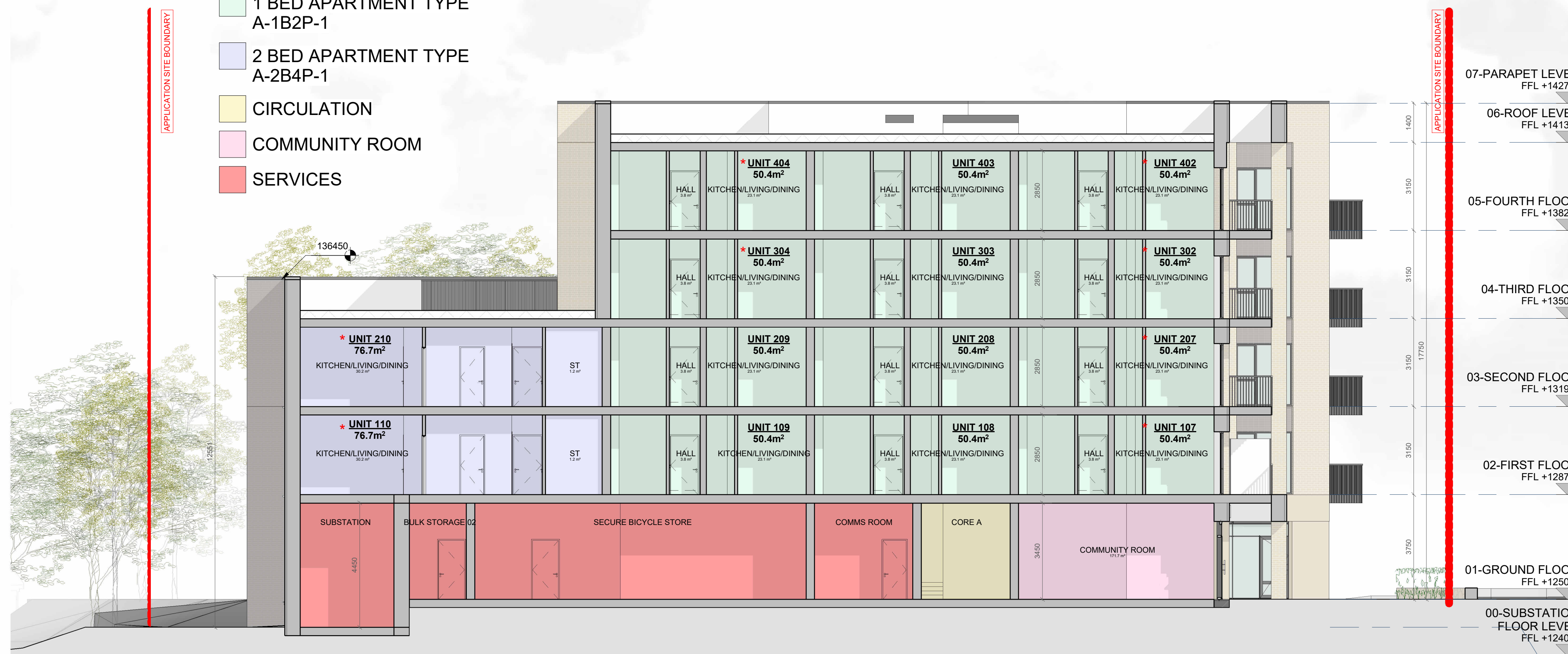
SECTION B-B SCALE: 1 : 100