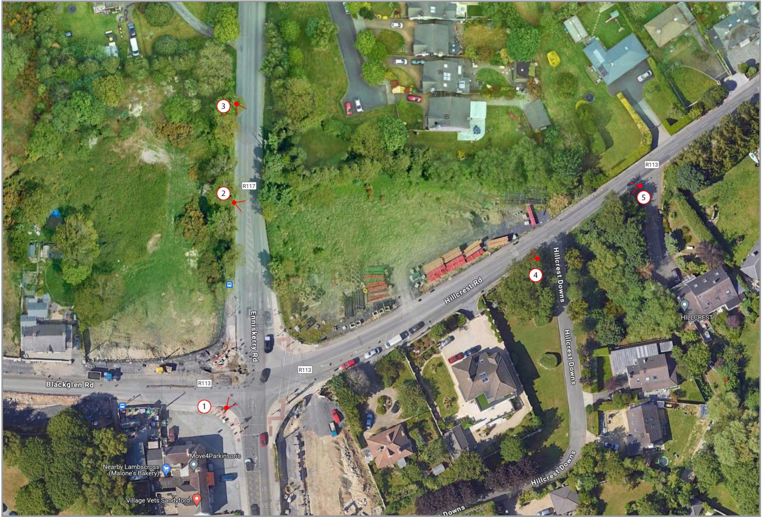
View Location Map

This map is for view location purposes only. Please refer to Architects drawings for site layout and redline boundary.