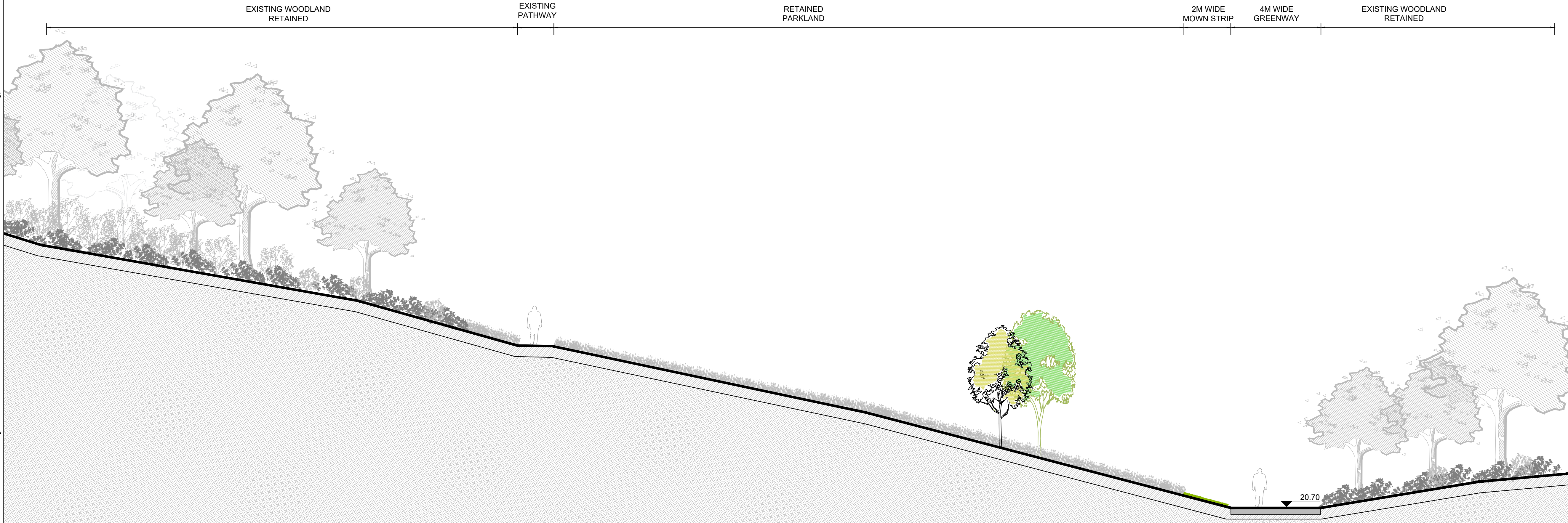
D | CHERRYWOOD BUSINESS PARK GREENWAY SECTION 6001 Scale 1:100@A1