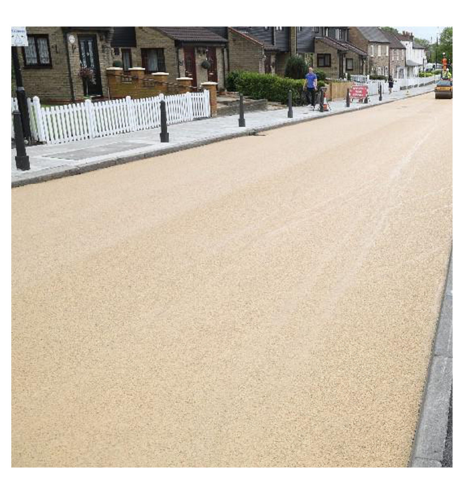
P3 - HIGH FRICTION SURFACE