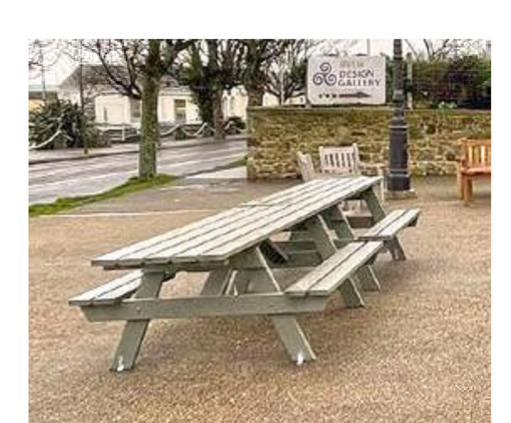
F1 - FIXED FURNITURE - PICNIC TABLE (ALTERNATE)