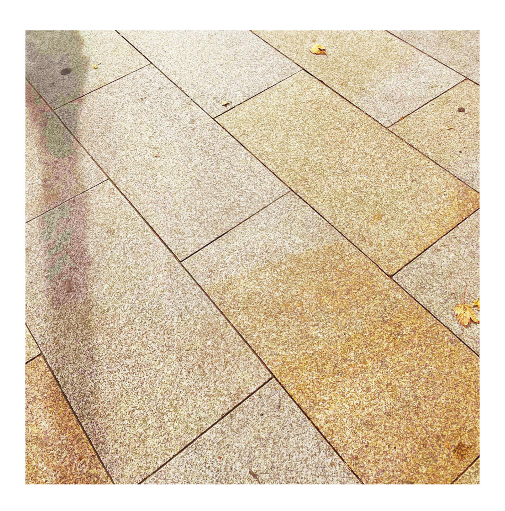
P1 - GRANITE PAVING FLAGS (BUFF COLOUR TO FOOTPATH)