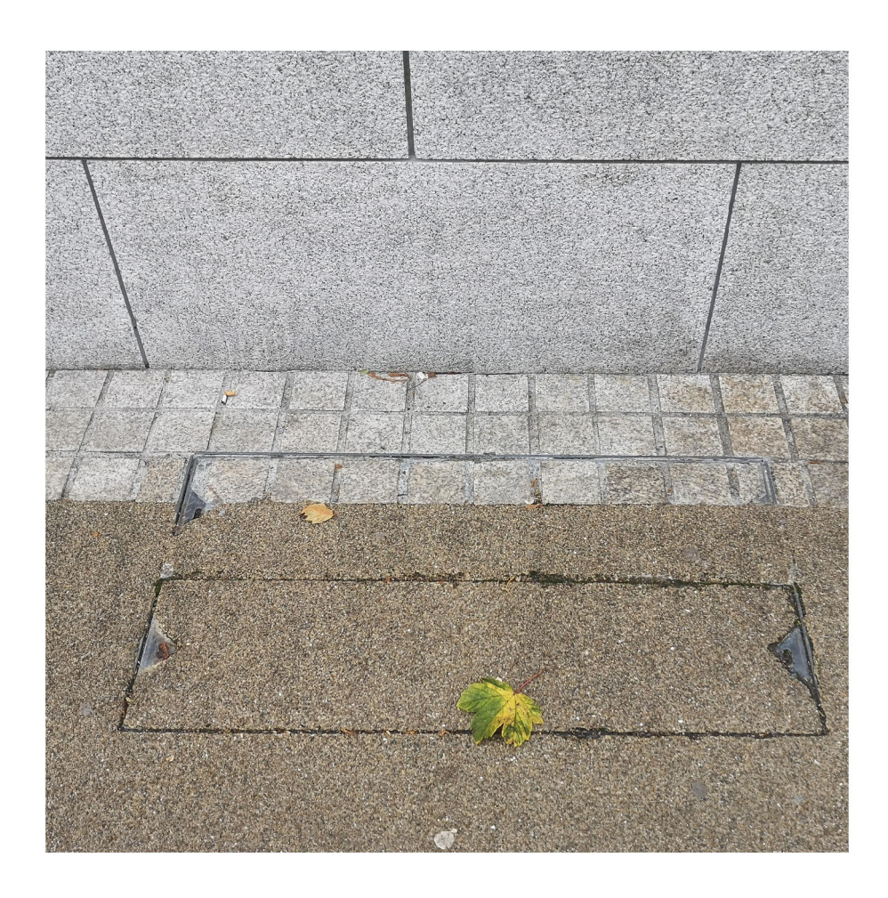
P1 - GRANITE PAVING SETS TO BUILDING EDGE