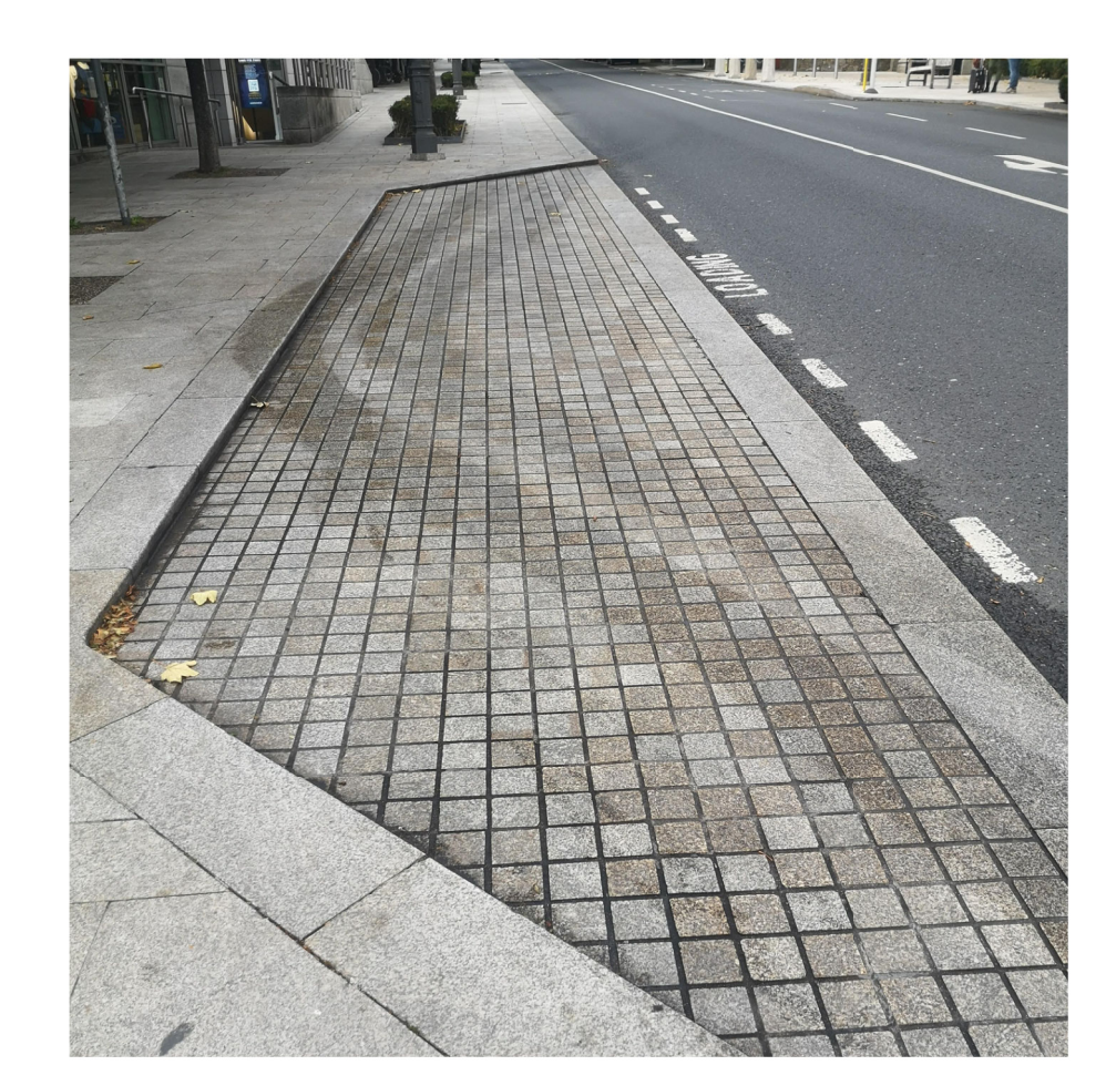
P5 - GRANITE SETS (TO PARKING BASE)