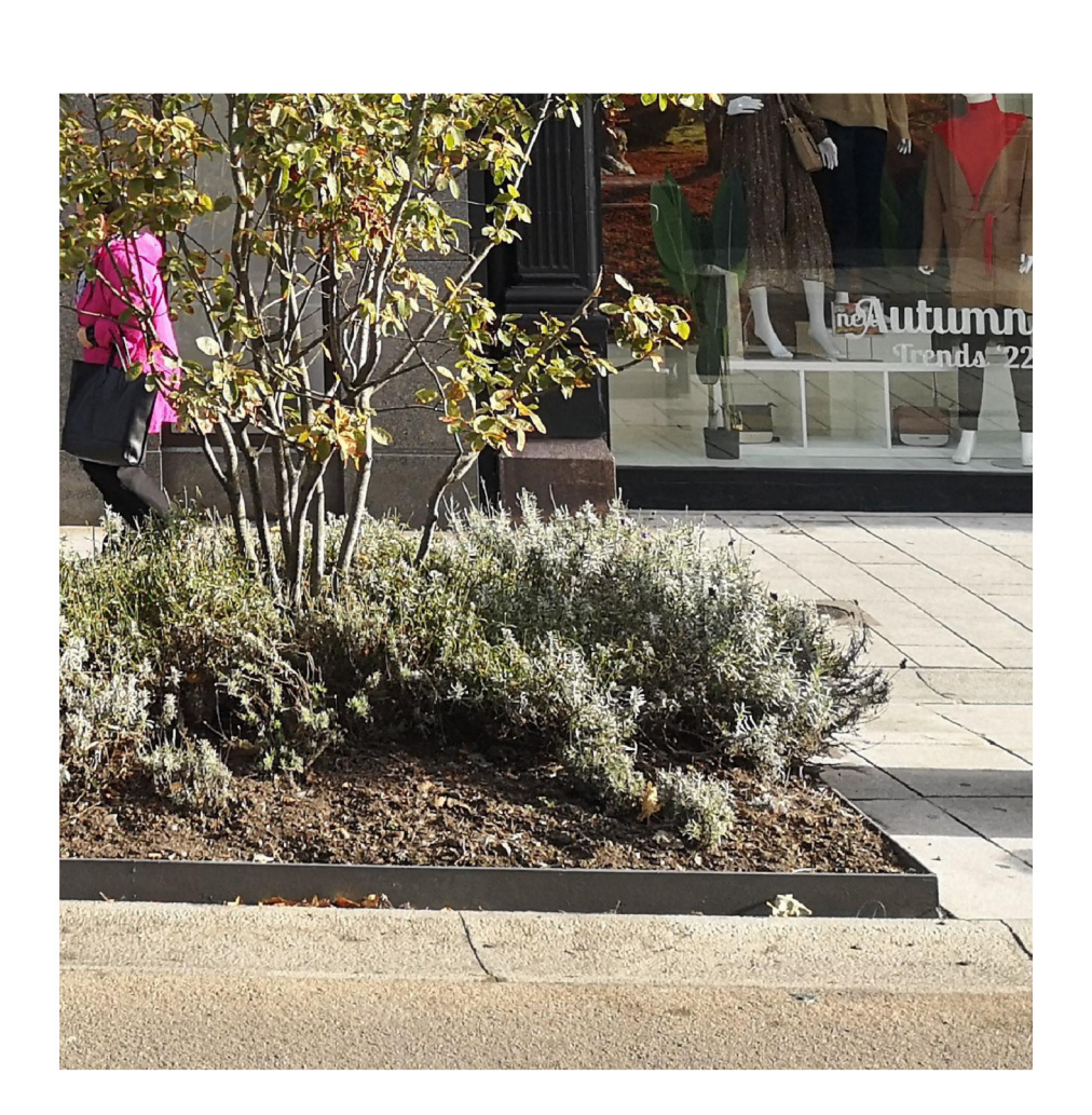
STEEL PLANTER EDGE

ALL DIMENSIONS TO BE CHECKED ON SITE NO DIMENSIONS TO BE SCALED FROM THIS DRAWING THIS DRAWING IS TO BE READ IN CONJUNCTION WITH RELEVANT CONSULTANTS DRAWINGS NO PART OF THIS DOCUMENT MAY BE RE-PRODUCED OR TRANSMITTED IN ANY FORM OR STORED IN ANY RETRIEVAL SYSTEM OF ANY NATURE WITHOUT THE WRITTEN PERMISSION OF THE LANDSCAPE ARCHITECT AS COPYRIGHT HOLDER EXCEPT AS AGREED FOR USE ON THE PROJECT FOR WHICH THE DOCUMENT WAS ORIGINALLY ISSUED. FOR DRAWING INDEX, GENERAL NOTES, REFER TO DWG L1-001