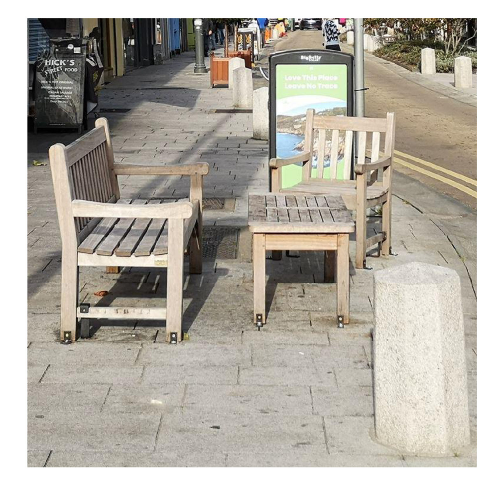
F1 - FIXED FURNITURE - TABLE AND CHAIR (ALTERNATE)