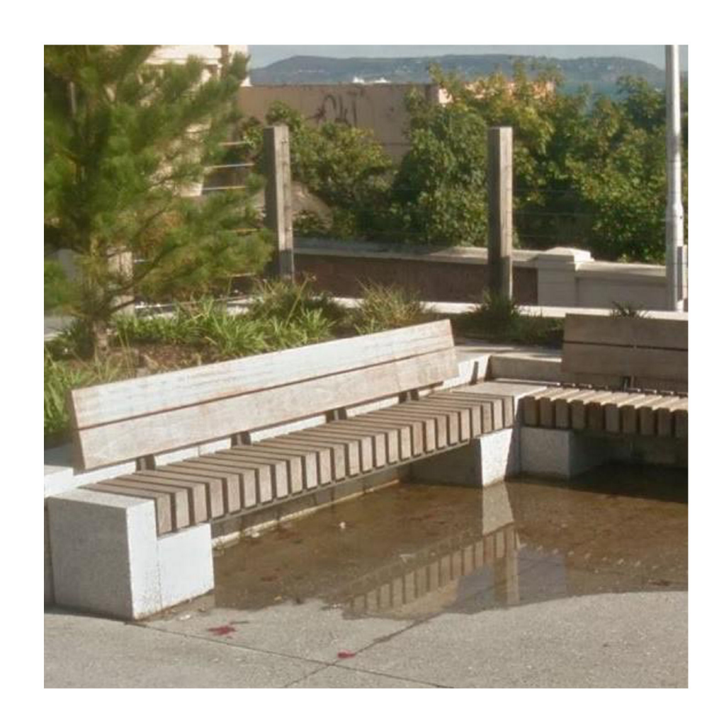
F1 - FIXED FURNITURE (BENCHES)