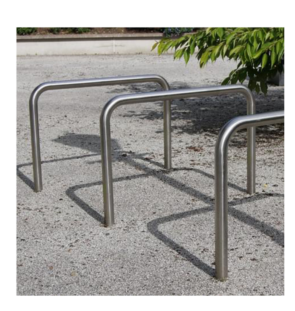
SHEFFILD BIKE STAND